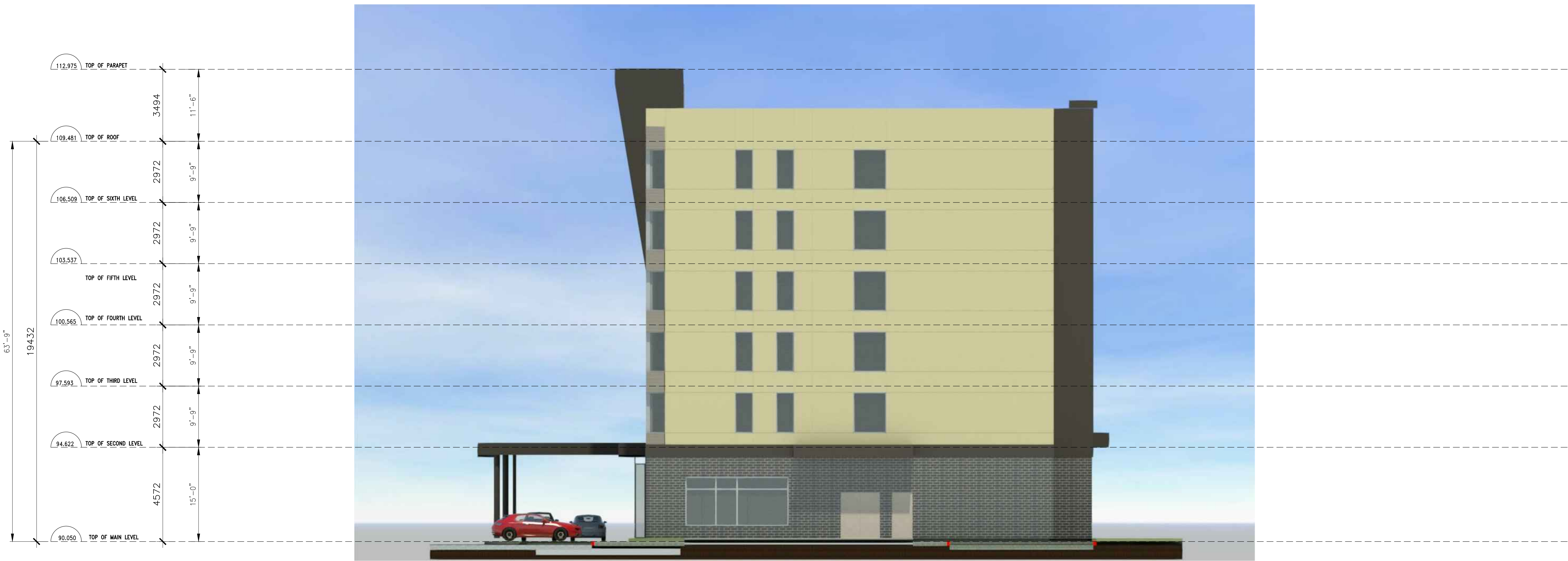
1 ELEVATION WEST AE01 1:100