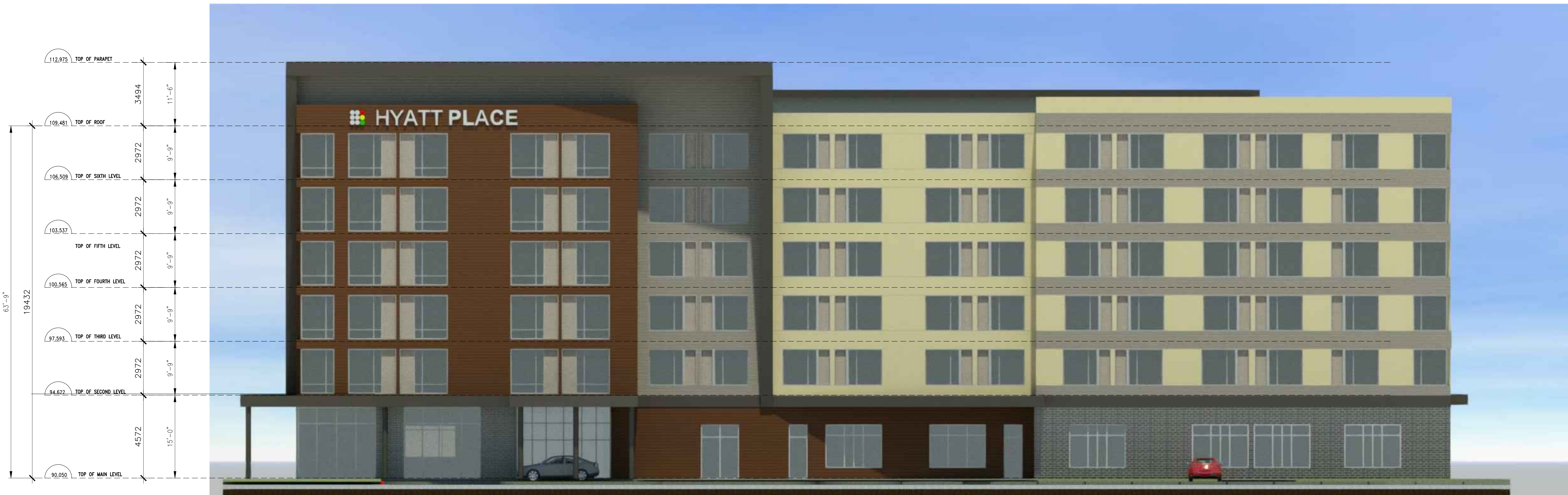
2 ELEVATION NORTH AE01 1:100