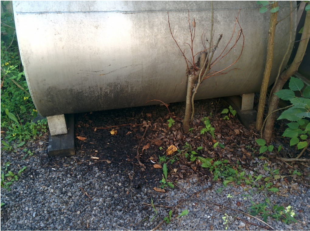
Photo 13: View of an actively used AST (APEC 2C) on the Equipment Storage Area occupied by M-Roc Ltd. Slight staining and odour observed. Facing northeast.