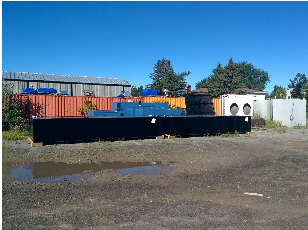
Photo 1: View of the AST/Generator Storage Area occupied by Gal Power Systems Ottawa. Facing southwest.