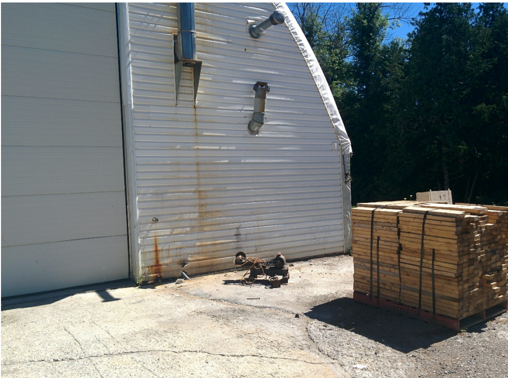
Photo 18: View of the west wall of Cover-All Structure, where the out-of-service AST (Former AST) was located in the April 2016 site visit. Visible staining was observed. Facing northeast.