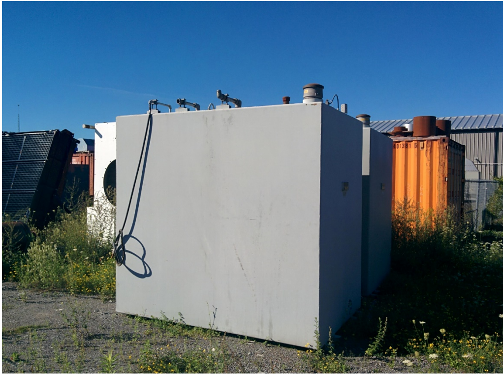
Photo 5: View of new/used ASTs in the AST/Generator Storage Area occupied by Gal Power Systems Ottawa. No staining/odour observed. Facing southwest.