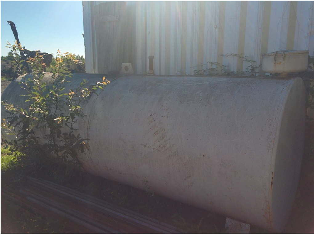
Photo 11: View of an actively used AST (APEC 2B) on the Equipment Storage Area occupied by M-Roc Ltd. No staining/odour observed. Facing northeast.