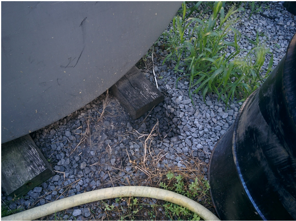
Photo 9: View of an actively used diesel AST (APEC 2A) and slight ground staining on the Equipment Storage Area occupied by M-Roc Ltd. Facing north.