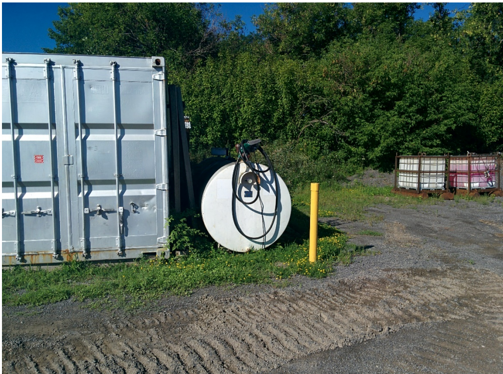
Photo 10: View of an actively used AST (APEC 2B) on the Equipment Storage Area occupied by M-Roc Ltd. No staining/odour observed. Facing southwest.