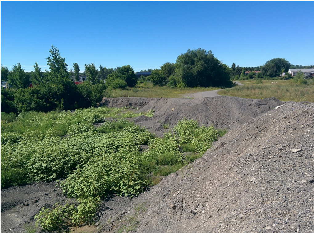
Photo 16: View of imported fill area immediately northeast of the Equipment Storage Area. The area consists of coarse granular material. Facing southeast.