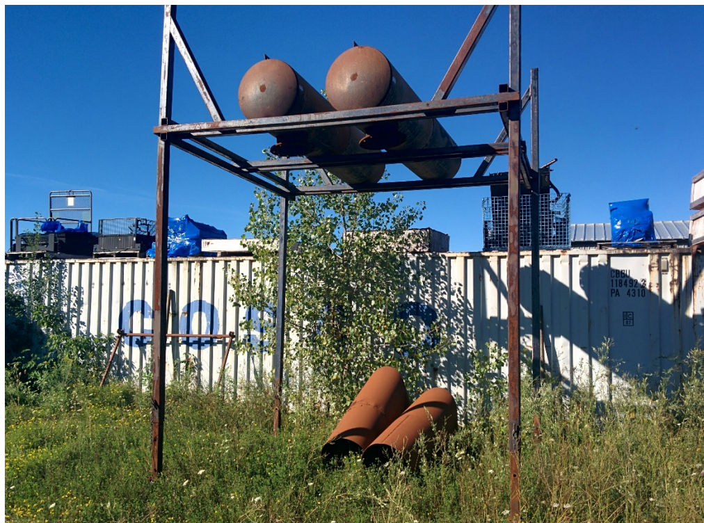
Photo 4: View of used ASTs in the AST/Generator Storage Area occupied by Gal Power Systems Ottawa. No staining/odour observed. Facing southwest.