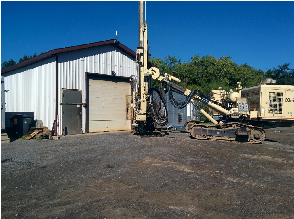
Photo 6: View of the maintenance garage and drilling equipment in the Equipment Storage Area occupied by M-Roc Ltd. Facing southwest.