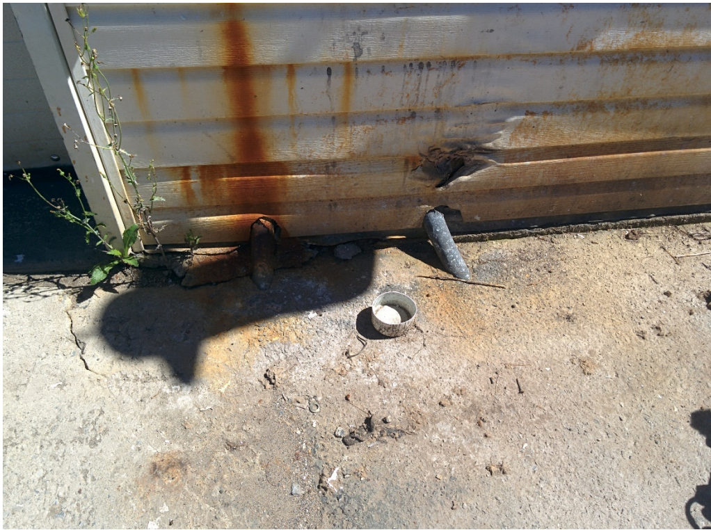
Photo 19: View of the west wall of Cover-All Structure, where the out-of-service AST (Former AST) was located in the April 2016 site visit. Visible staining was observed. Facing northeast.