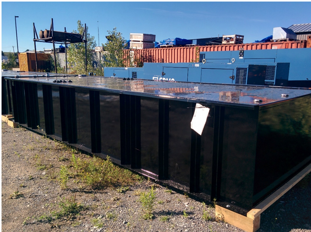
Photo 2: View of the AST/Generator Storage Area occupied by Gal Power Systems Ottawa. No staining/odour observed. Facing southwest.