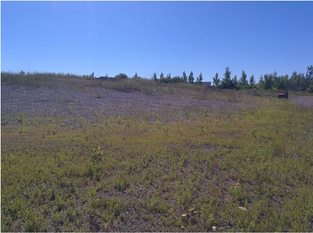
Photo 15: View of imported fill area immediately northeast of the Equipment Storage Area (APEC 1E). The area consists of coarse granular material. Facing southeast.