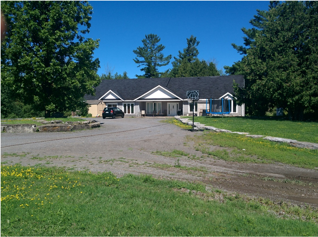
Photo 17: View of the onsite residence, which appears to have remained unchanged from the 2016 Phase One ESA. Facing north.