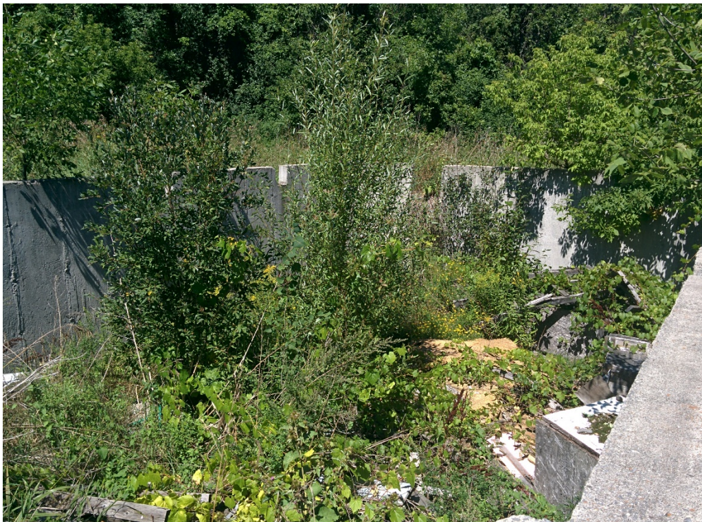
Photo 20: View of concrete foundation with wood debris identified in the 2016 Phase One ESA.