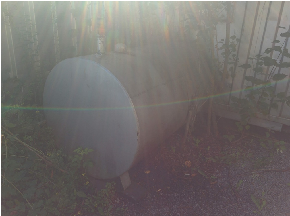
Photo 12: View of an actively used AST (APEC 2C) on the Equipment Storage Area occupied by M-Roc Ltd. Slight staining and odour observed. Facing northeast.