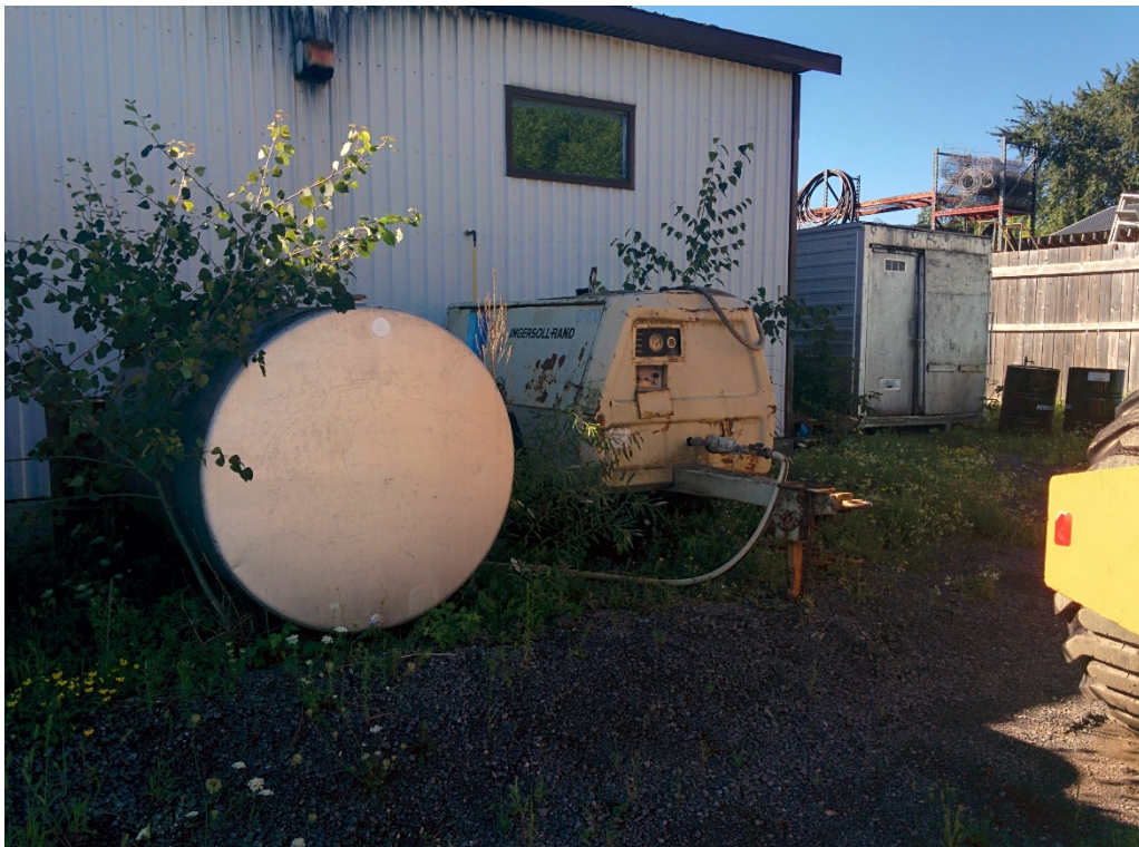
Photo 8: View of an actively used diesel AST (APEC 2A) on the Equipment Storage Area occupied by M-Roc Ltd. Facing south.