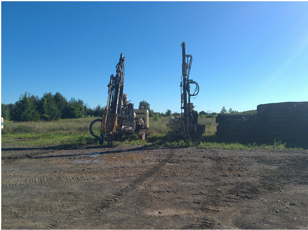
Photo 7: View of stockpiled scrap rubber tires and drilling equipment on the Equipment Storage Area occupied by M-Roc Ltd. Facing northeast.