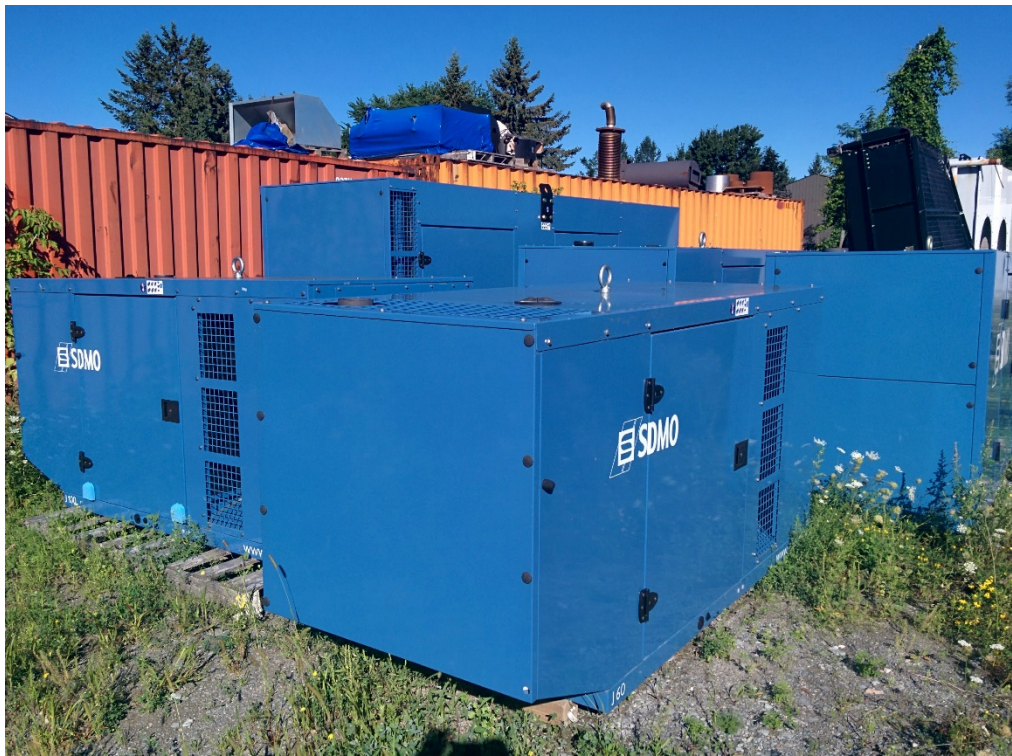
Photo 3: View of new generators in the AST/Generator Storage Area occupied by Gal Power Systems Ottawa. Facing southwest.