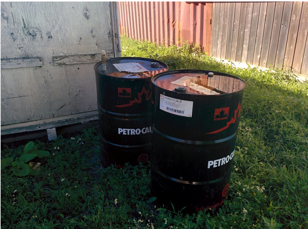
Photo 14: View of hydraulic oil drums on the Equipment Storage Area occupied by M-Roc Ltd. No evidence of contamination. Facing southeast.