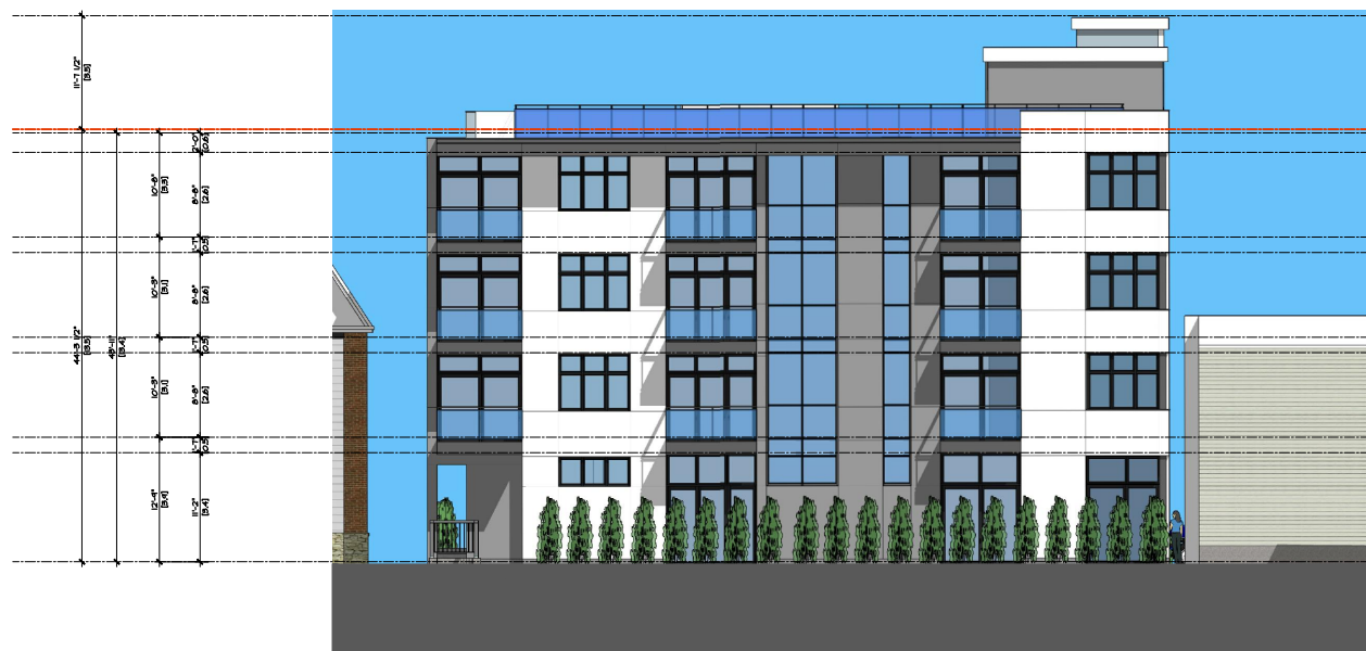
REAR / WEST/ ELEVATION