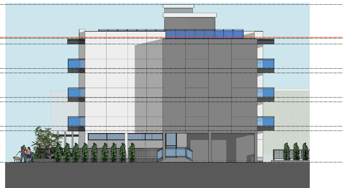
SIDE / WEST/ ELEVATION