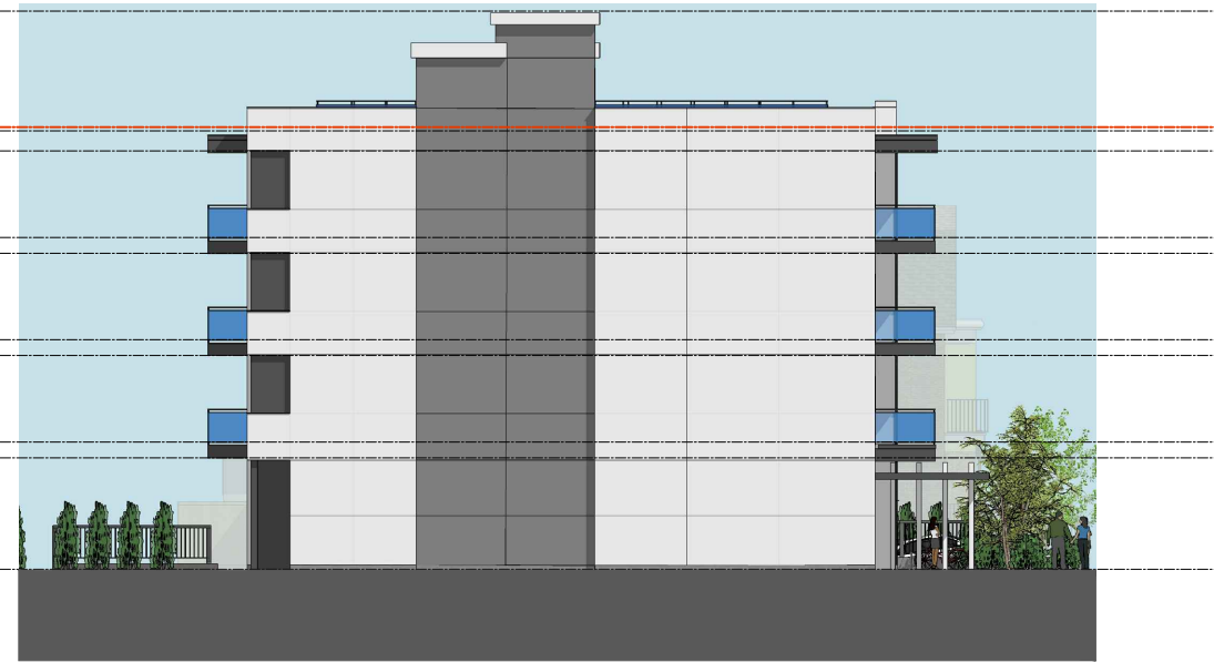
SIDE /SOUTH/ ELEVATION