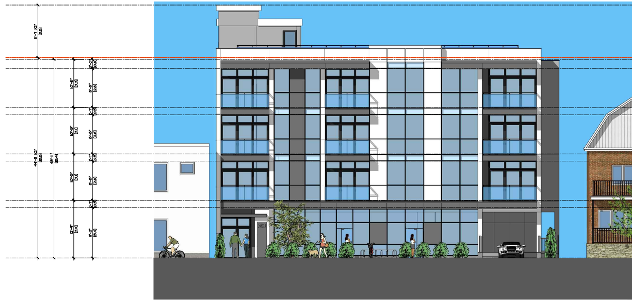
FRONT /EAST/ ELEVATION