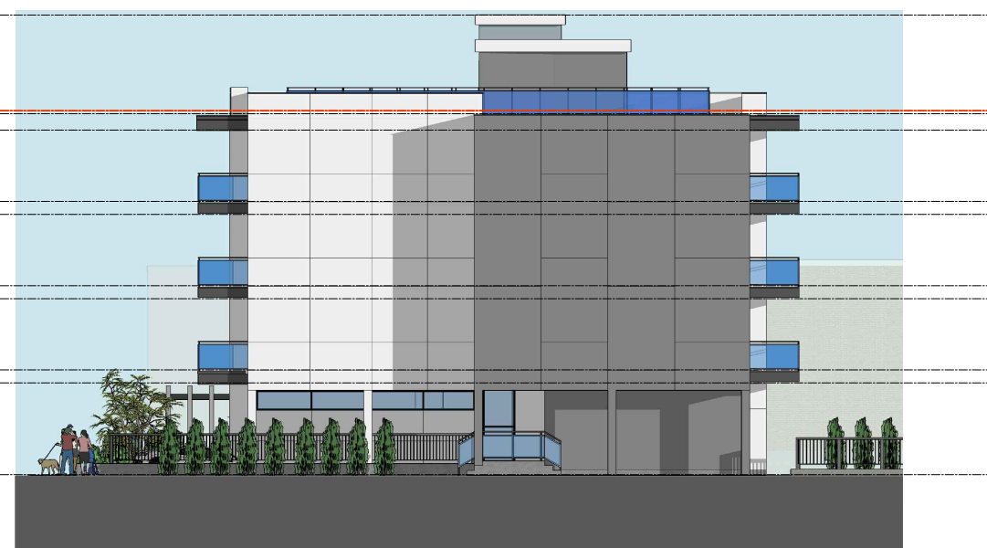
SIDE / WEST/ ELEVATION