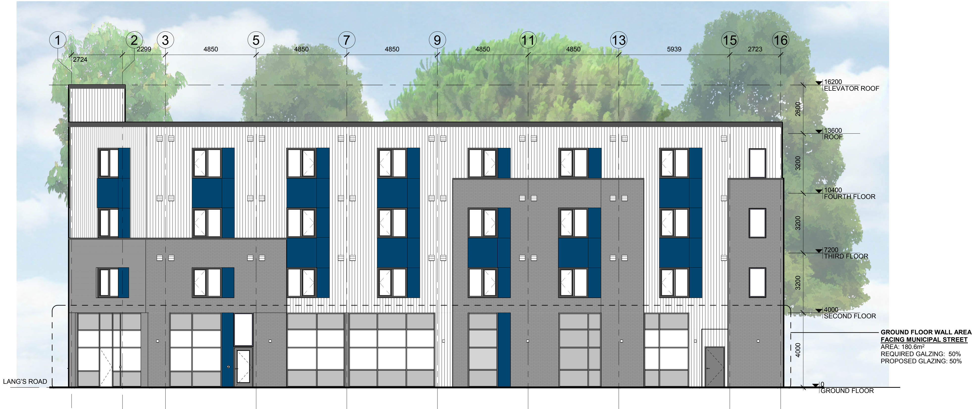
1 ELEVATION - SOUTH A301 1:100