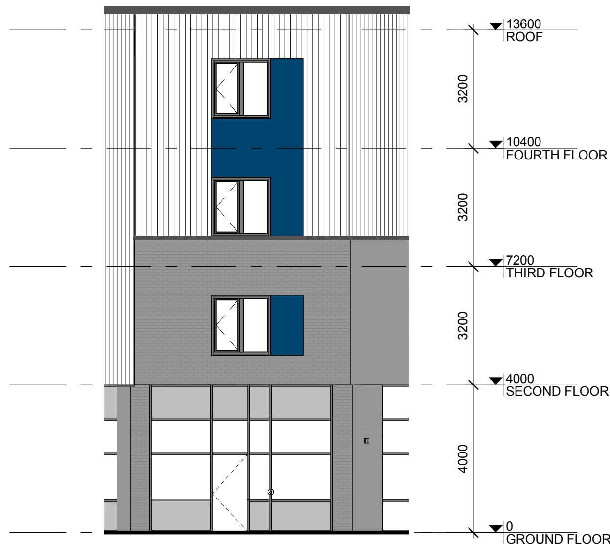
3 ELEVATION - SOUTH - WEST ANGLE A301 1:100

CONTRACTOR TO COORDINATE WITH MANUFACTURER'S SPECIFICATIONS AND INSTALLATIONS GUIDELINES FOR ALL MATERIAL SEALING, TRANSITIONS, SEPARATIONS, FLASHING DETAILS, CONNECTIONS, ANCHORAGES, ETC. CONTRACTOR TO PROVIDE DETAIL DRAWINGS OR MOCK-UP FOR ARCHITECT'S REVIEW AND APPROVAL FOR ALL SPECIAL CONDITIONS NOT SHOWN IN THE CONTRACT DOCUMENTS.