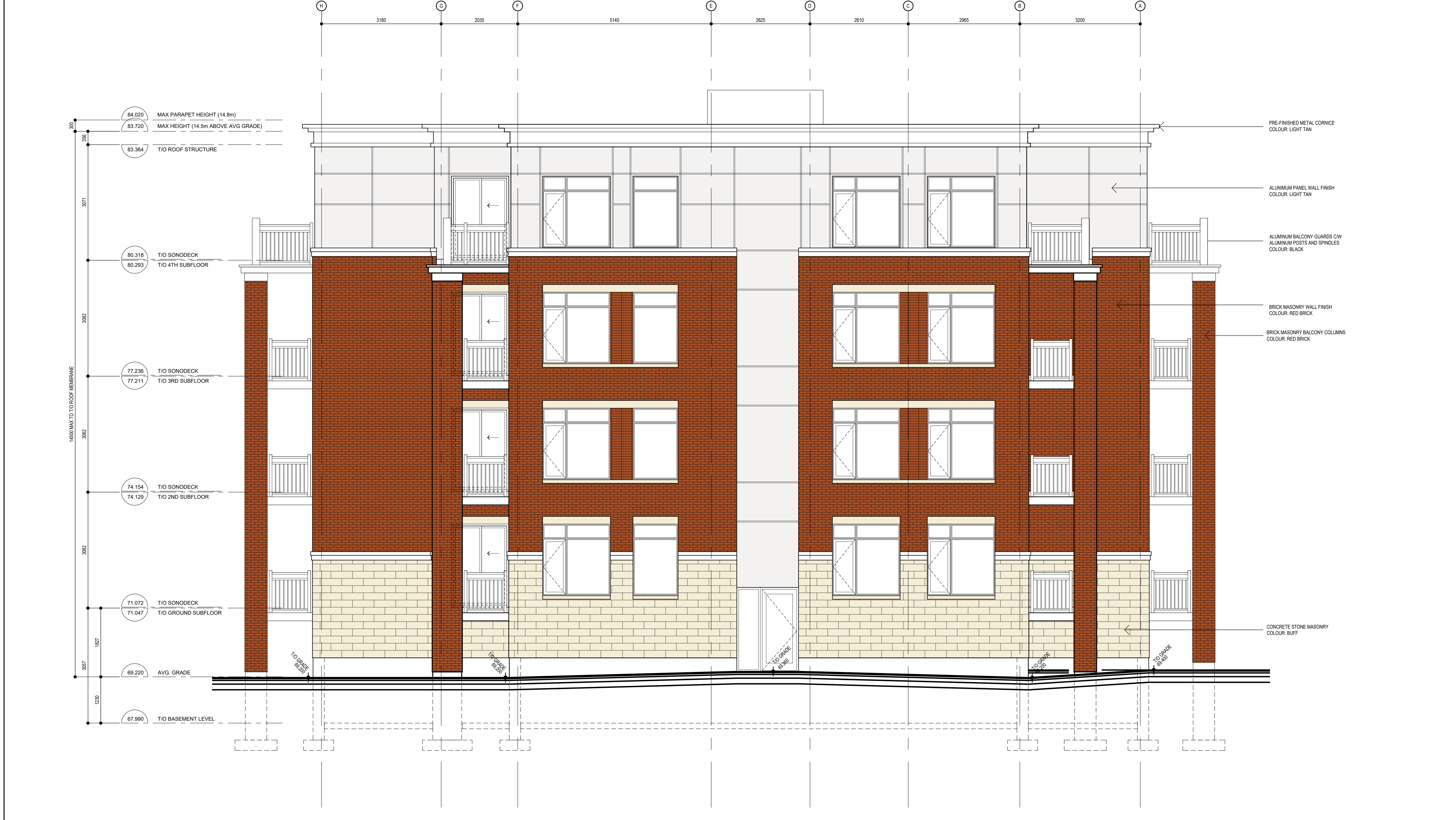
1 REAR ELEVATION SCALE 1:50

APPROVED By Douglas James at 12:07 pm, Jul 19, 2018