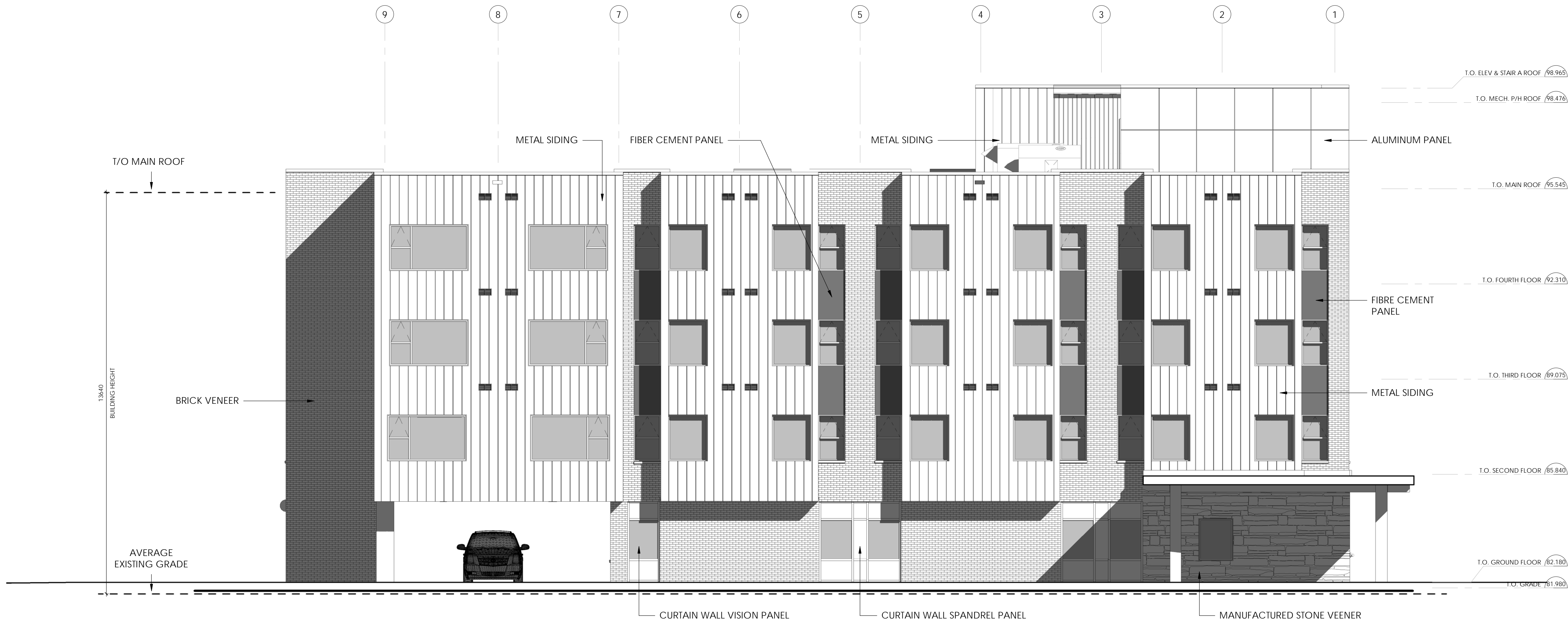
1 NORTH ELEVATION A201.1 SCALE: 1:75

ADAM BROWN MANAGER, DEVELOPMENT REVIEW - RURAL PLANNING, INFRASTRUCTURE & ECONOMIC DEVELOPMENT DEPARTMENT, CITY OF OTTAWA