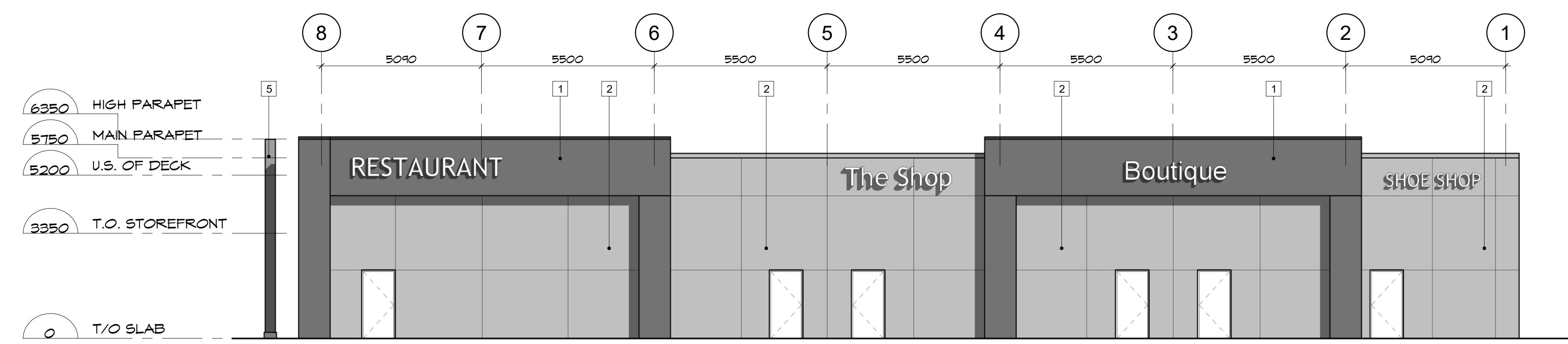
2 REAR ELEVATION1 D-A1 SCALE: 1:100