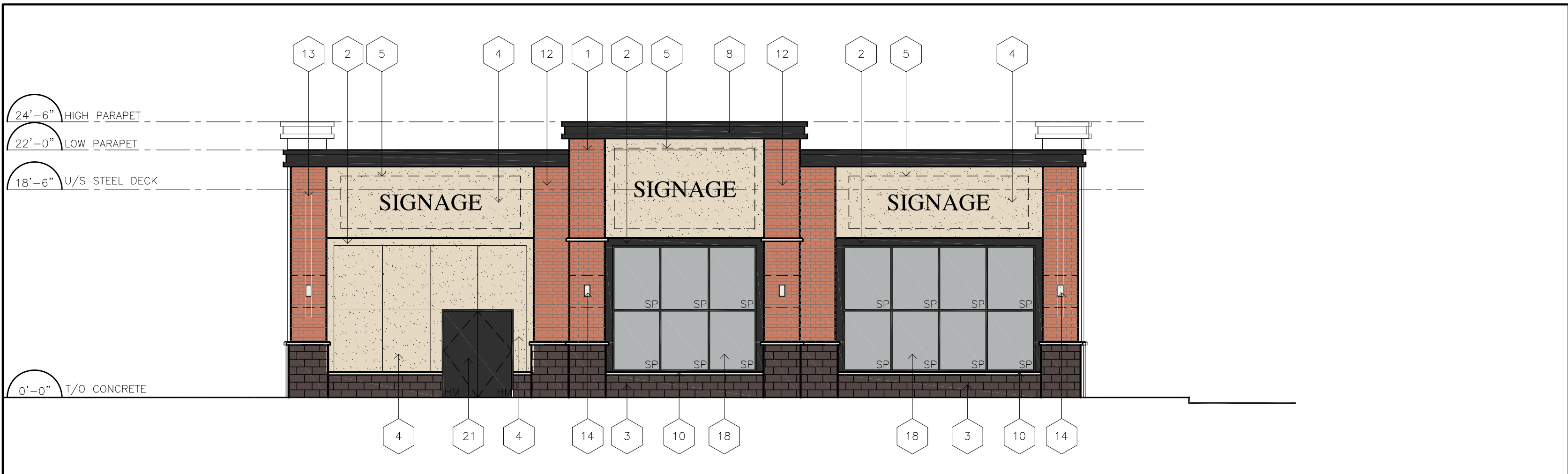
4 WEST ELEVATION