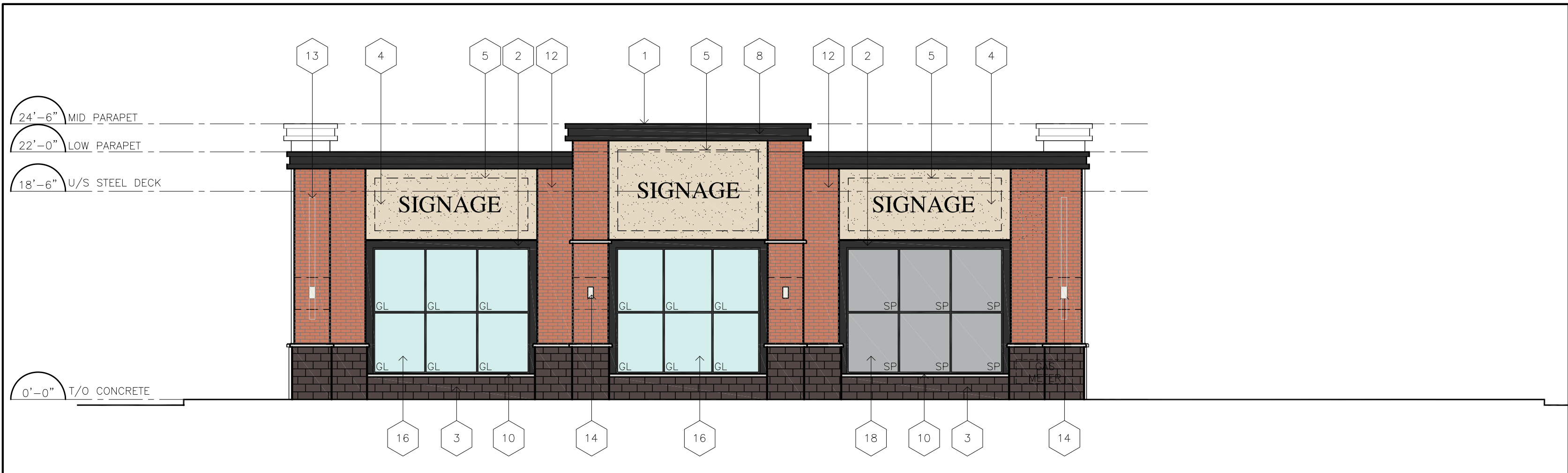
3 EAST ELEVATION