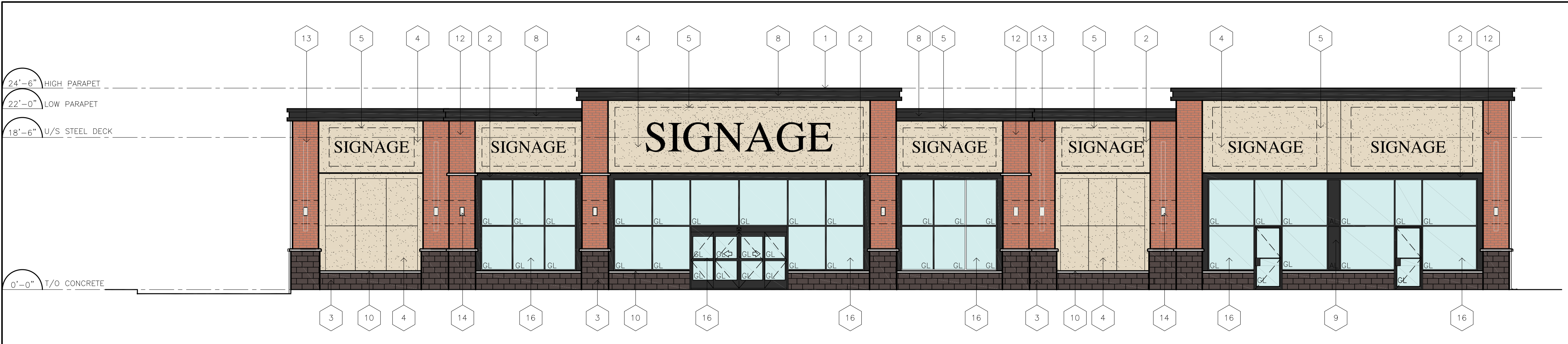
1 SOUTH ELEVATION