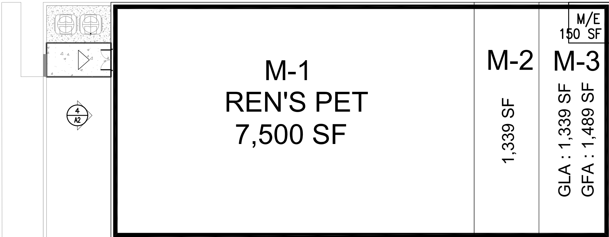
5 KEY PLAN