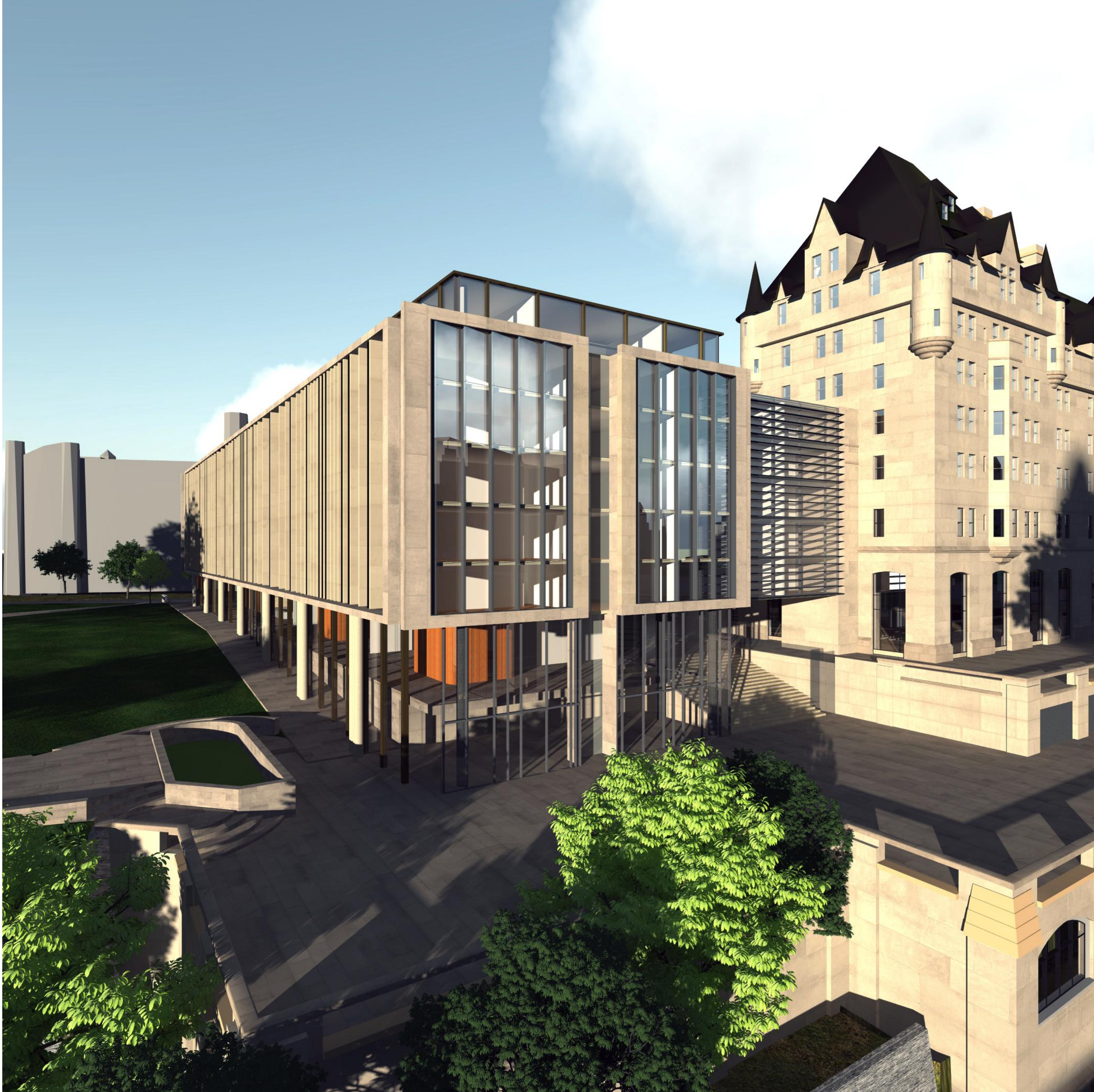
NW FACADE VIEW