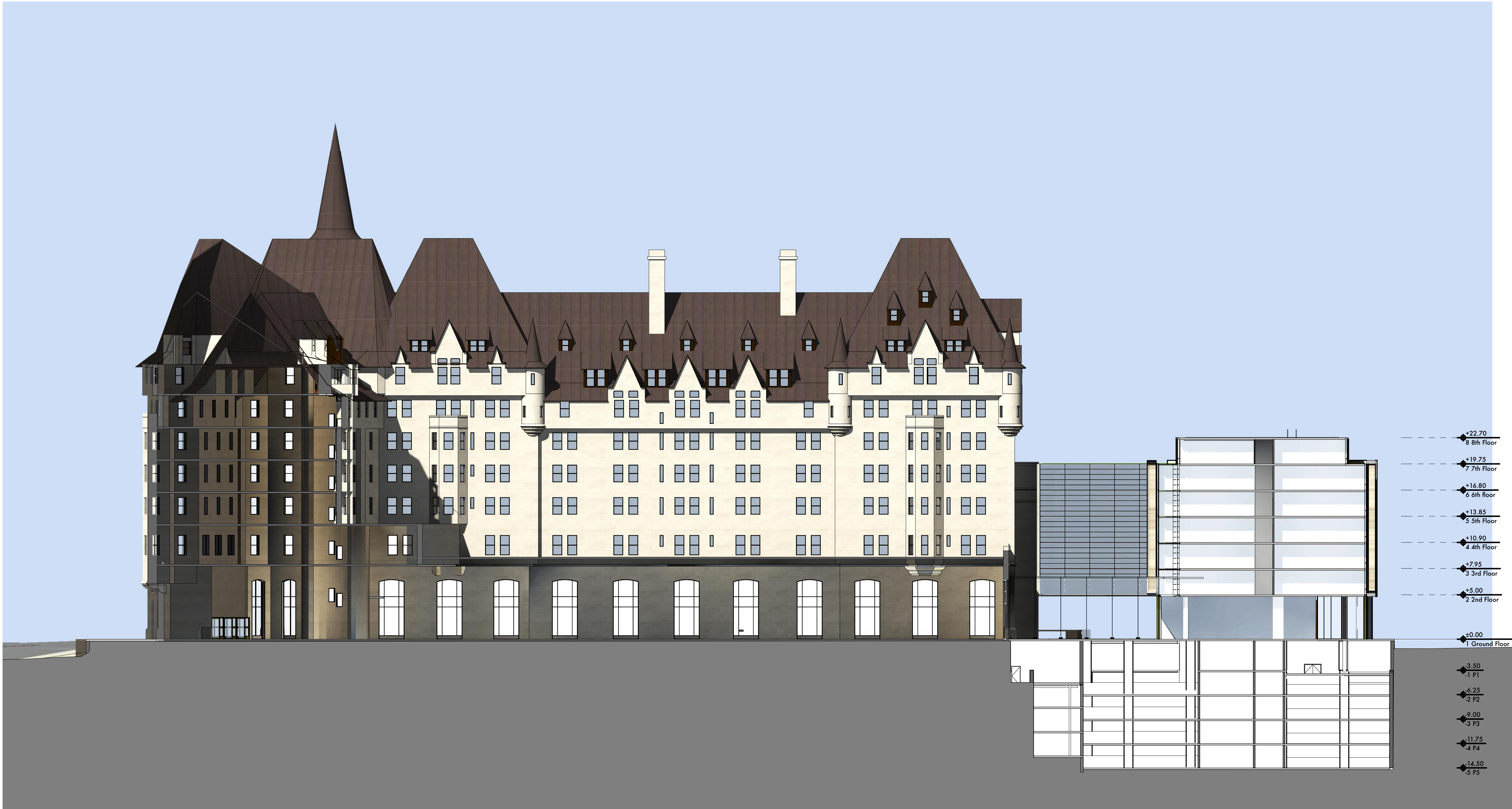
N S SECTION SCALE: 1:250