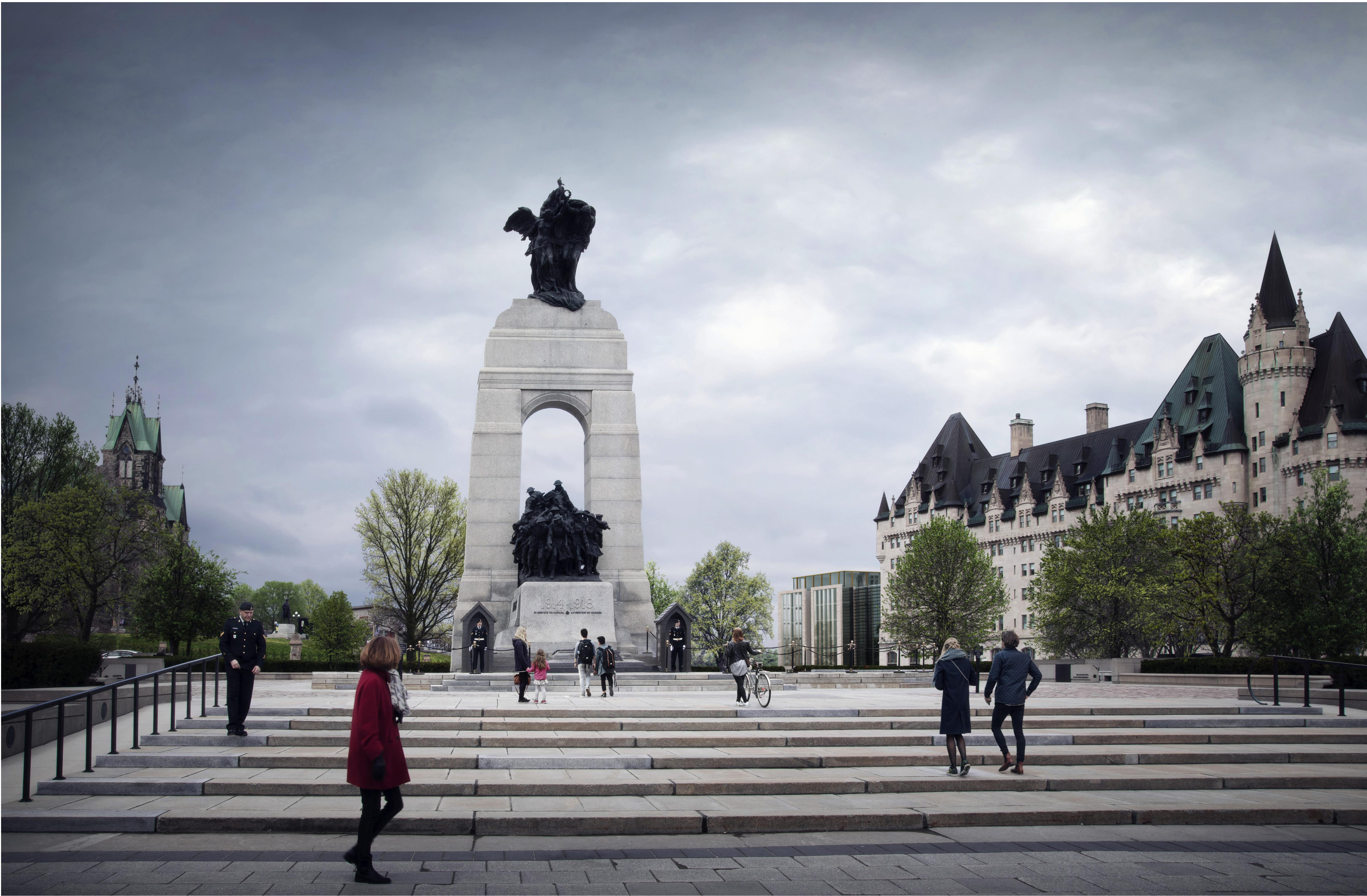
DAY VIEW 'B' FROM THE NATIONAL WAR MEMORIAL