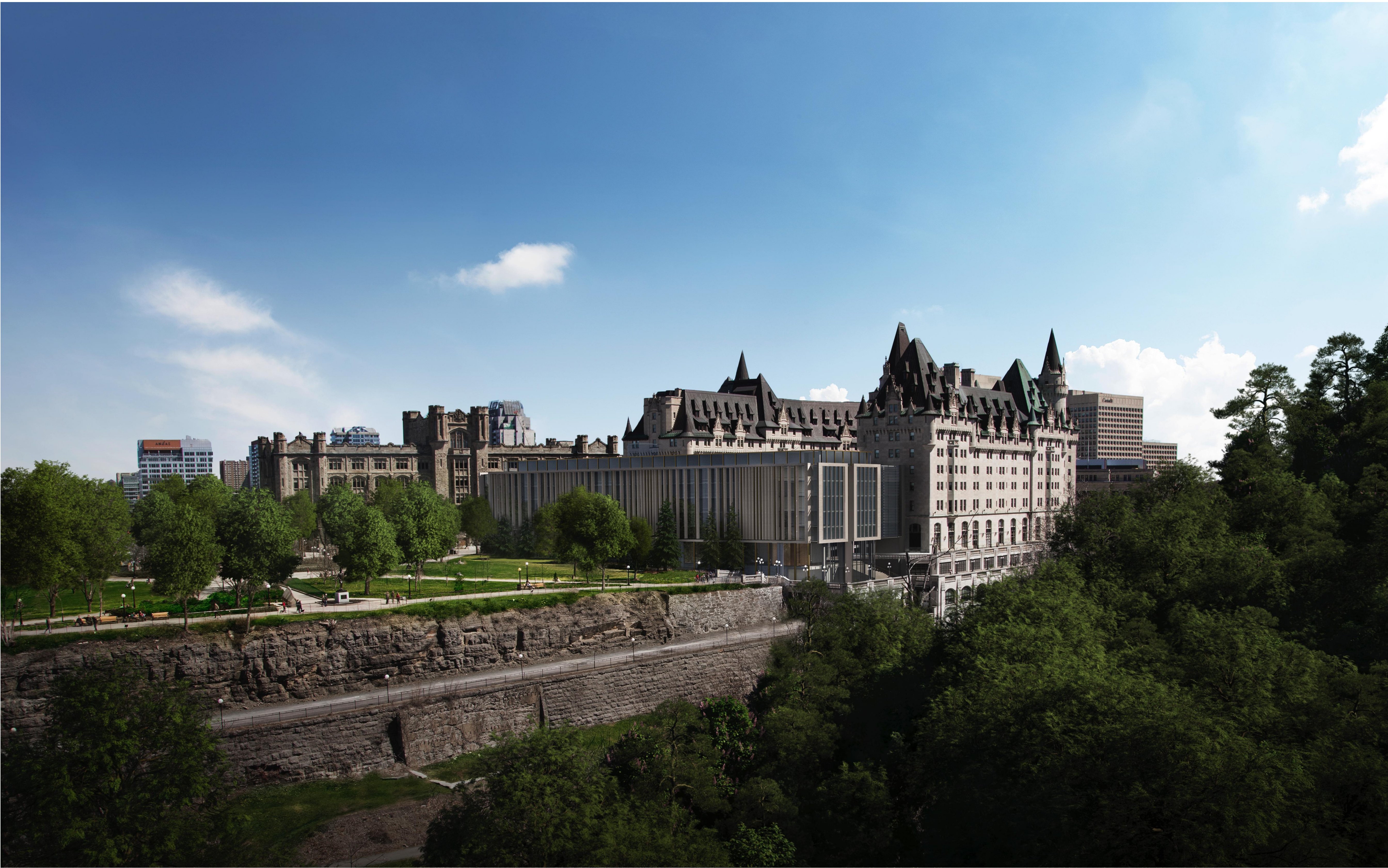
DAY VIEW 'D' FROM PARLIAMENT HILL