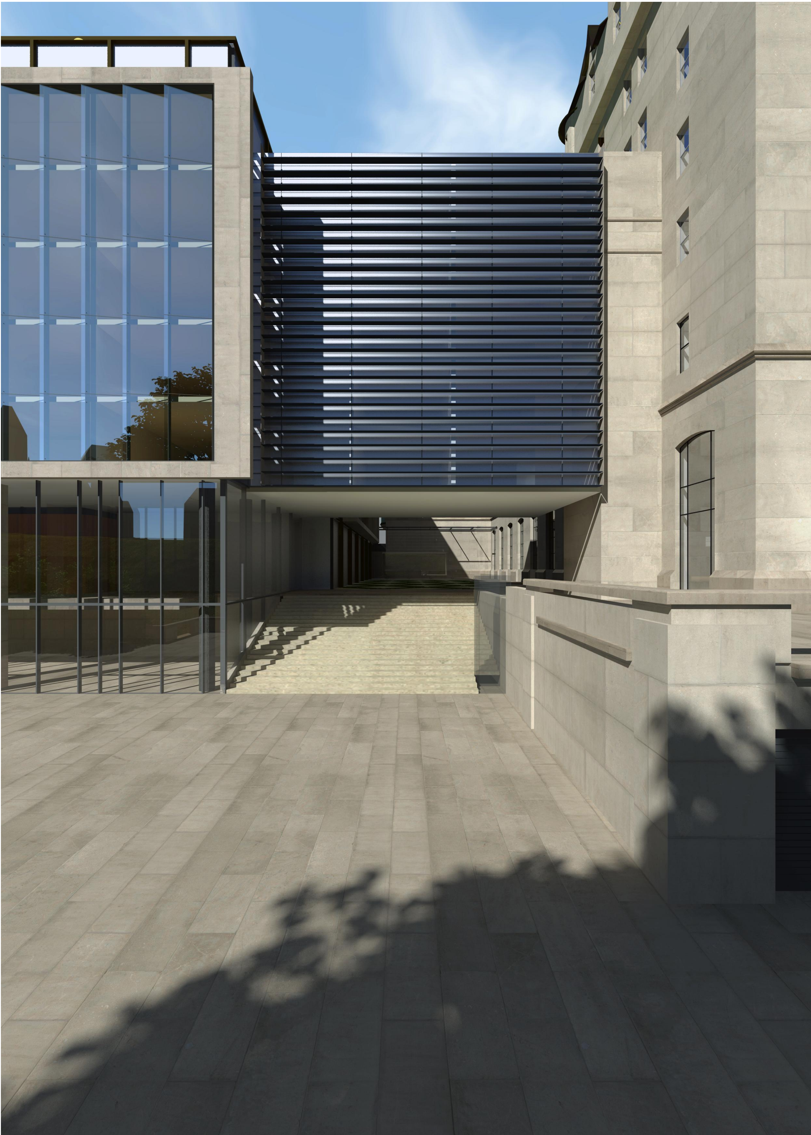
WEST ELEVATION VIEW NOT TO SCALE