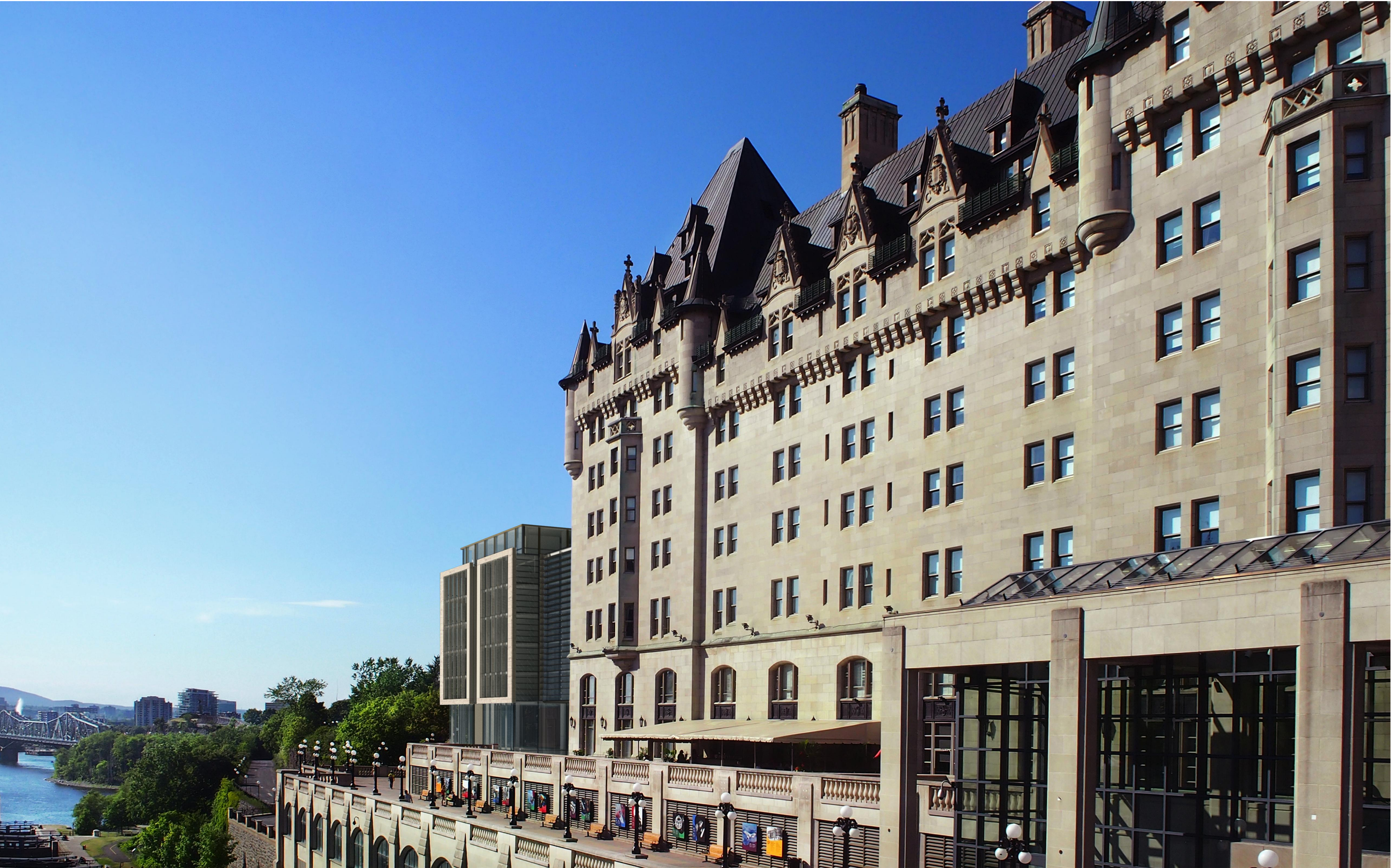
DAY VIEW 'C' FROM WELLINGTON STREET