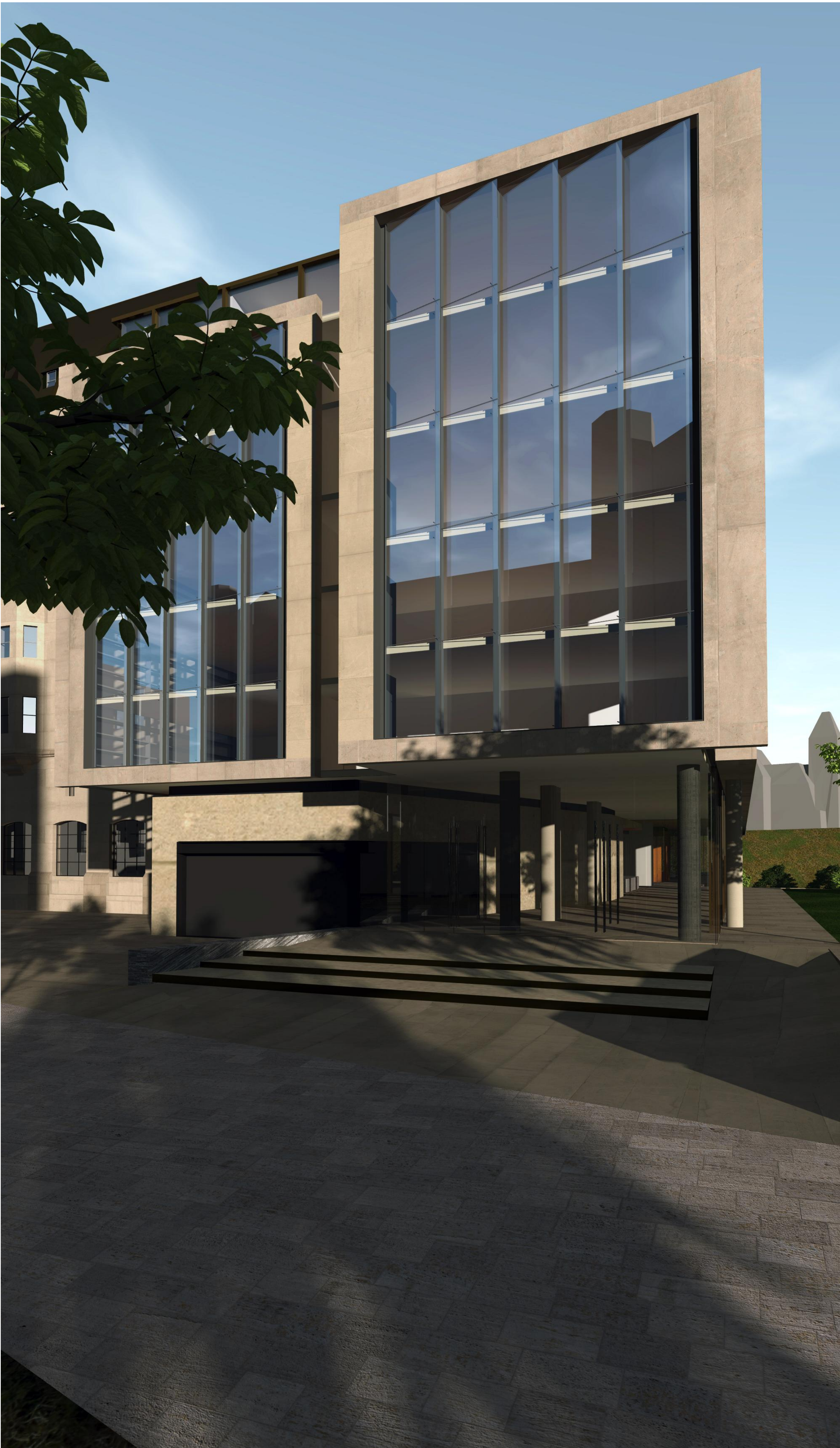
EAST ENRTY VIEW NOT TO SCALE