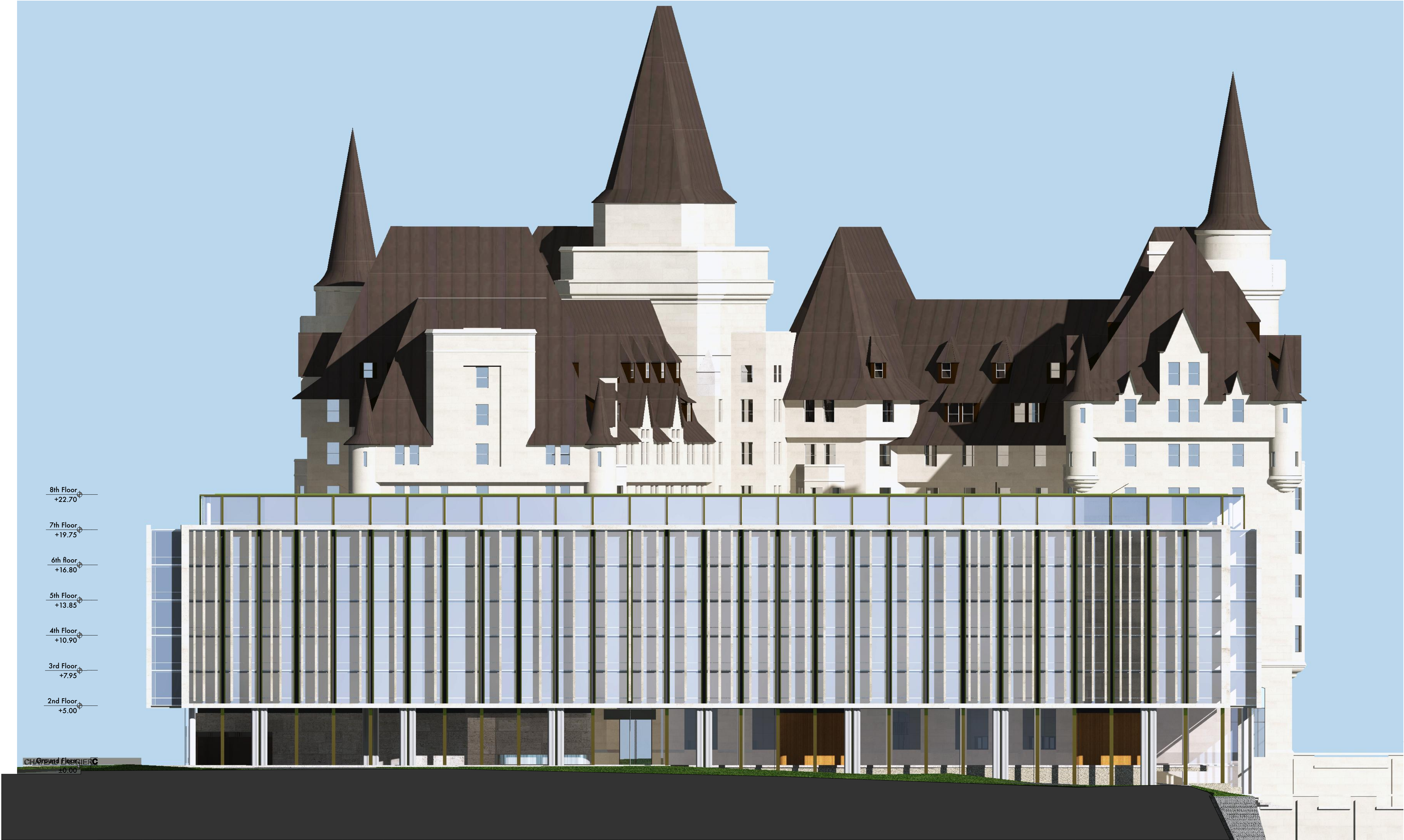
NORTH ELEVATION SCALE: 1:200