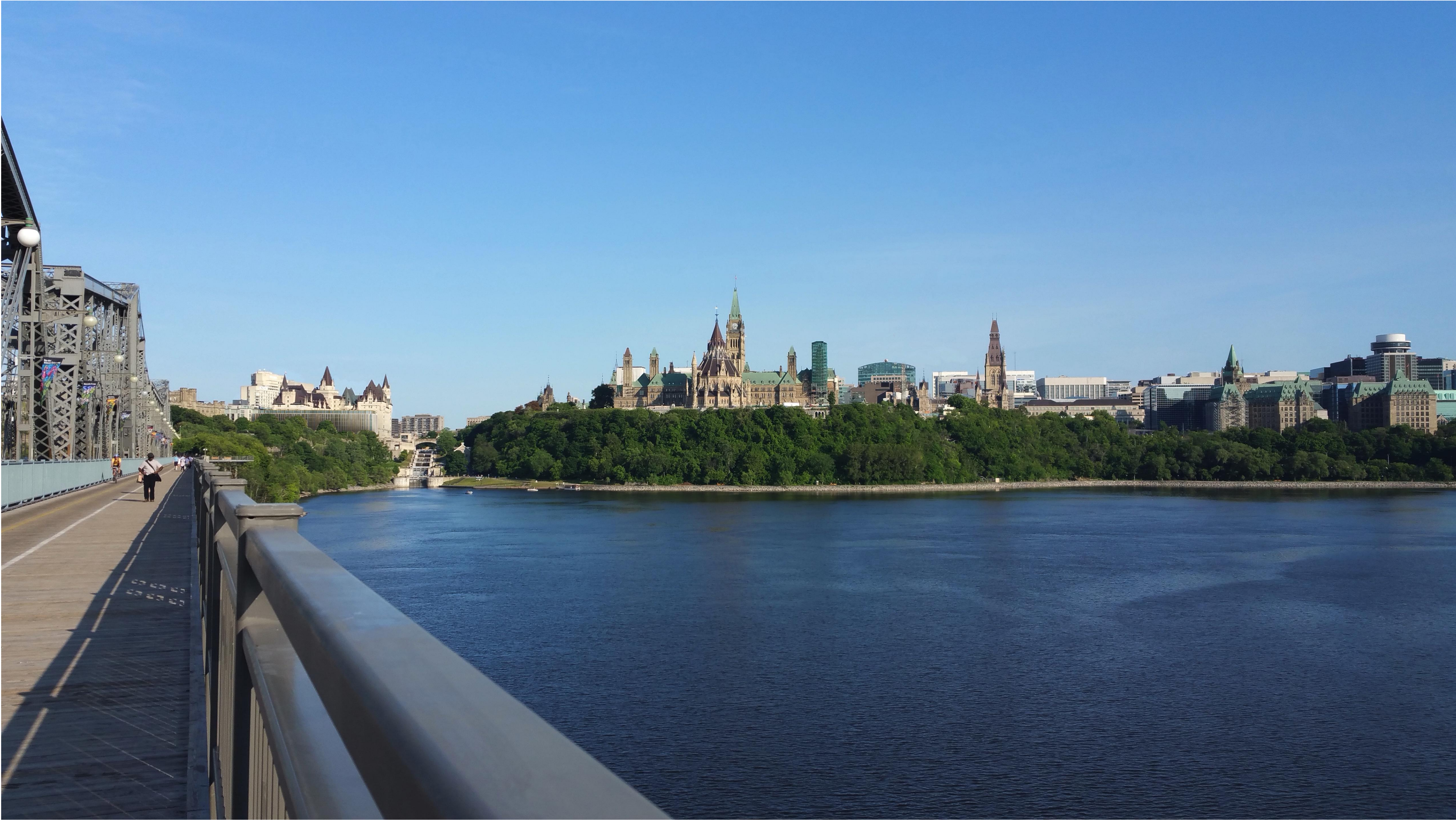
DAY VIEW '6' FROM ALEXANDRA BRIDGE