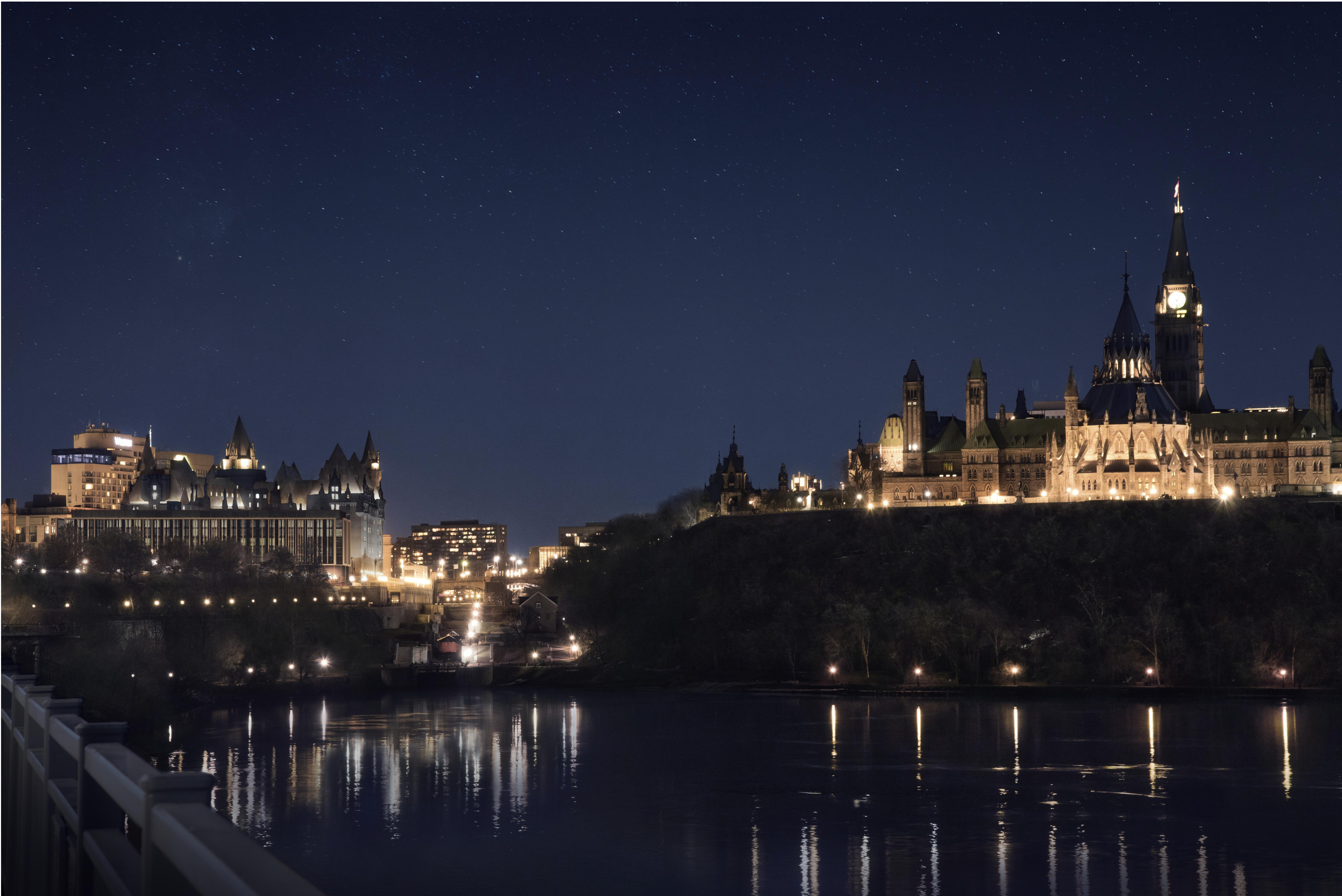
NIGHT VIEW '6' FROM ALEXANDRA BRIDGE