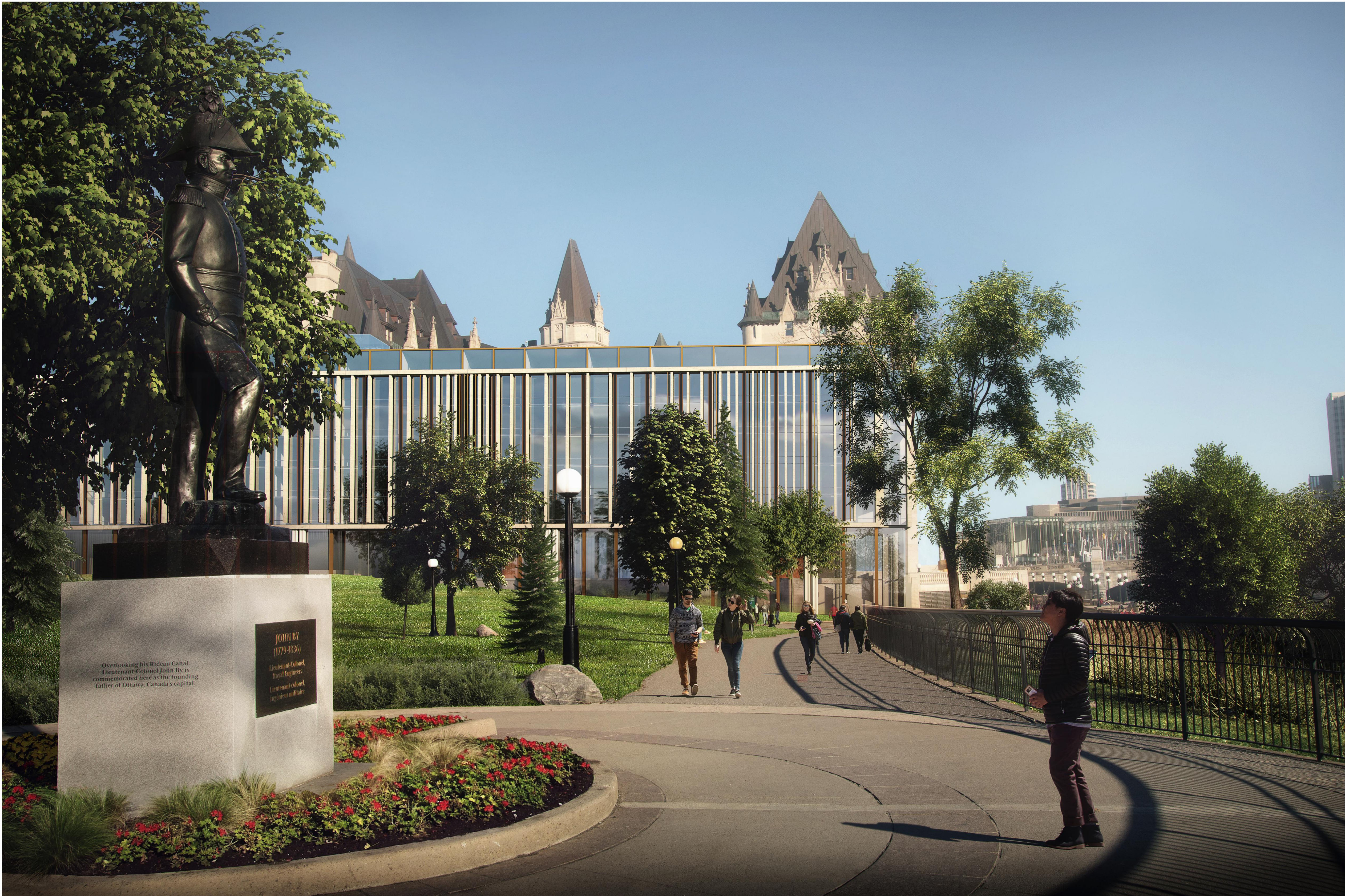
DAY VIEW FROM THE STATUE OF JOHN BY IN MAJOR'S HILL PARK