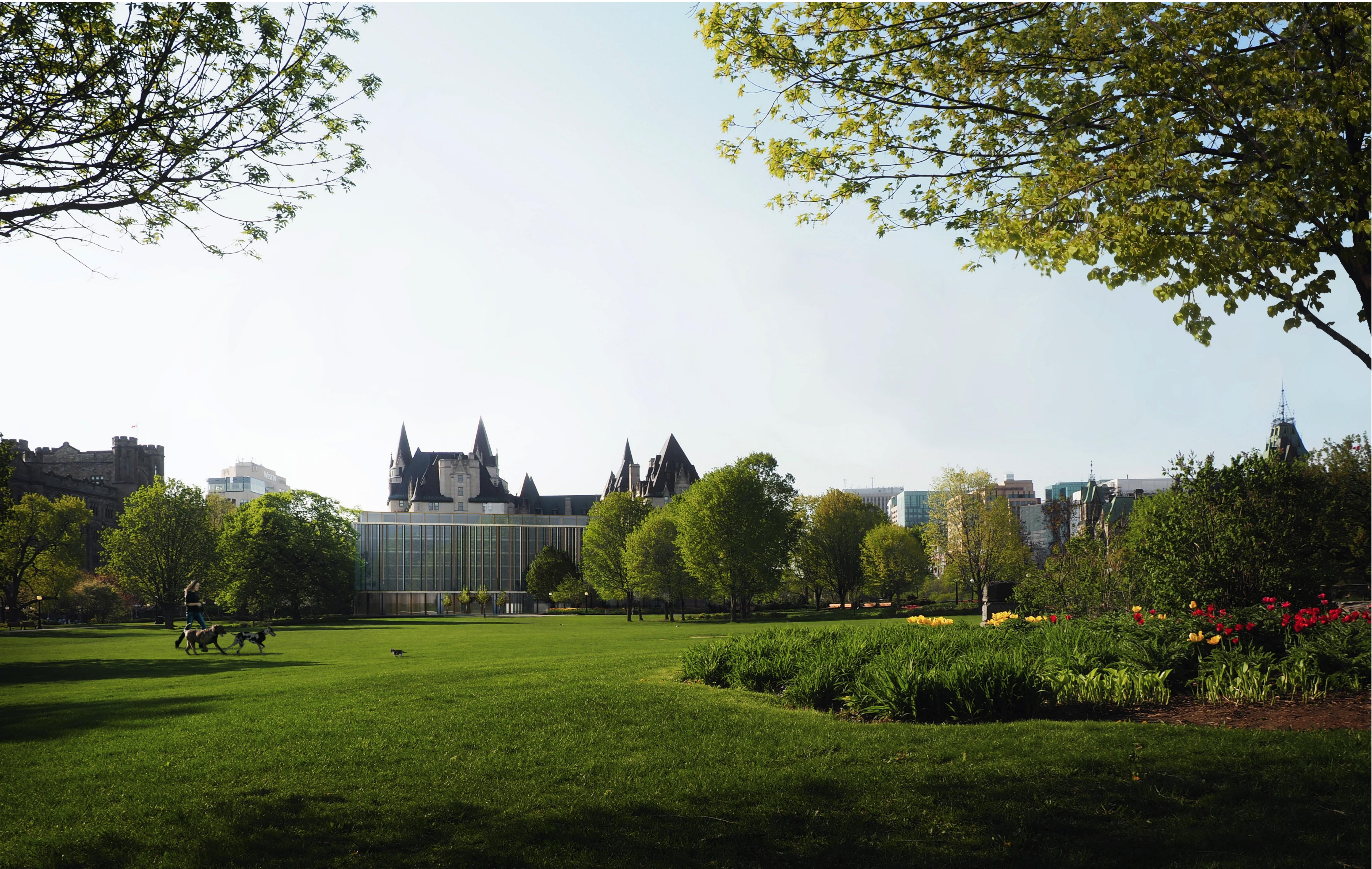
DAY VIEW 'A' FROM MAJOR'S HILL PARK