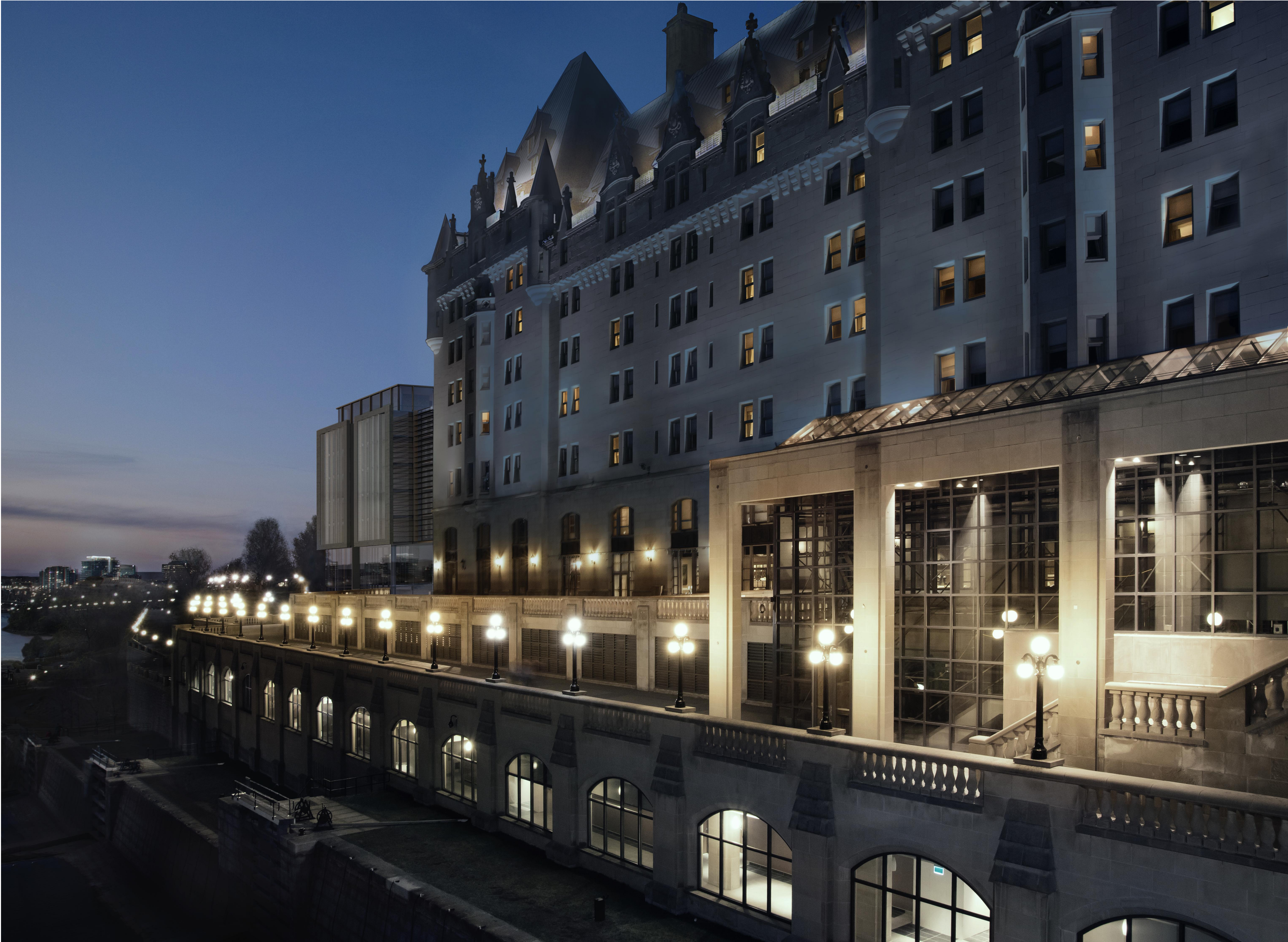
NIGHT VIEW 'C' FROM WELLINGTON STREET