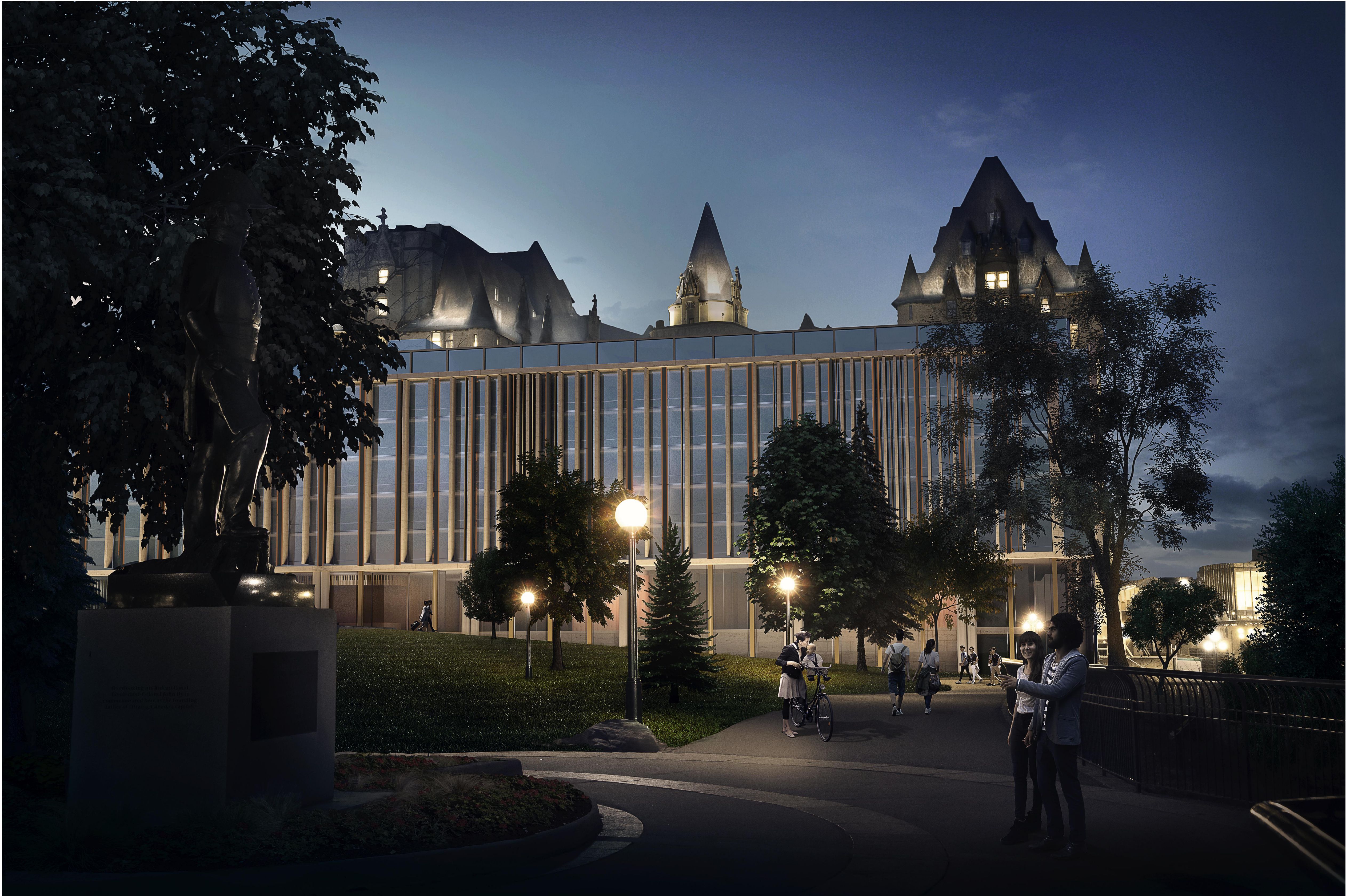
NIGHT VIEW FROM THE STATUE OF JOHN BY IN MAJOR'S HILL PARK