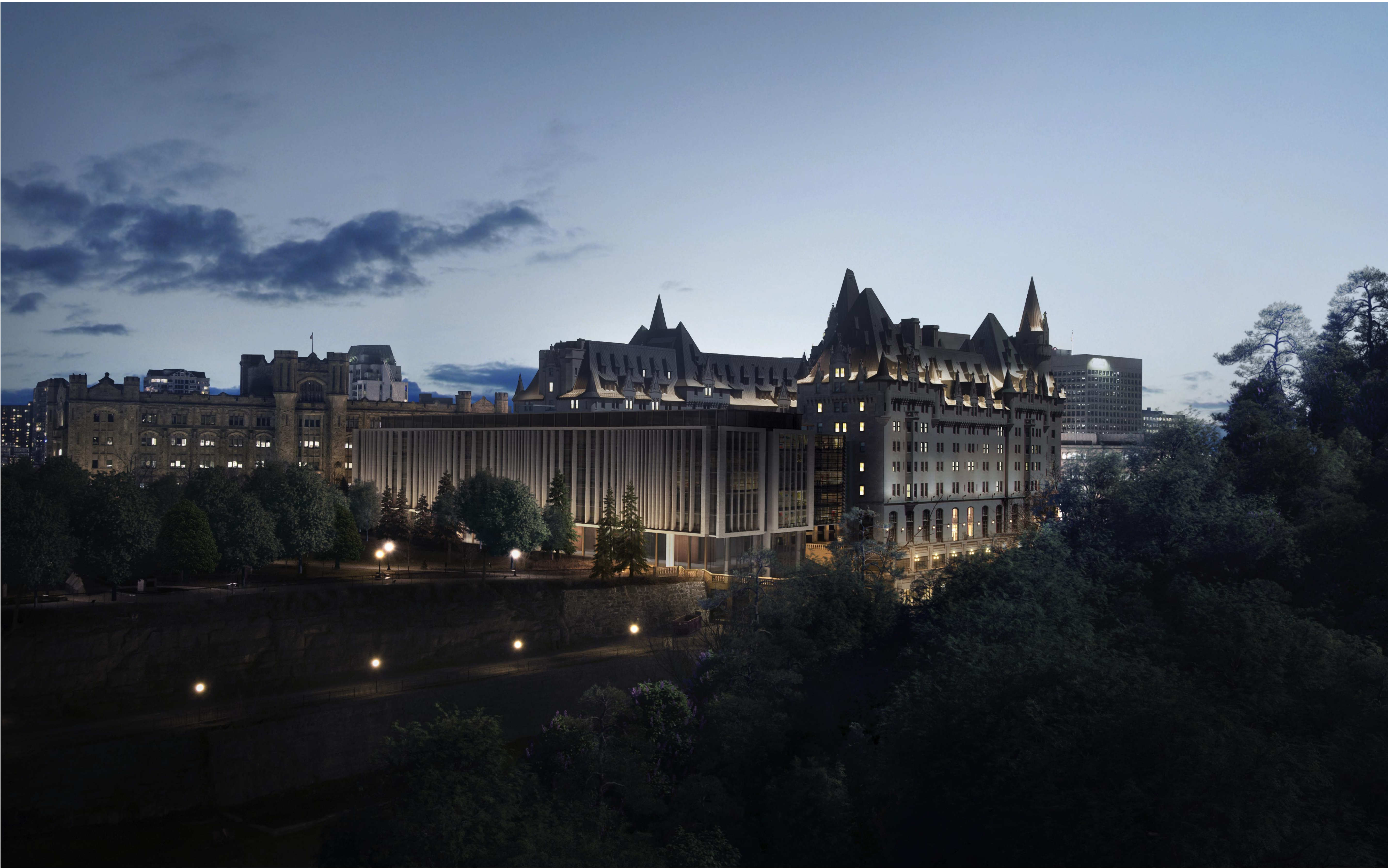
NIGHT VIEW 'D' FROM PARLIAMENT HILL