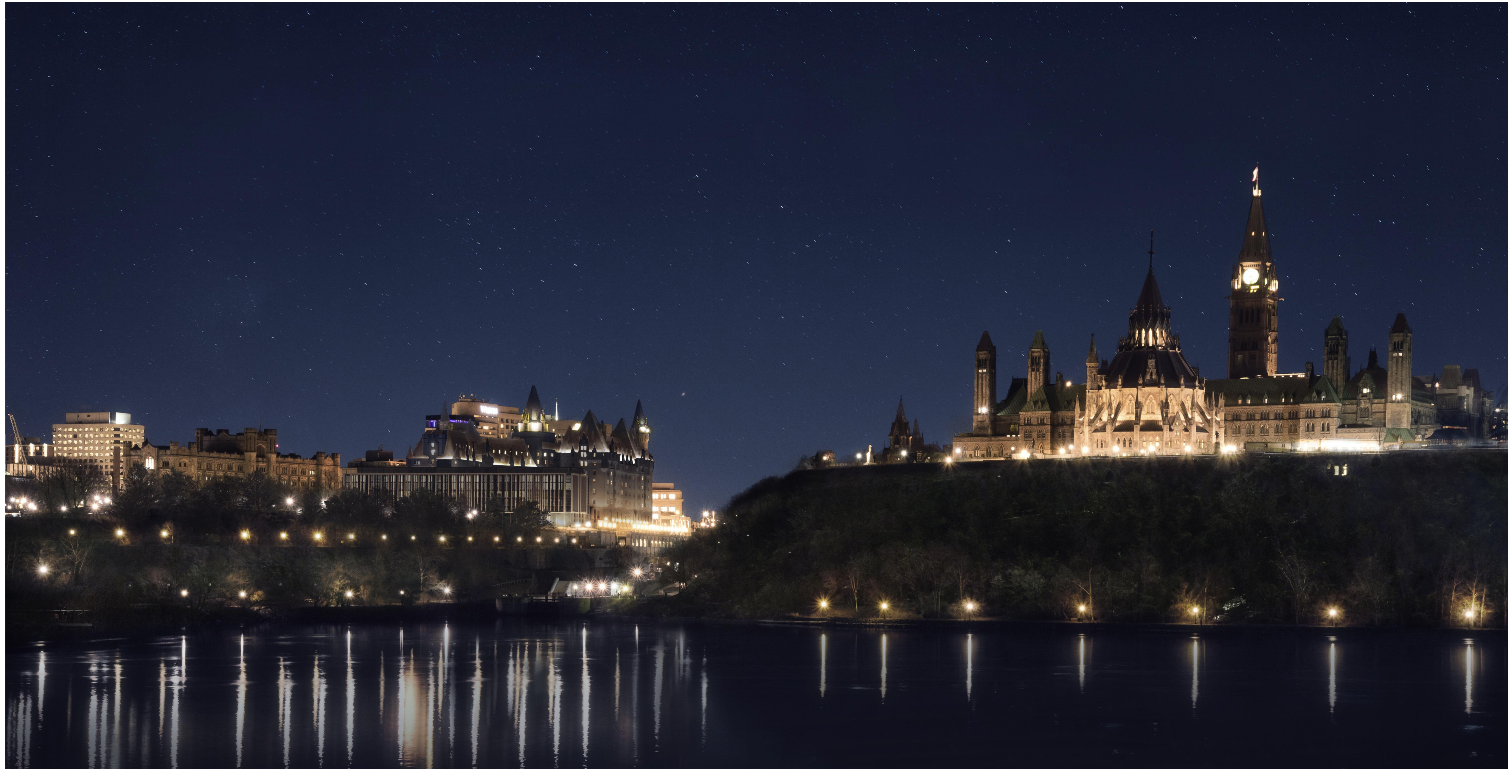
NIGHT VIEW FROM OTTAWA RIVER