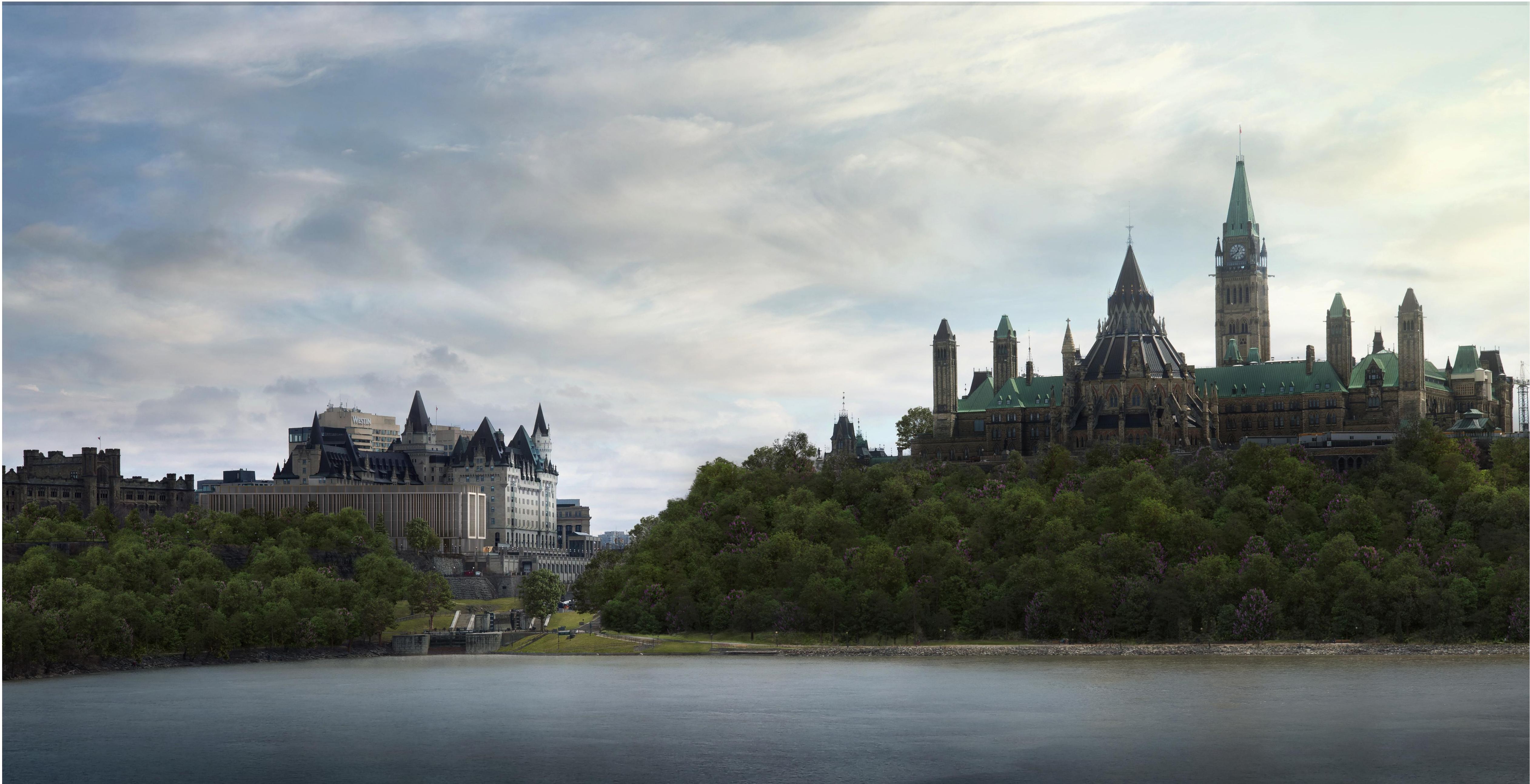
DAY VIEW FROM OTTAWA RIVER