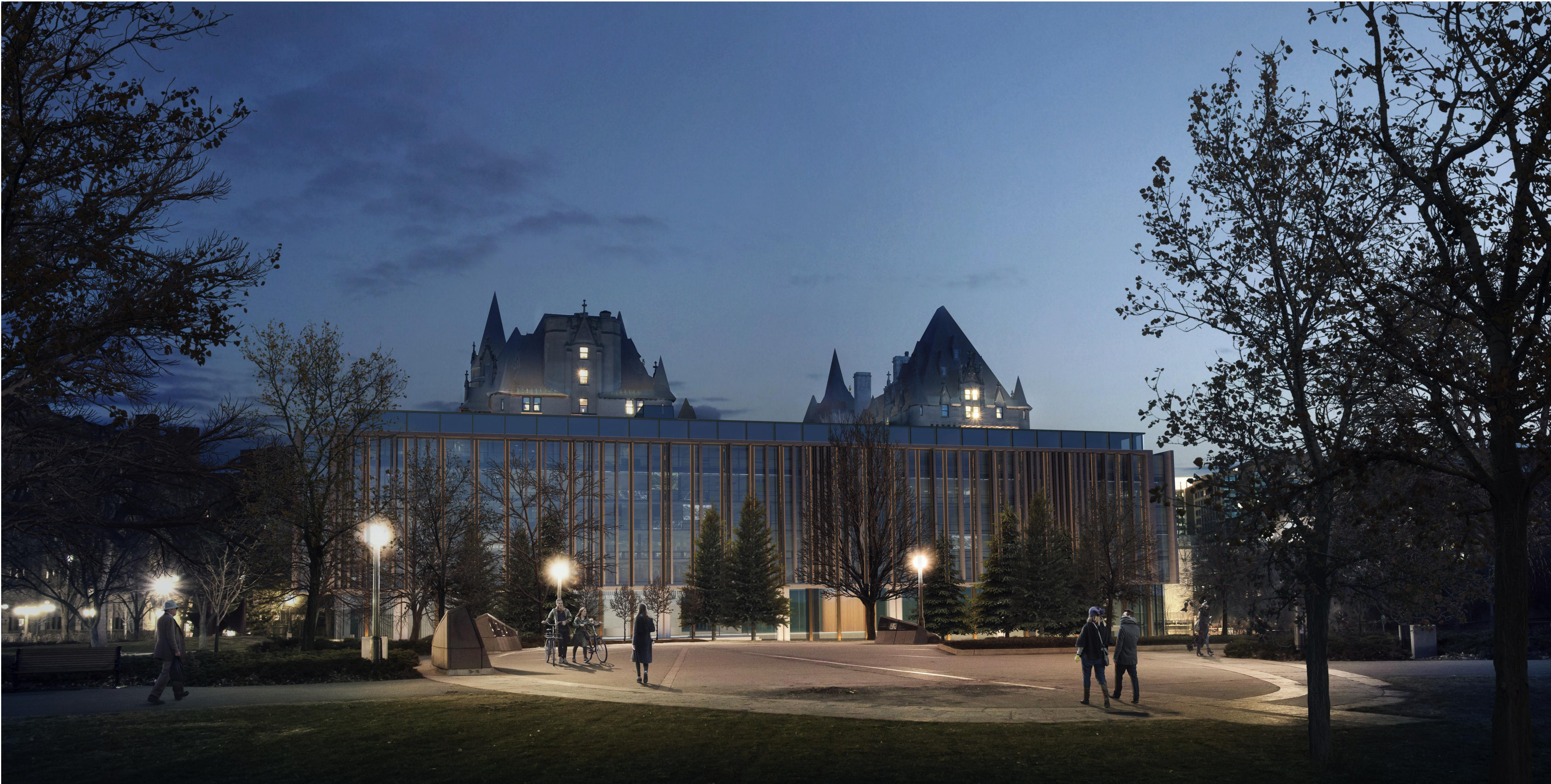
NIGHT VIEW 'A' FROM MAJOR'S HILL PARK