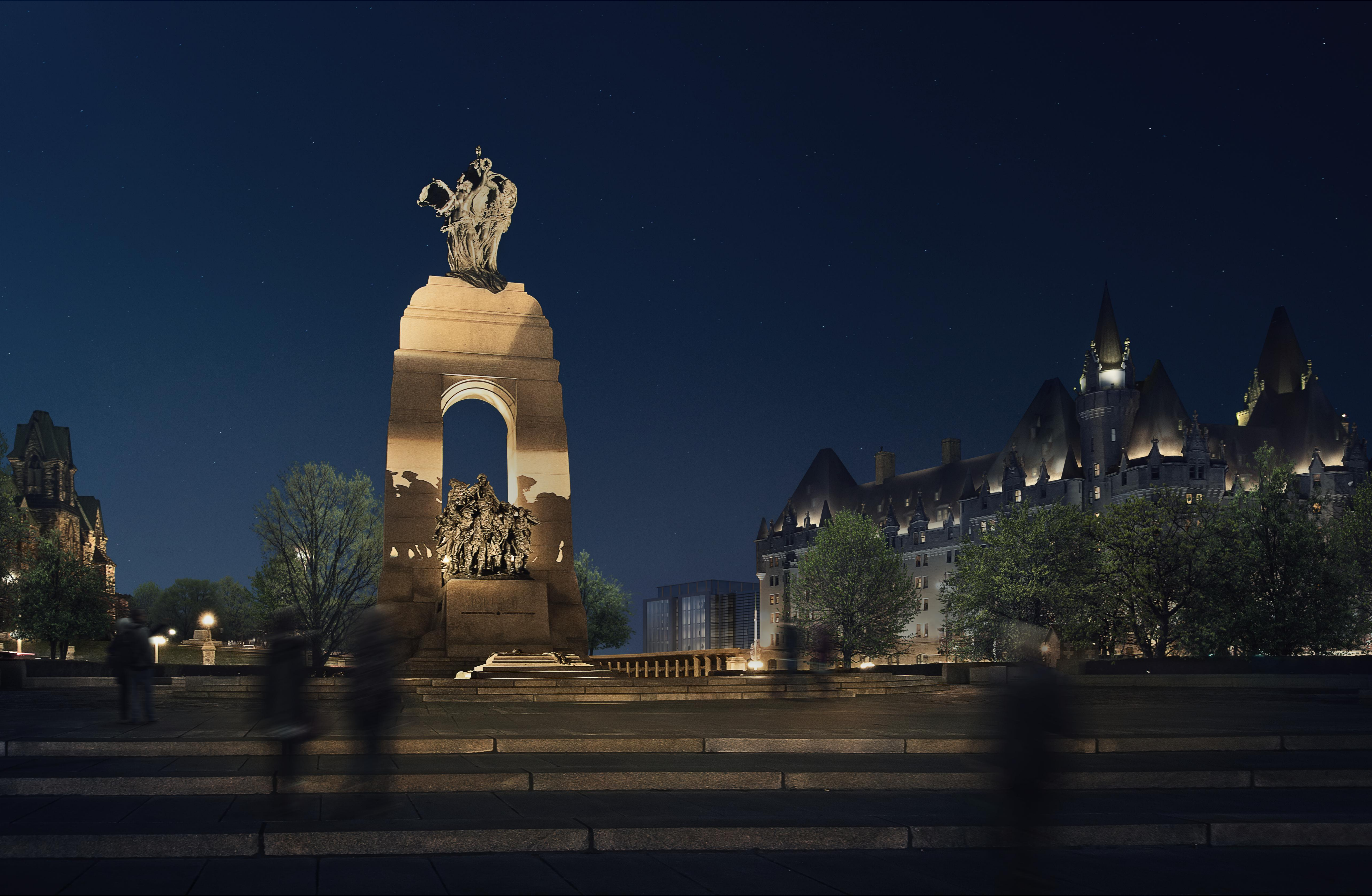
NIGHT VIEW 'B' FROM THE NATIONAL WAR MEMORIAL