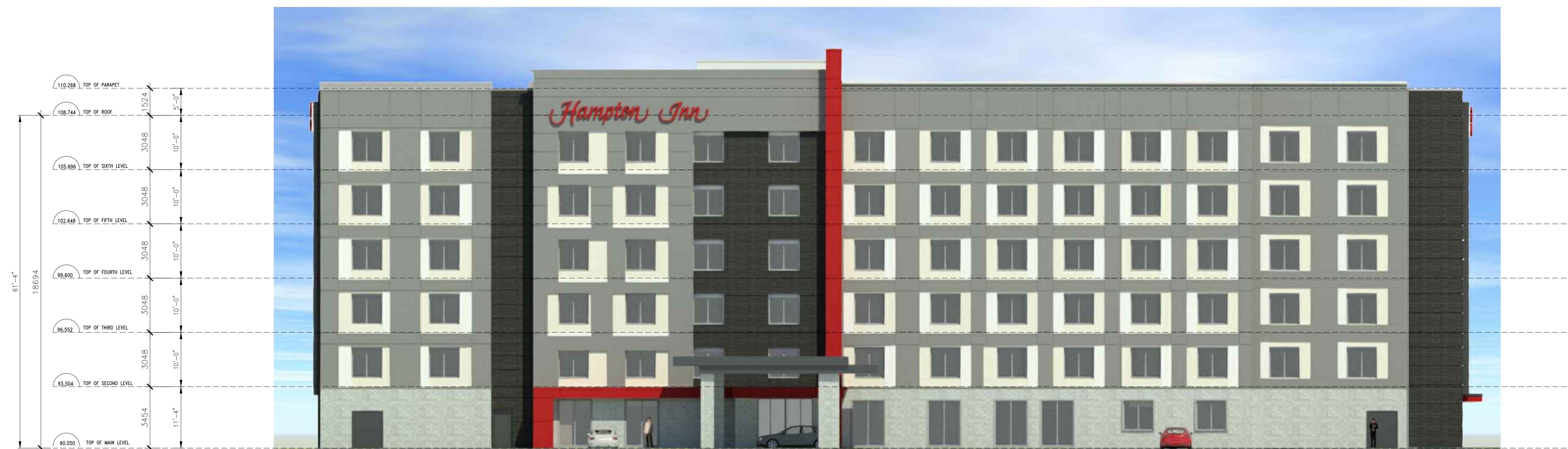
2 ELEVATION NORTH AE02 1:100