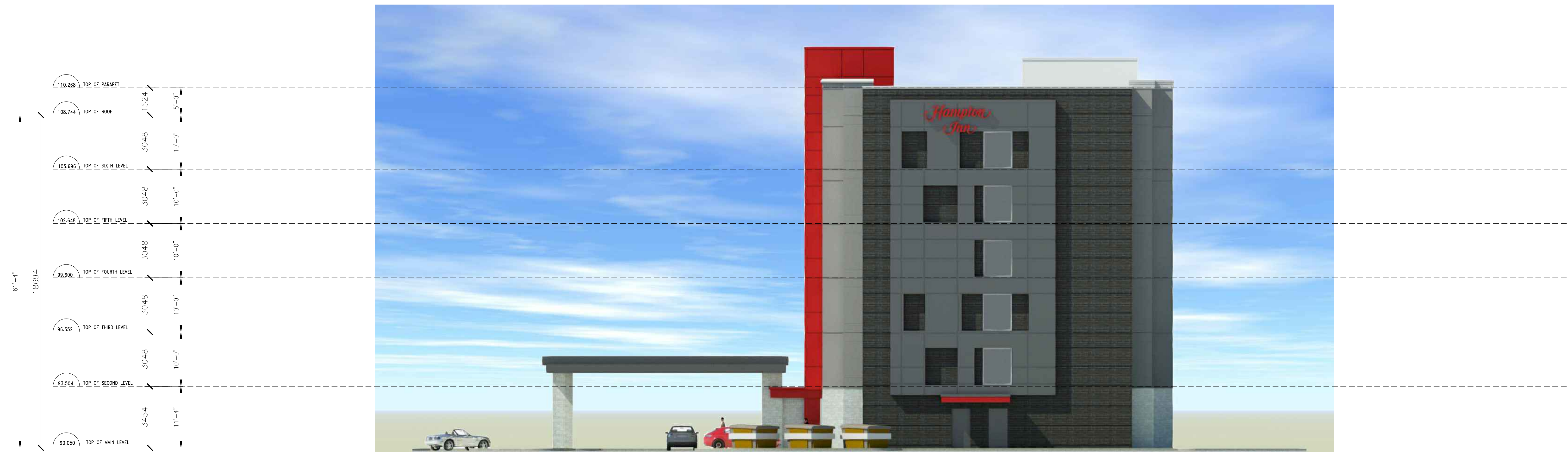
1 ELEVATION WEST AE02 1:100