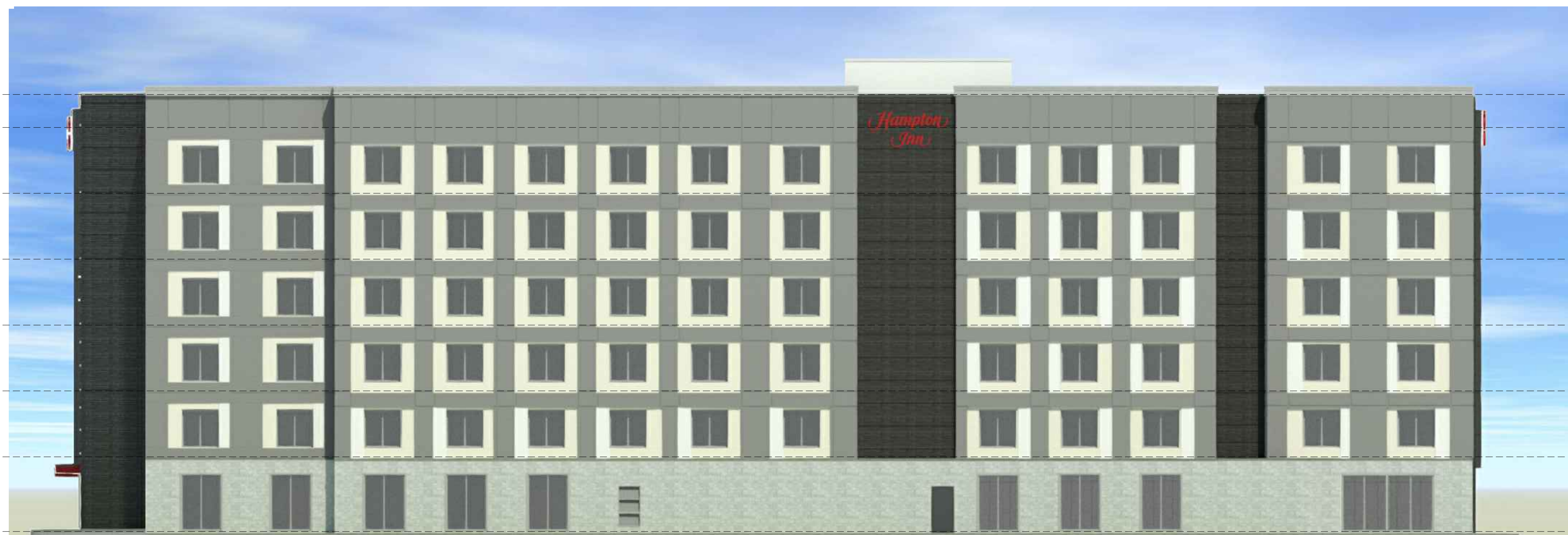
3 ELEVATION SOUTH AE01 1:100