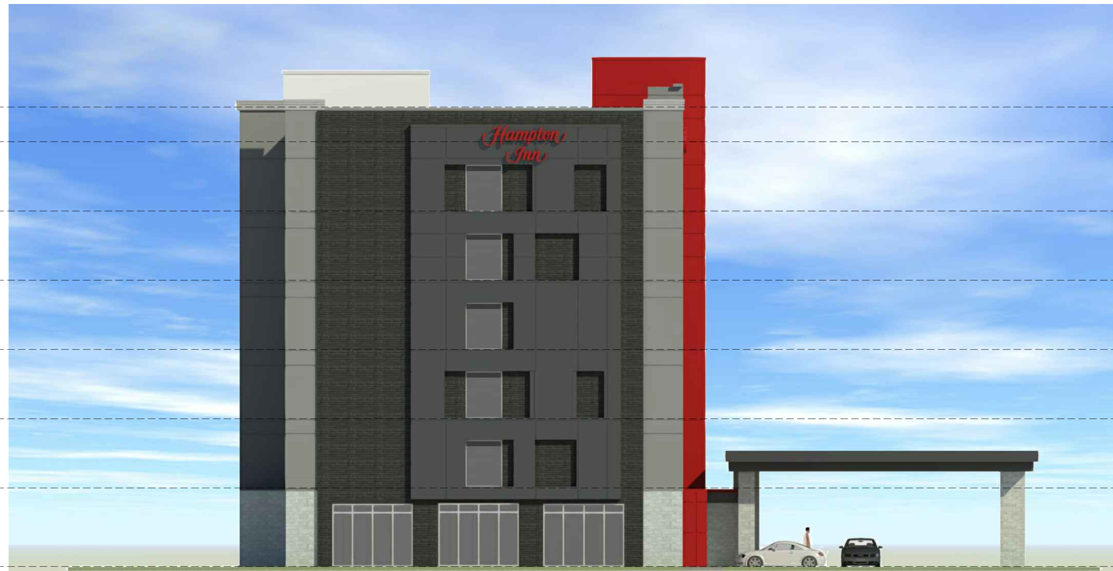
2 ELEVATION EAST AE01 1:100