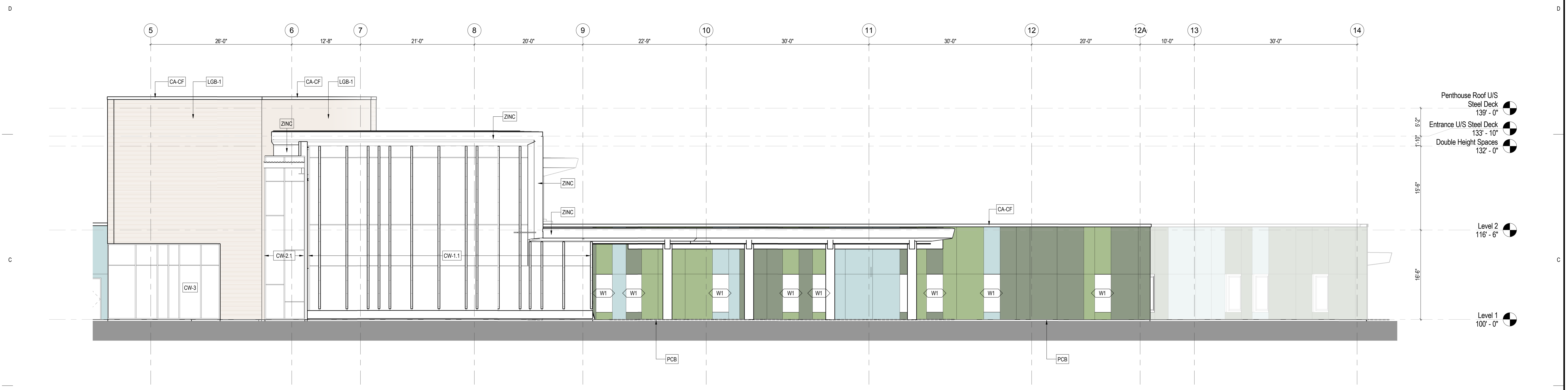
3 West Elevation - Enlarged 2 1/8" = 1'-0"