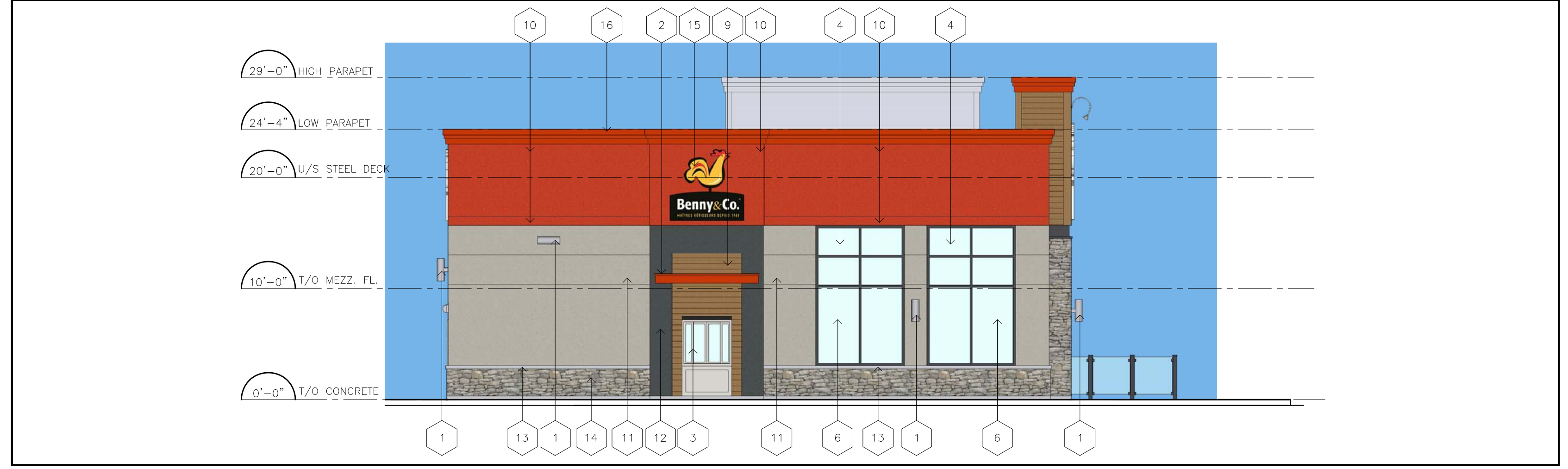
3 WEST ELEVATION N.T.S.