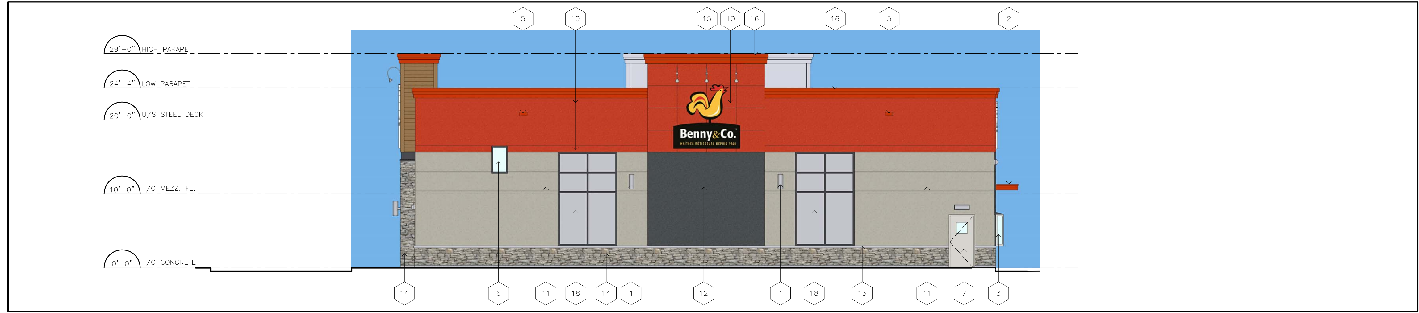
2 NORTH ELEVATION N.T.S.