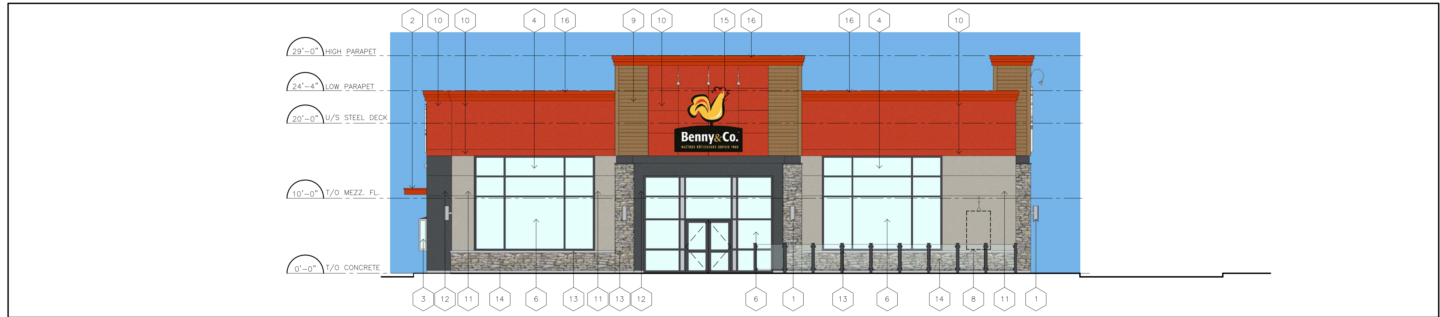
1 SOUTH ELEVATION N.T.S.