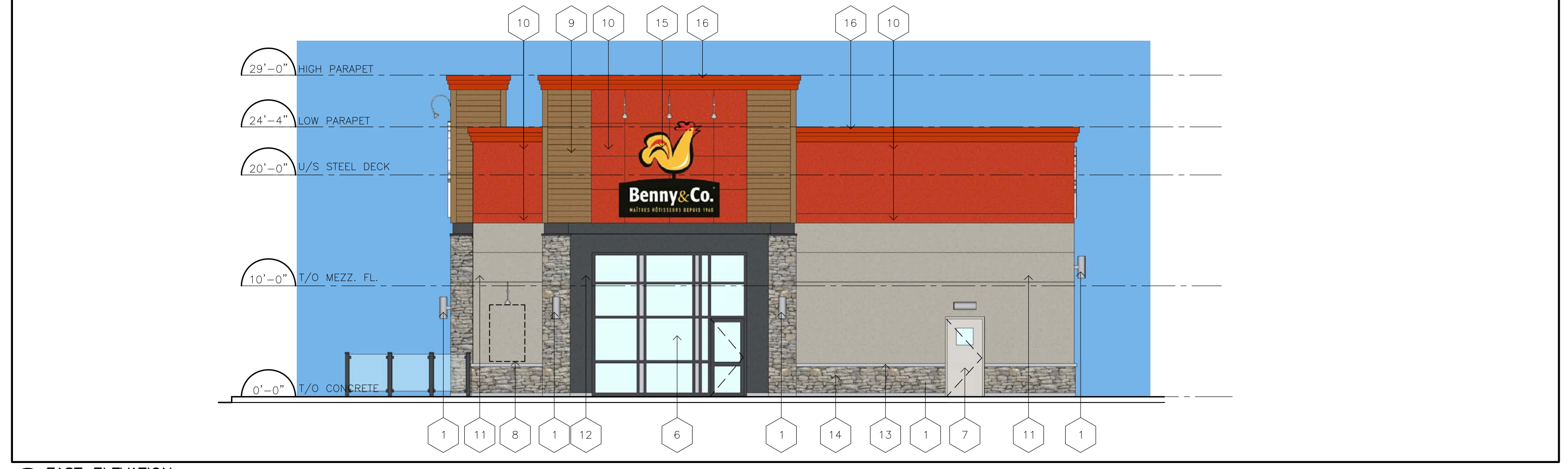
4 EAST ELEVATION N.T.S.