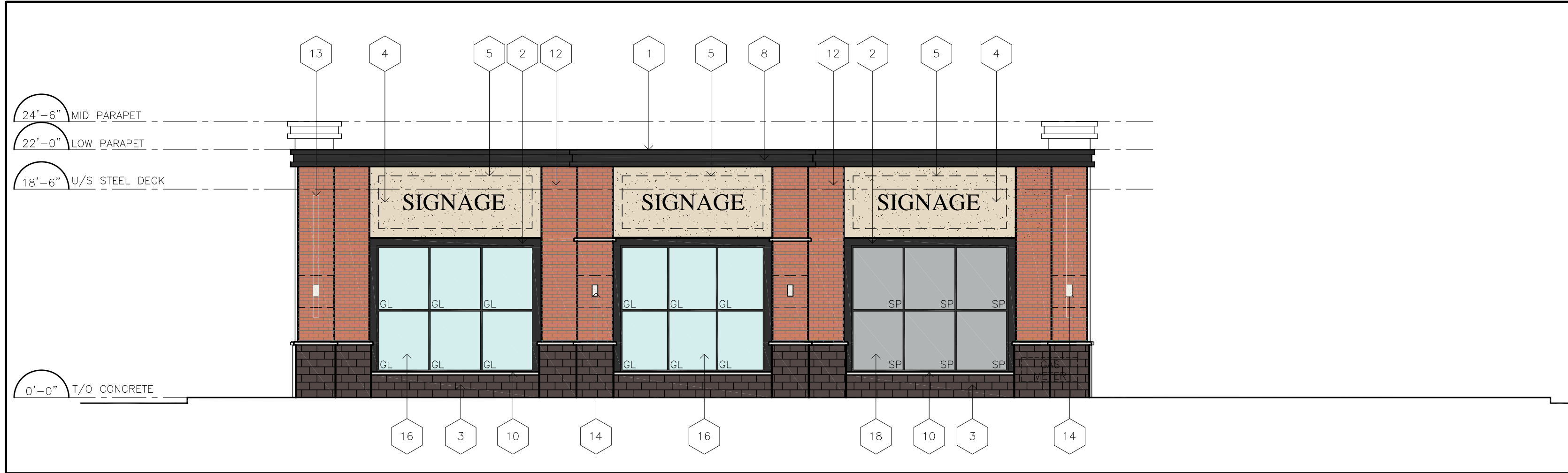
3 EAST ELEVATION A2