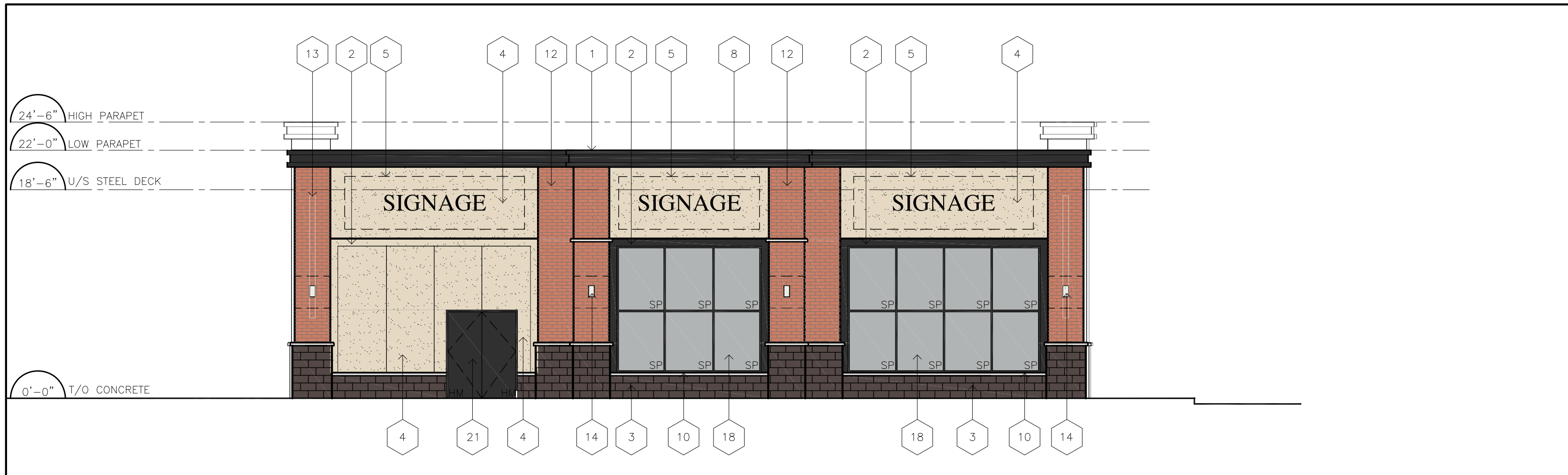
4 WEST ELEVATION A2