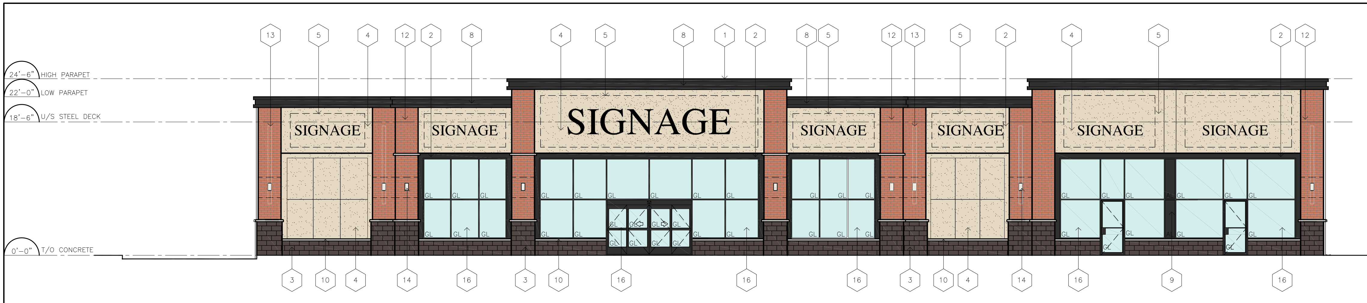
1 SOUTH ELEVATION A2