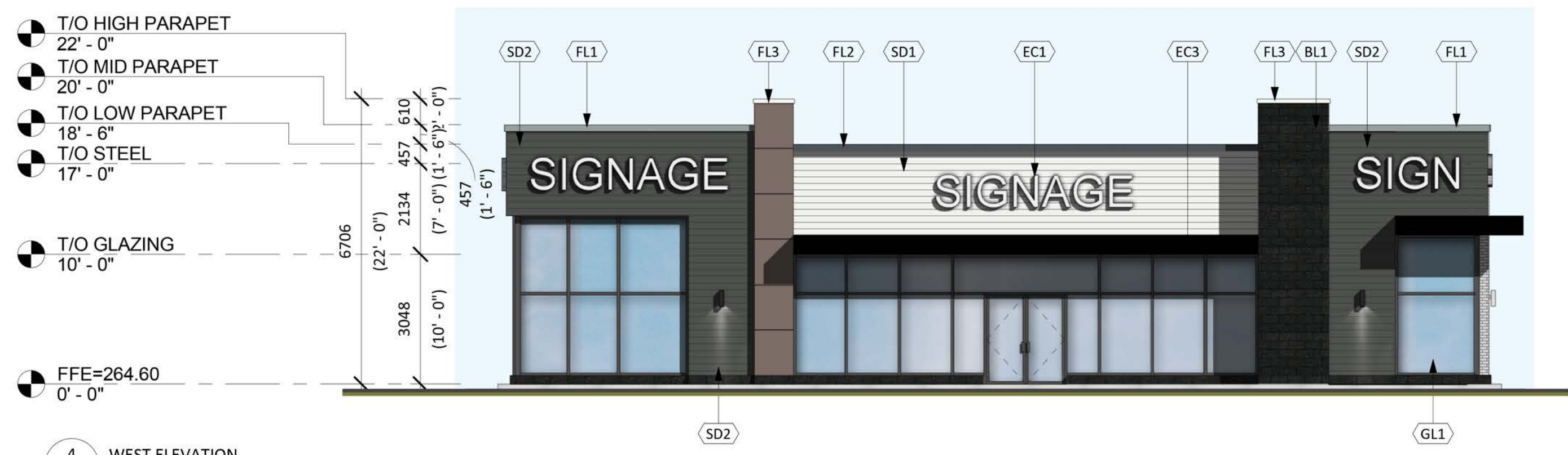
4 WEST ELEVATION A2-6.1 1:100