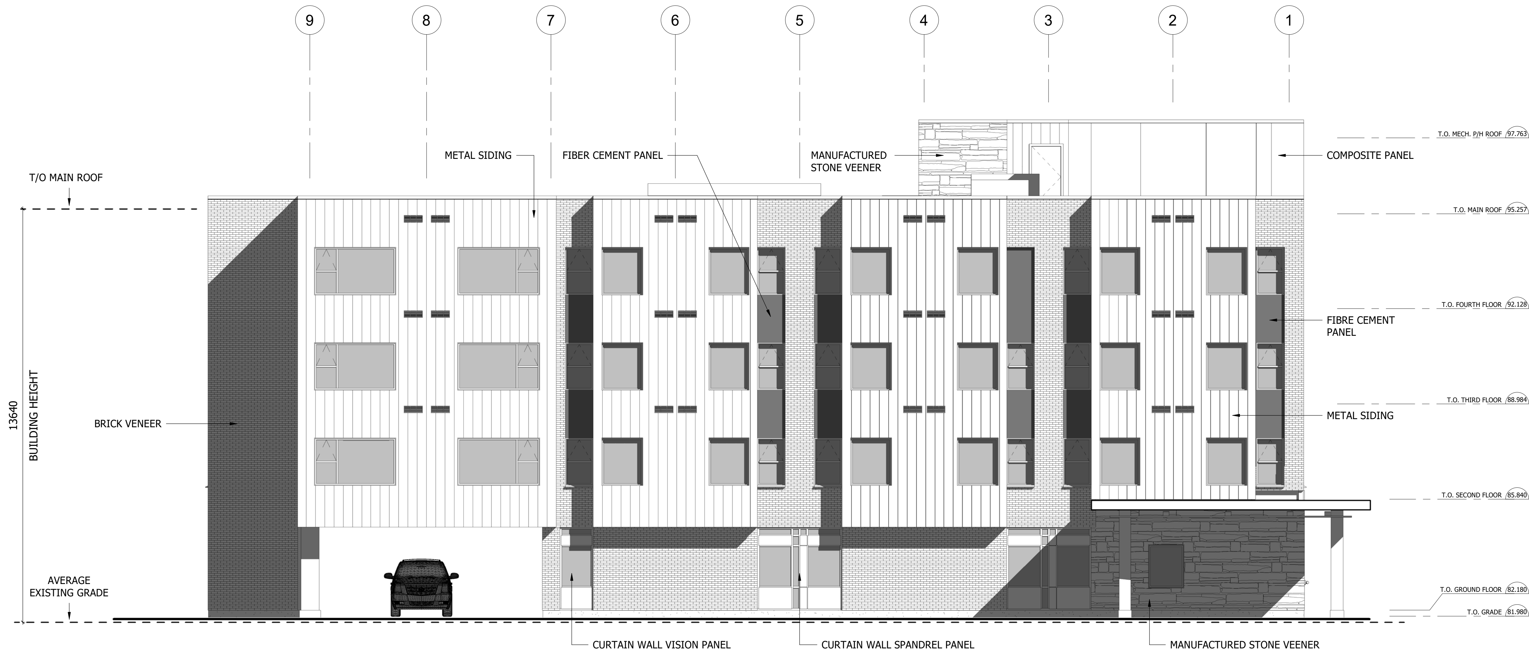
1 North Elevation A201.1 1 : 75