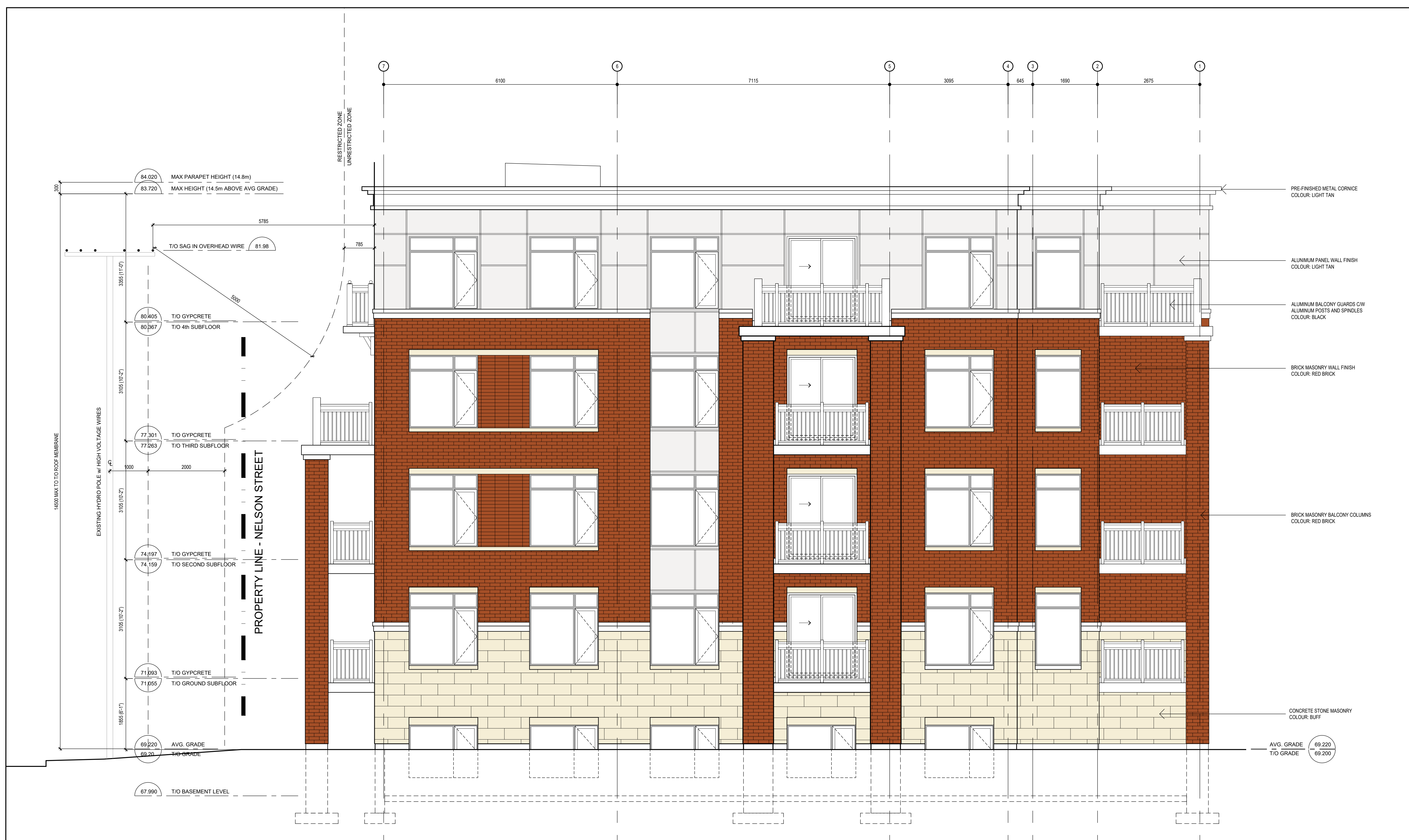
1 LANEWAY ELEVATION SCALE: 1:50

04 OCT 27 2017 ISSUED FOR SITE PLAN APPROVAL 03 AUG 25 2017 ISSUED TO STRUCTURAL 02 JULY 21 2017 ISSUED TO NOVATECH 01 FEB 14 2017 ISSUED FOR REVIEW