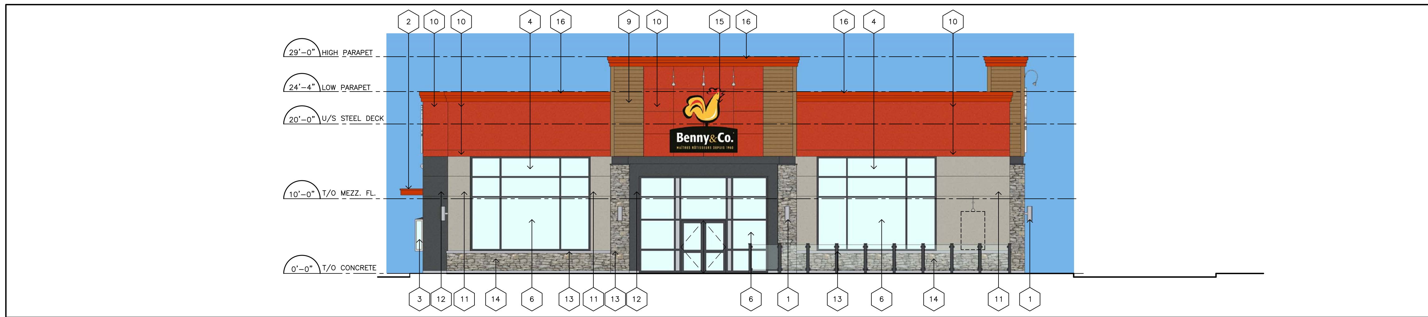
1 SOUTH ELEVATION A3