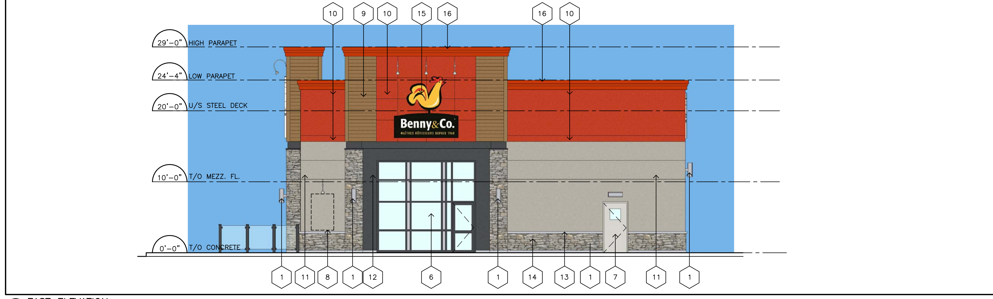
4 EAST ELEVATION A3