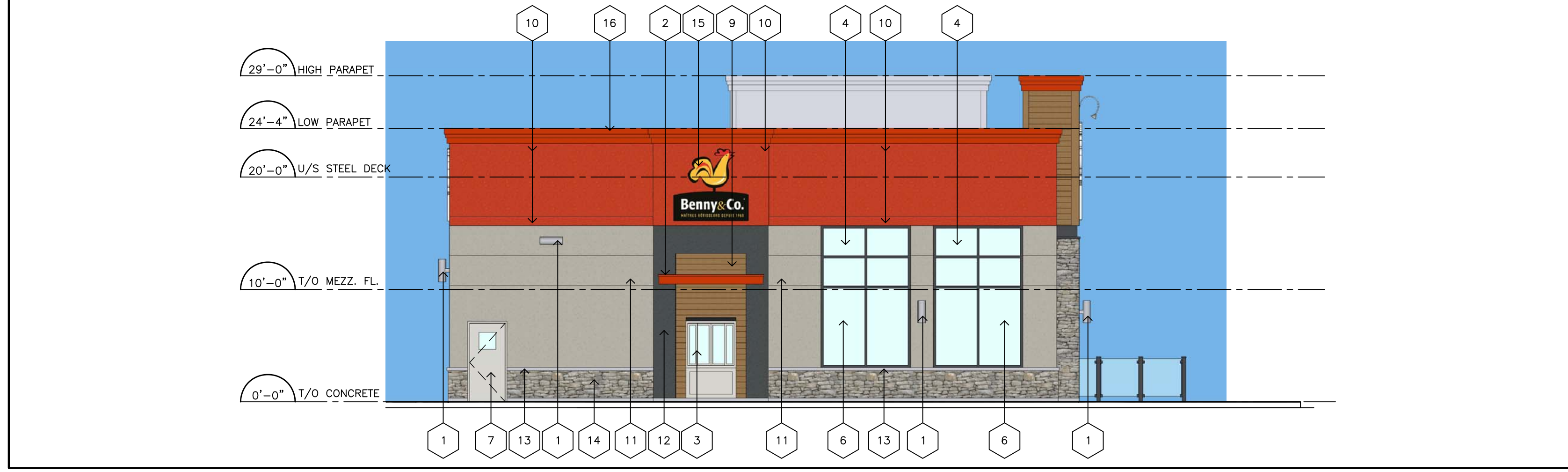
3 WEST ELEVATION A3