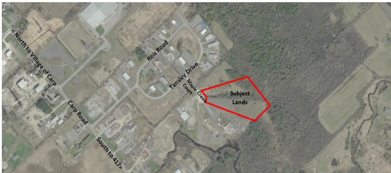
Figure 1: Location of Subject Lands

The subject lands are known municipally as 210 and 220 Maple Creek Court and are described legally as Parts 4 and 5 on Plan 4R-17169, Part of the North Half of Lot 7, Concession 2, Geographic Township of Huntley (former Township of West Carleton), and now in the City of Ottawa. The subject lands have an area of 34,701.1 square metres with frontage of 60.78 metres on the east side of the Maple Creek Court cul-de-sac, south of Tansley Drive, in the existing Reis Industrial Park, in the Carp Road Corridor, as illustrated on Figure 1: Location of Subject Lands .