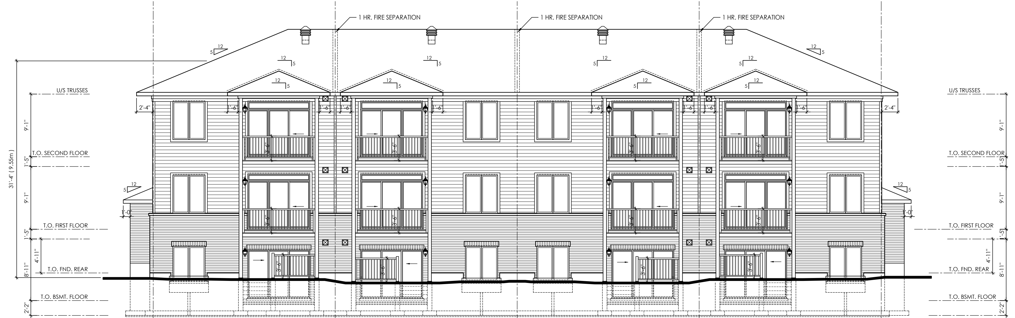
BLOCK 1 REAR ELEVATION END UNIT REV. - OPT. 2 UNIT 'A' - 141 UNIT 'B' - 142 UNIT 'C' - 143 MID UNIT - OPT. 2 UNIT 'A' - 131 UNIT 'B' - 132 UNIT 'C' - 133 MID UNIT REV. - OPT. 2 UNIT 'A' - 121 UNIT 'B' - 122 UNIT 'C' - 123 END UNIT - OPT. 2 UNIT 'A' - 111 UNIT 'B' - 112 UNIT 'C' - 113

APPROVED REFUSED THIS _____ DAY OF _____, 20____ DON HERWEYER, MCIP, RPP MANAGER, DEVELOPMENT REVIEW - SOUTH PLANNING, INFRASTRUCTURE AND ECONOMIC DEVELOPMENT DEPARTMENT, CITY OF OTTAWA