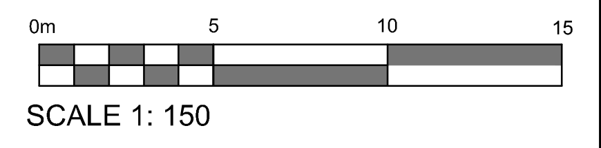
1 WEST ELEVATION A201 SCALE = 1 : 150