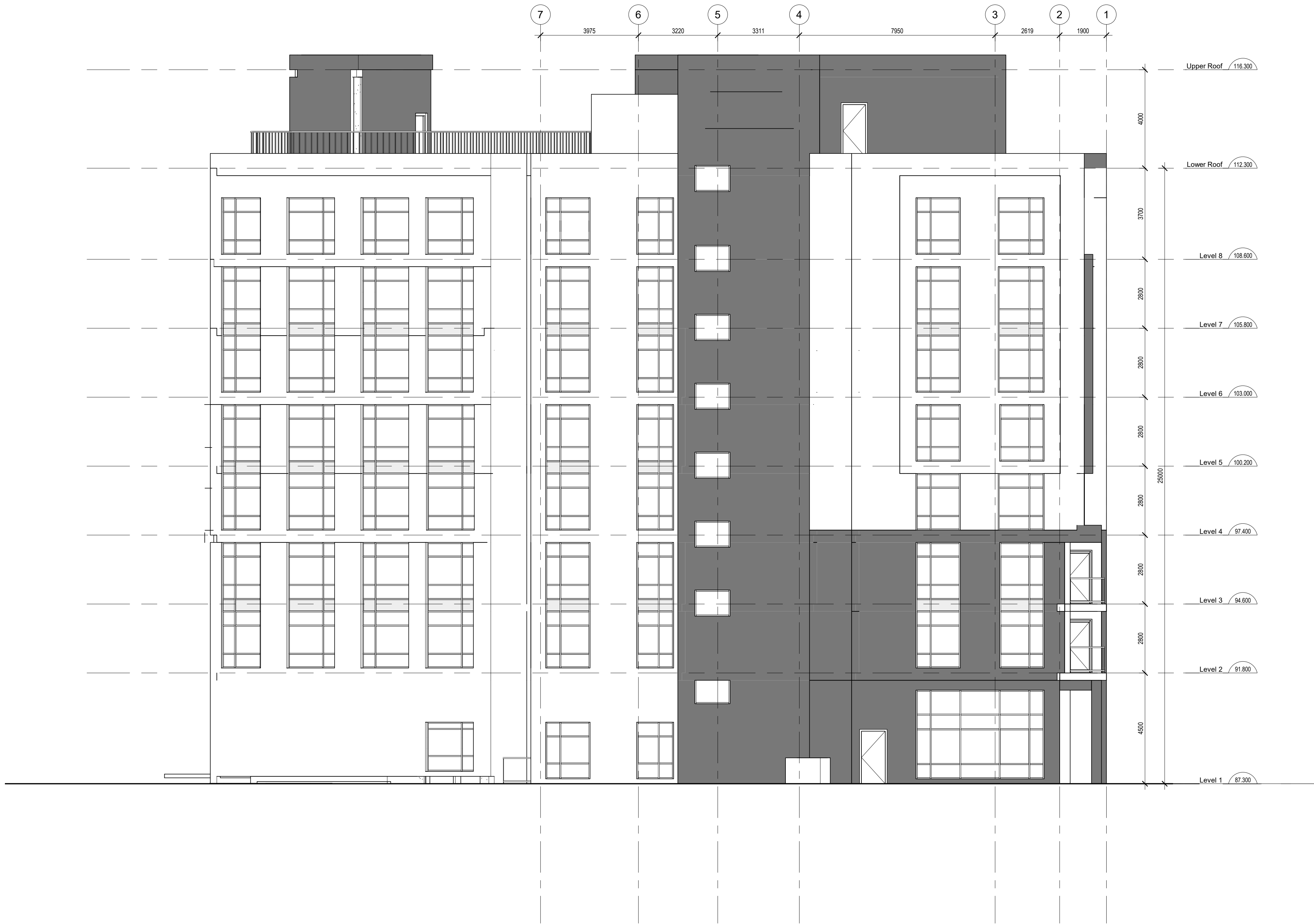
1 NORTH ELEVATION (SIDE ELEVATION) A205 SCALE 1 : 100

APPROVED By Lily Xu at 4:17 pm, Dec 10, 2019