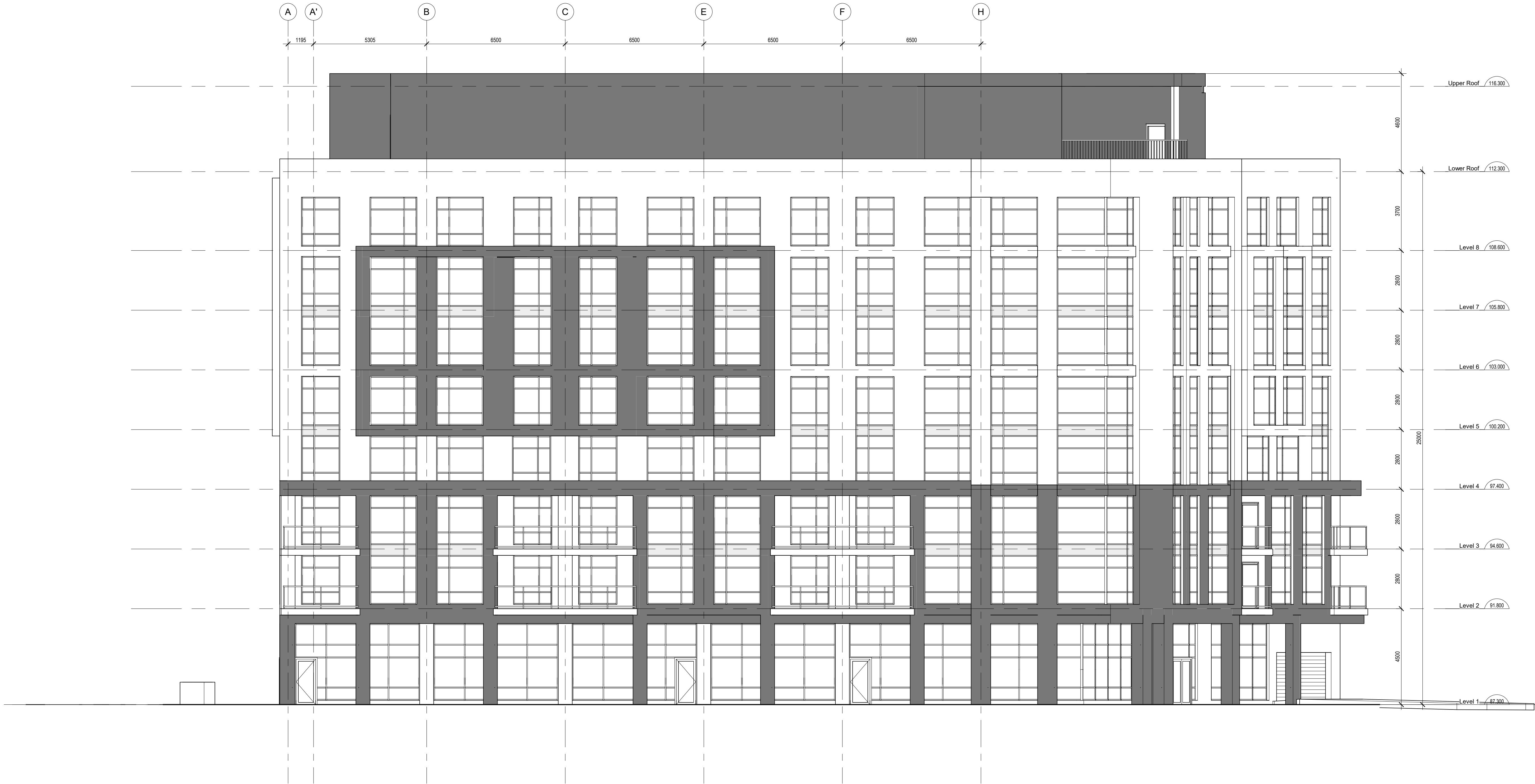
1 WEST ELEVATION (BANK ST) A200 SCALE 1 : 100