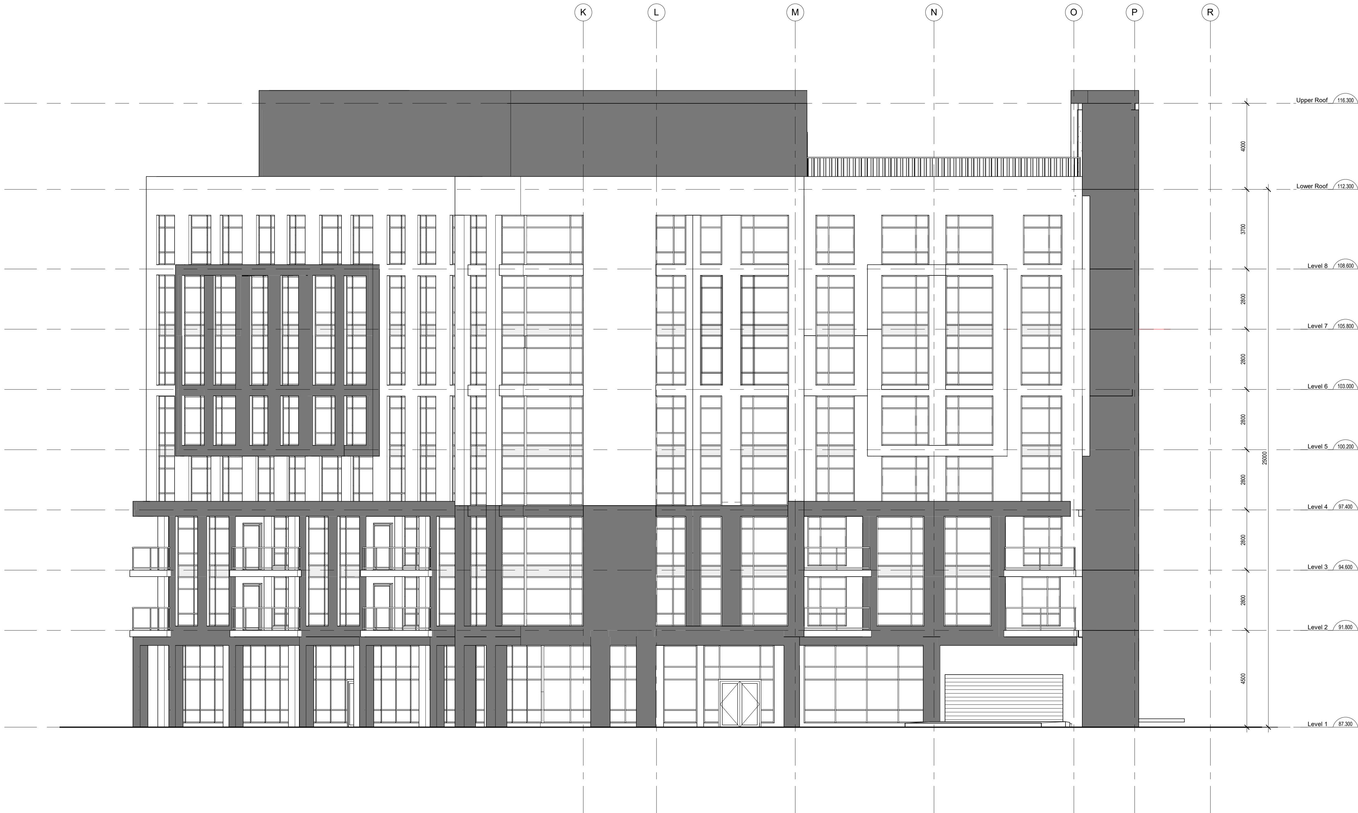
1 SOUTH ELEVATION (EVANS BLVD) A201 SCALE 1 : 100