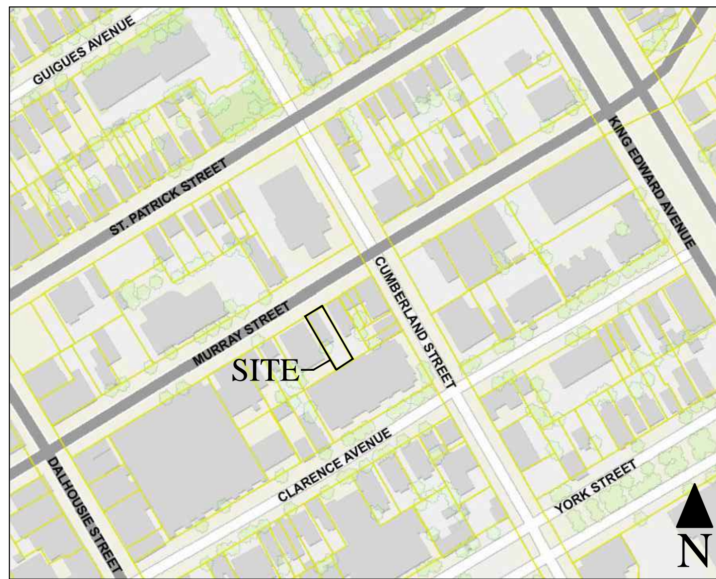
1 LOCATION MAP SCALE: N.T.S.