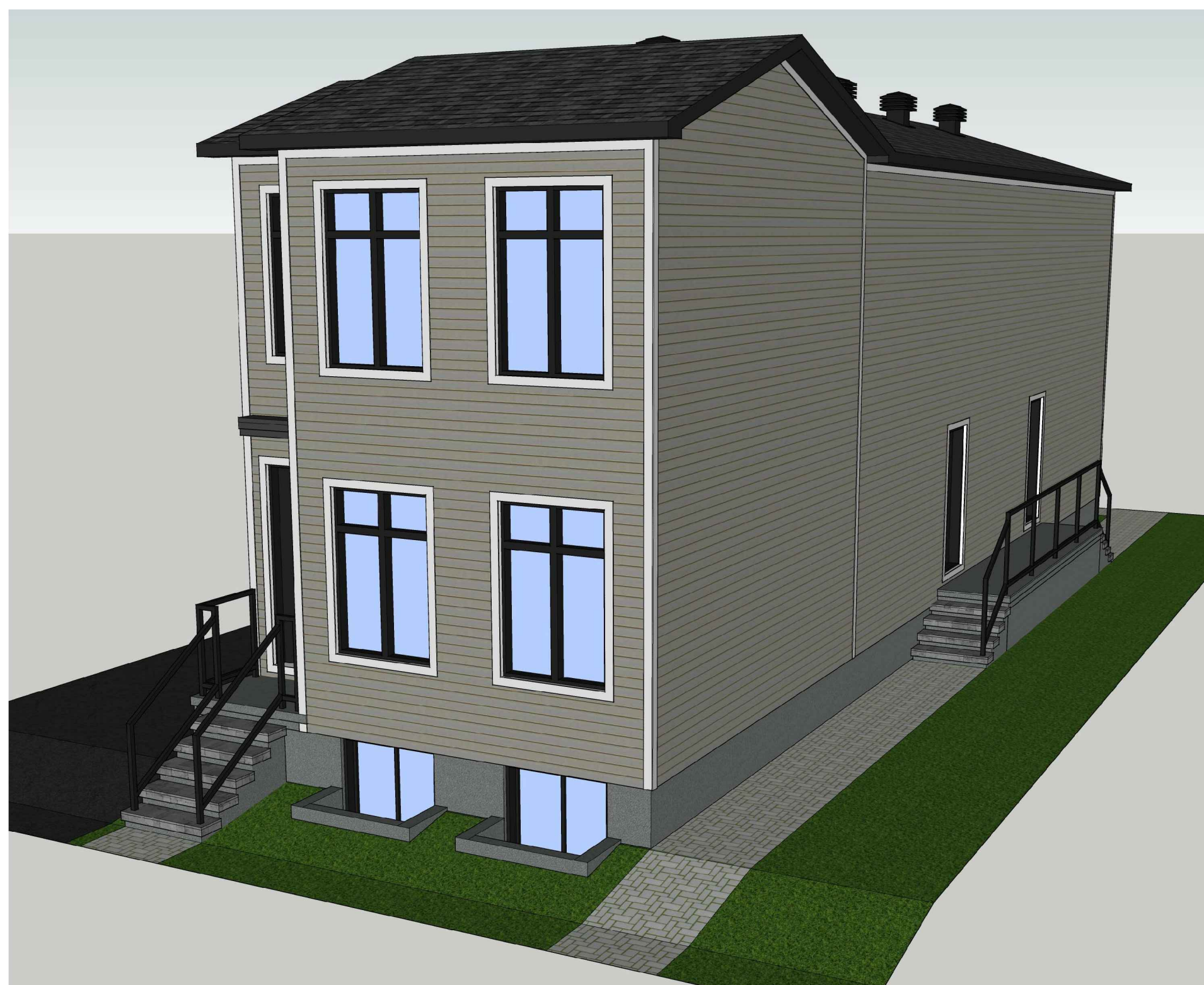
1 FRONT-LEFT SIDE PERSPECTIVE