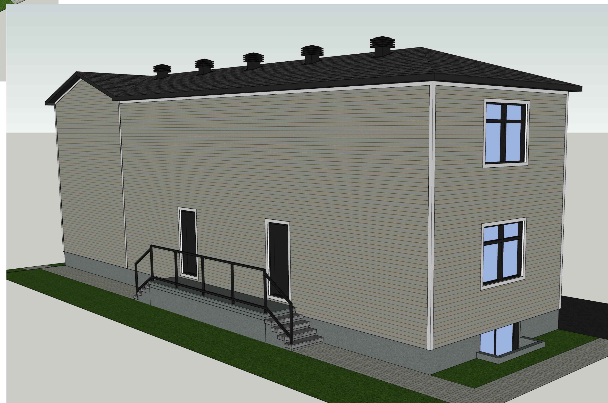
1 REAR-LEFT SIDE PERSPECTIVE