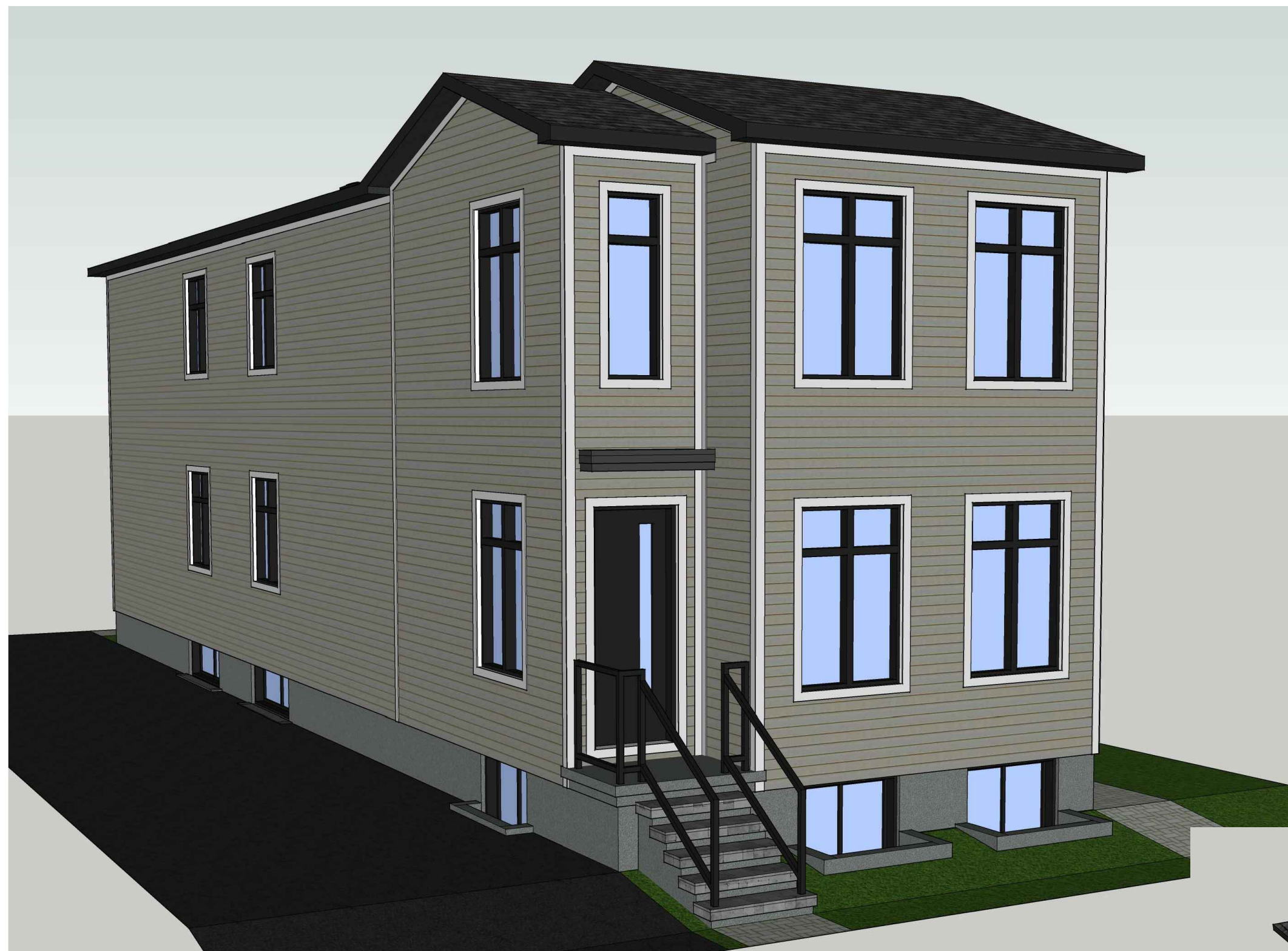
1 FRONT-RIGHT SIDE PERSPECTIVE