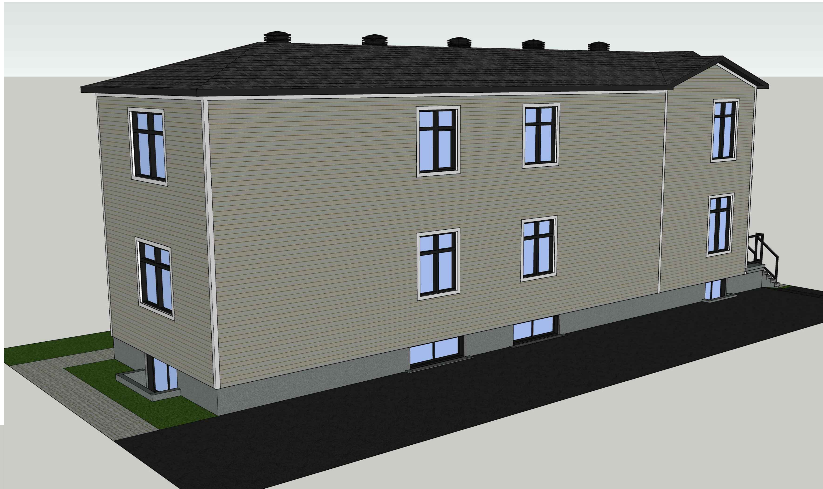
1 REAR-RIGHT SIDE PERSPECTIVE