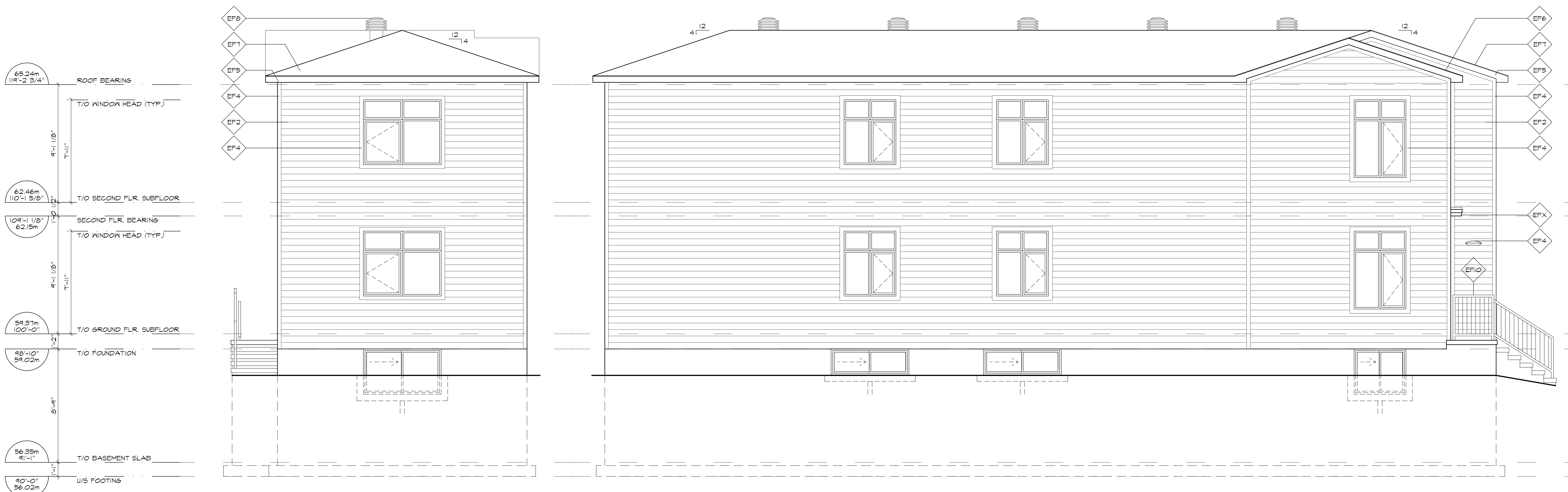
3 REAR ELEVATION SCALE: 1/4" = 1'-0"