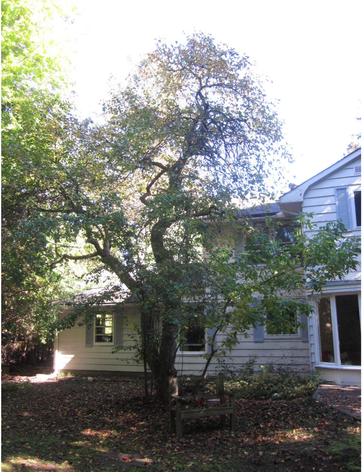
Picture 6. Tree #37, private crab apple at 14 Crescent Road, Rockcliffe