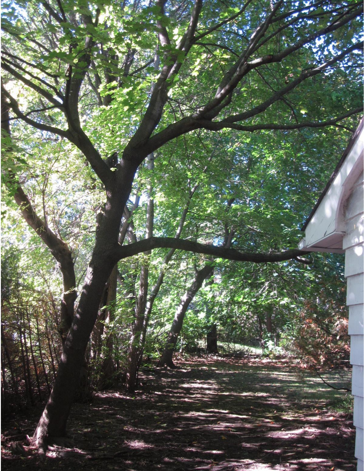
Picture 2. Trees #22 to 16 (foreground to background), on and adjacent to 14 Crescent Road, Rockcliffe