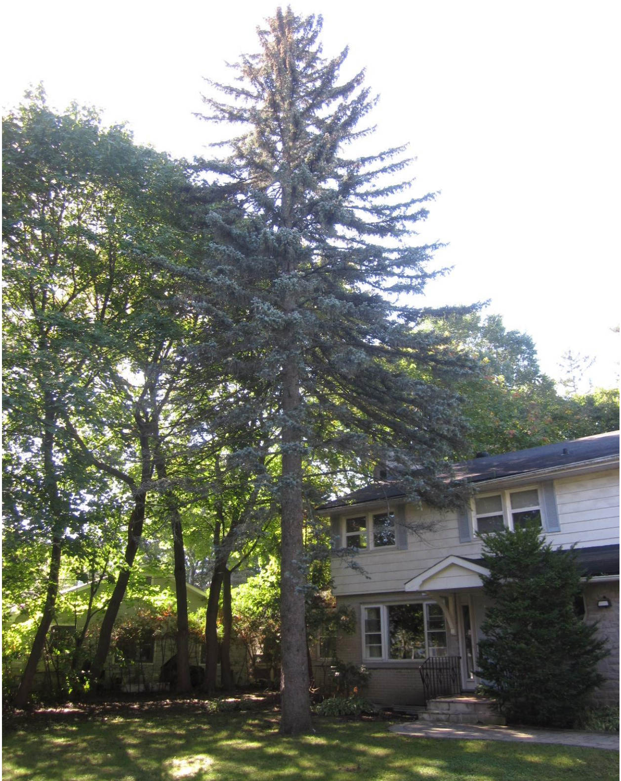
Picture 4. Tree #35, private Colorado spruce (foreground) and trees #23-28 (background right to left) at 14 Crescent Road, Rockcliffe