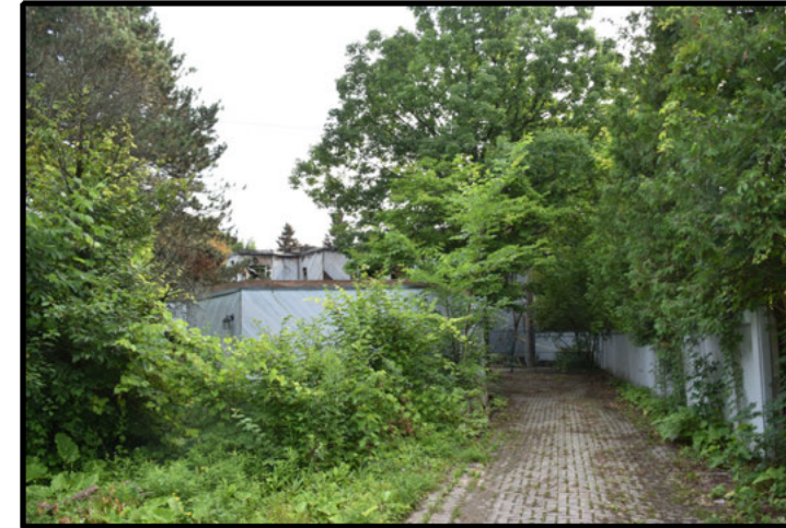
SUBJECT GARAGE - POST LOSS CONDITION SITE PHOTOGRAPH OBTAINED BY ROAR ENGINEER DATED JULY 8, 2024