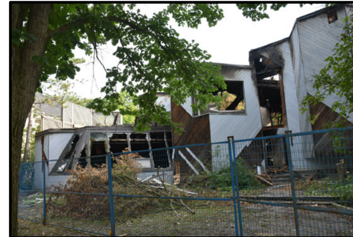
SUBJECT DWELLING - POST LOSS CONDITION SITE PHOTOGRAPH OBTAINED BY ROAR ENGINEER DATED JULY 8, 2024