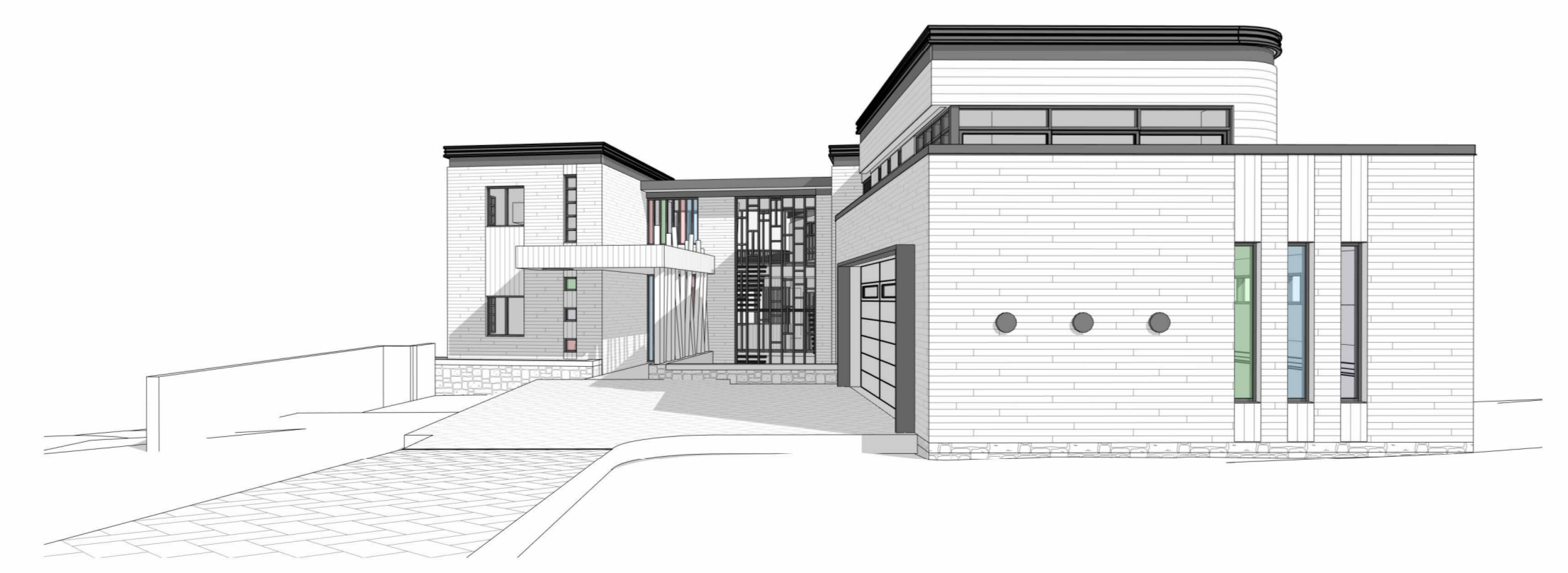
WEST ELEVATION PERSPECTIVE - MIDDLE