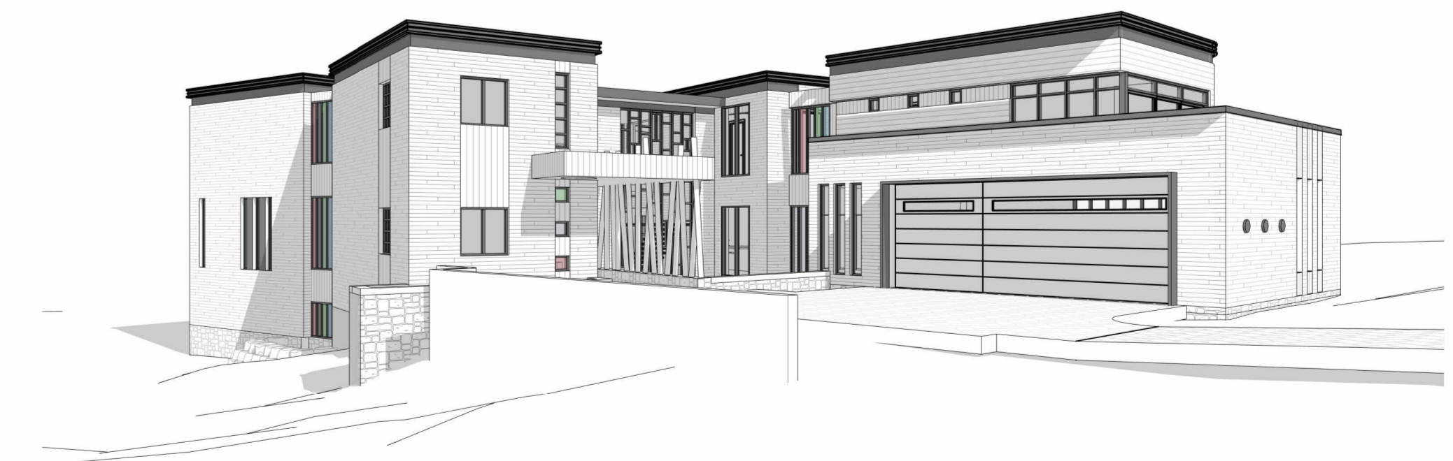
NORTH ELEVATION PERSPECTIVE - RIGHT