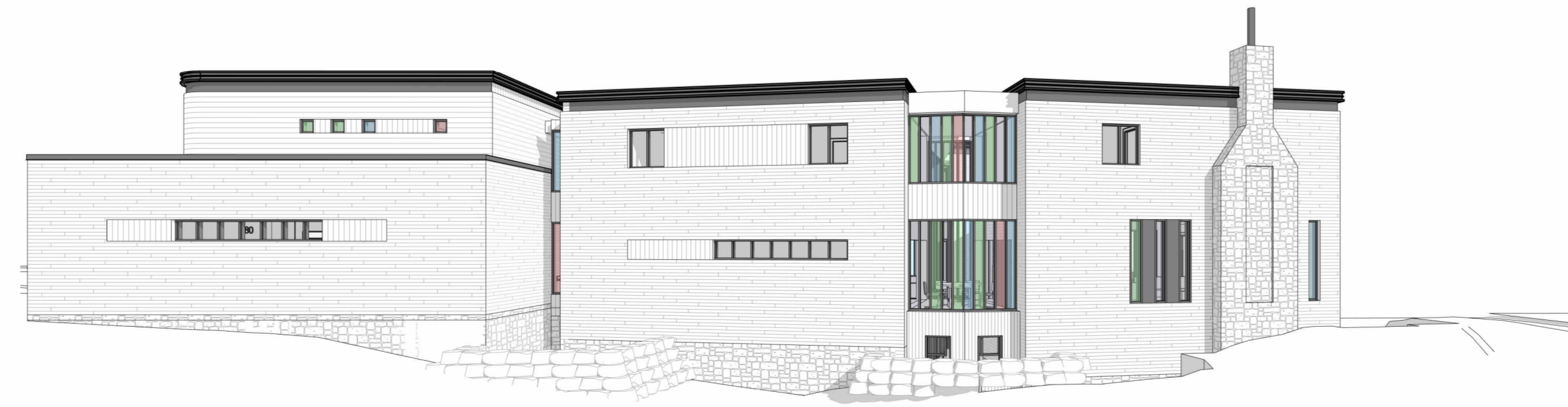
SOUTH ELEVATION PERSPECTIVE - MIDDLE