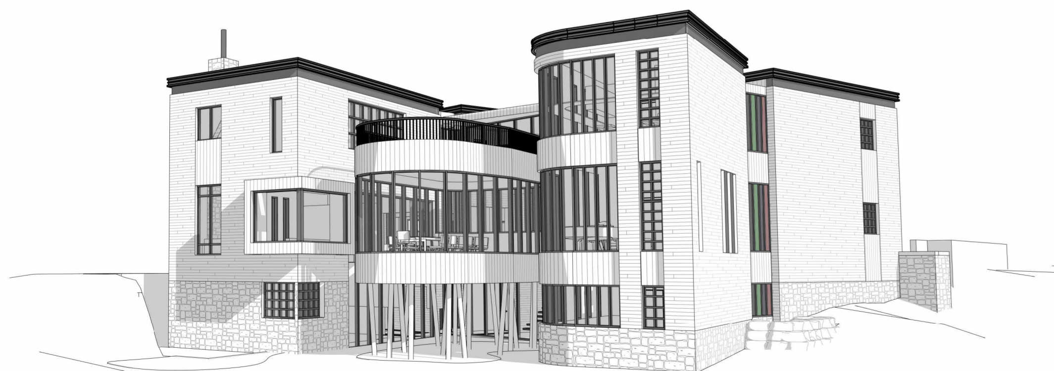
NORTH ELEVATION PERSPECTIVE - LEFT

no. revisions _____ date _____ stamp | timbre _____