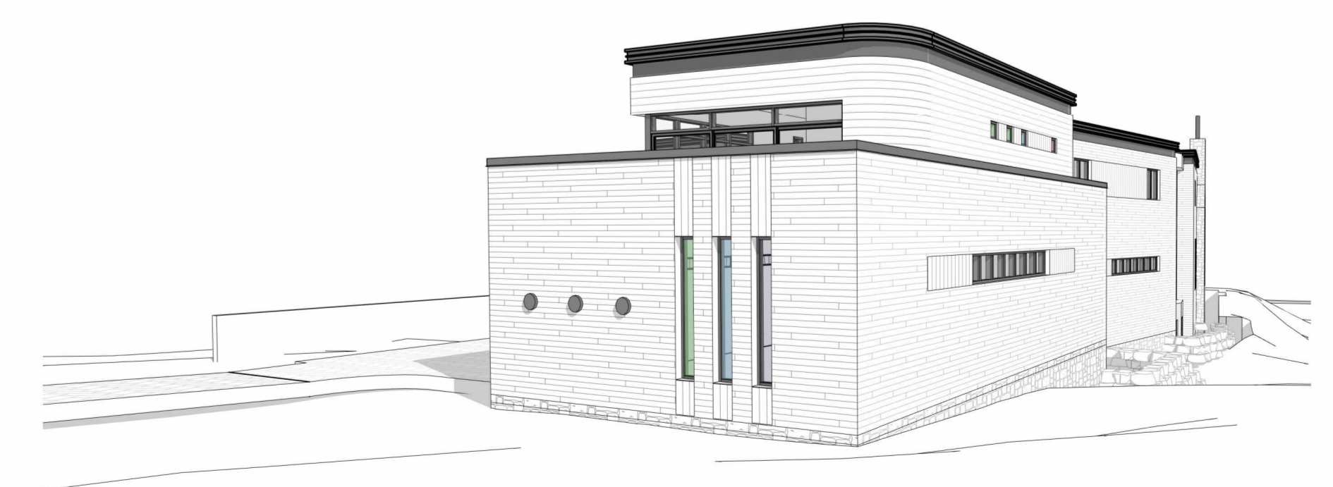
WEST ELEVATION PERSPECTIVE - RIGHT