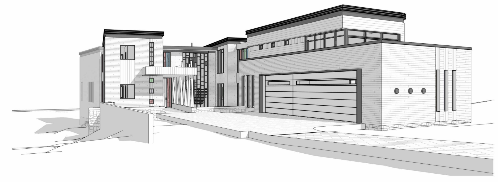
WEST ELEVATION PERSPECTIVE - LEFT

drawing number | numéro du dessin AD-203