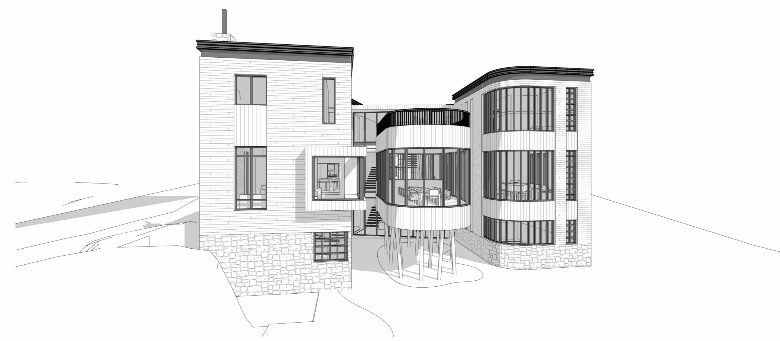
EAST ELEVATION PERSPECTIVE - MIDDLE

1 REAR (EAST) ELEVATION AD-201 1/4" = 1'-0"