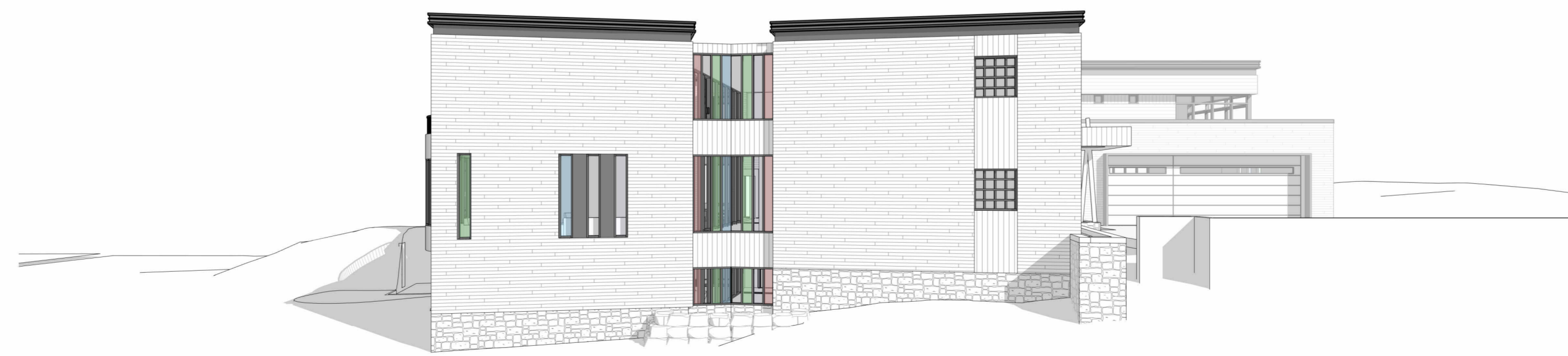
NORTH ELEVATION PERSPECTIVE - MIDDLE