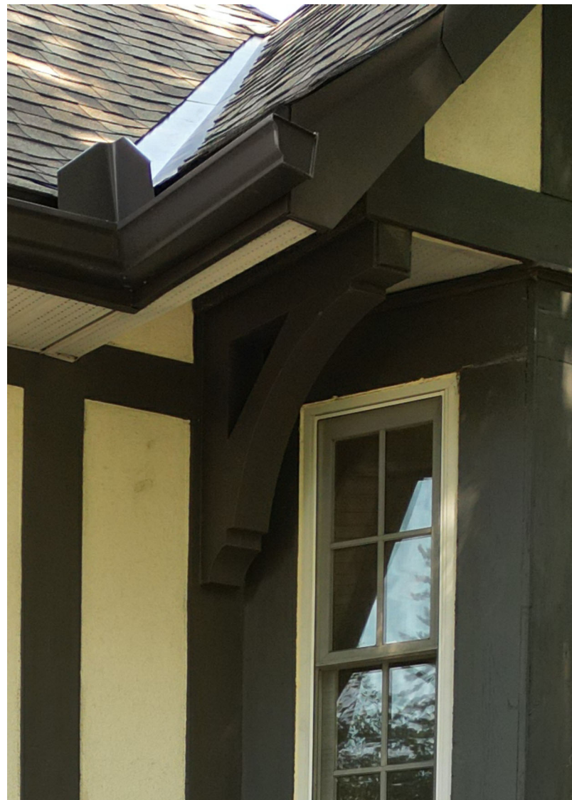
3 EXISTING BAY ORIGINAL BRACKETS - REINSTATE @ PORCH