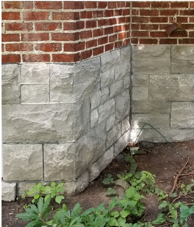
4 EXISTING STONE FOUNDATION & BRICK