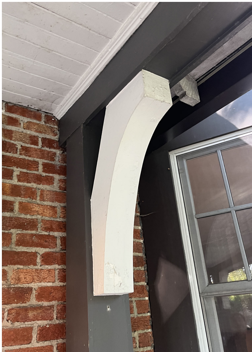
2 EXISTING PORCH DECORATIVE BRACKETS FOR REPLACEMENT