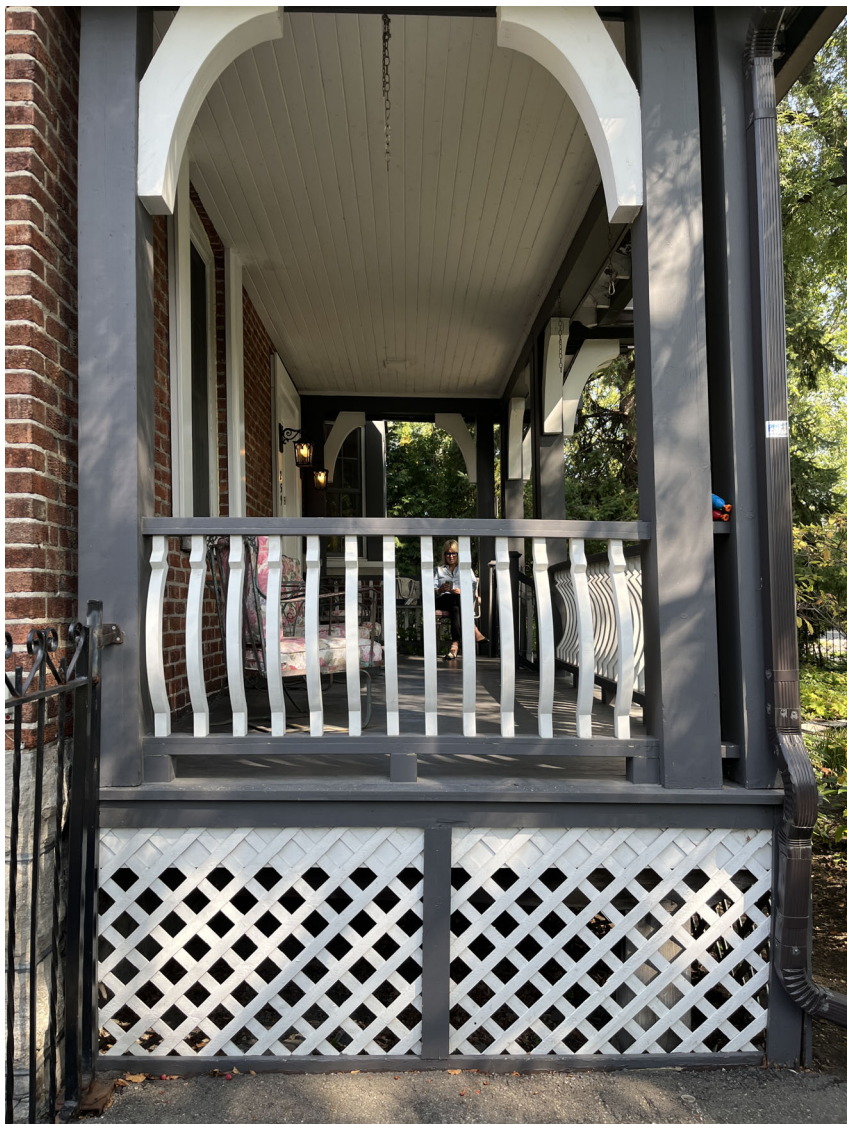
1 EXISTING FRONT PORCH CONDITION