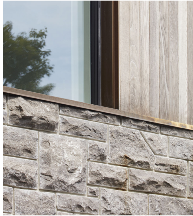
2 PROPOSED STONE, WOOD CLADDING, & BRONZE