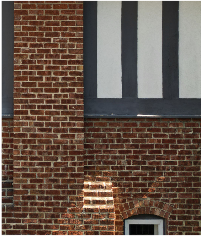
1 EXISTING HALF TIMBERING & BRICK