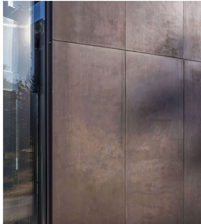
4 PROPOSED PATINAED BRONZE CLADDING