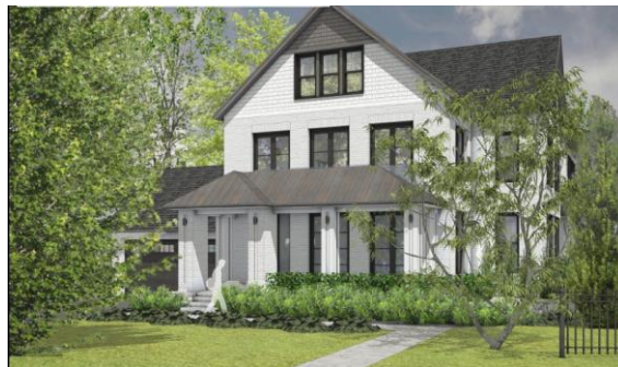
Views of the existing and proposed house illustrating the preserved Lisgar and Maple Lane entrance walk.