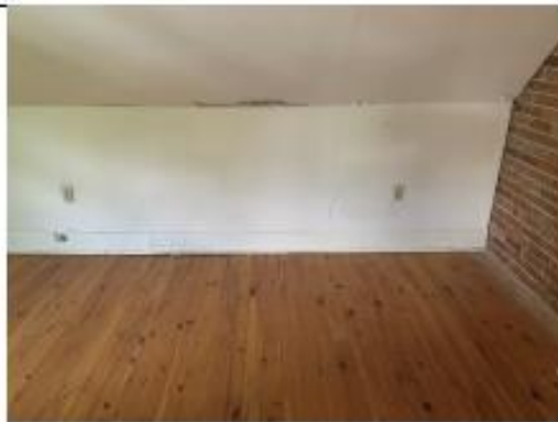
Photo 5: Third story SE corner water damage to finishes [JCAL 2021]