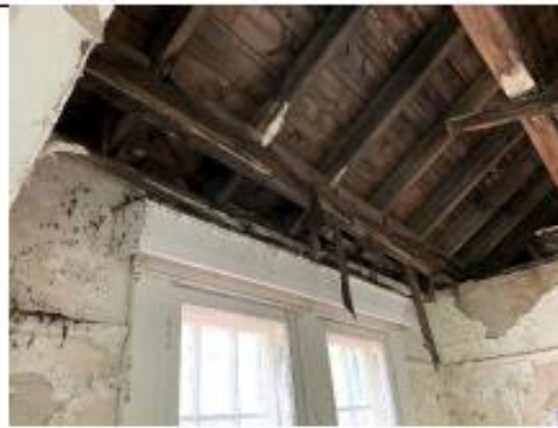
Photo 4: Closer view of damage and decay to top of exterior wall [JCAL 2021]