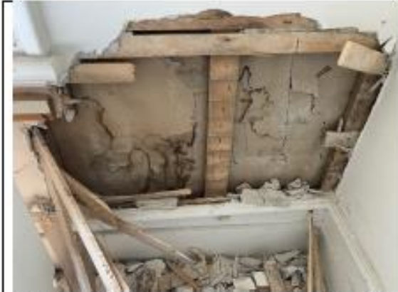
Photo 19: Ground floor wall opening- water damage and mold noted [JCAL 2021]