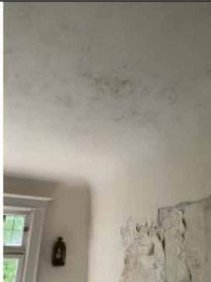
Photo 18: Ground floor west room mold on ceiling finishes [JCAL 2021]