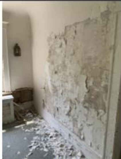
Photo 17: Ground floor west room water damage on interior wall [JCAL 2021]