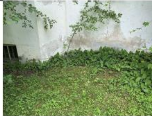
Photo 10: General poor condition of stucco at base of wall [JCAL 2021]