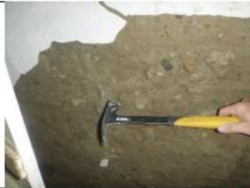
Photo 8: Soft concrete in the interior of the foundation wall [JCAL 2021]