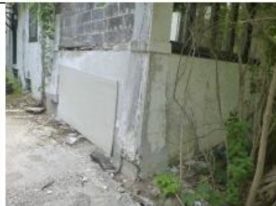
Photo 24: Foundation of sunroom addition in very poor condition. [JCAL 2021]