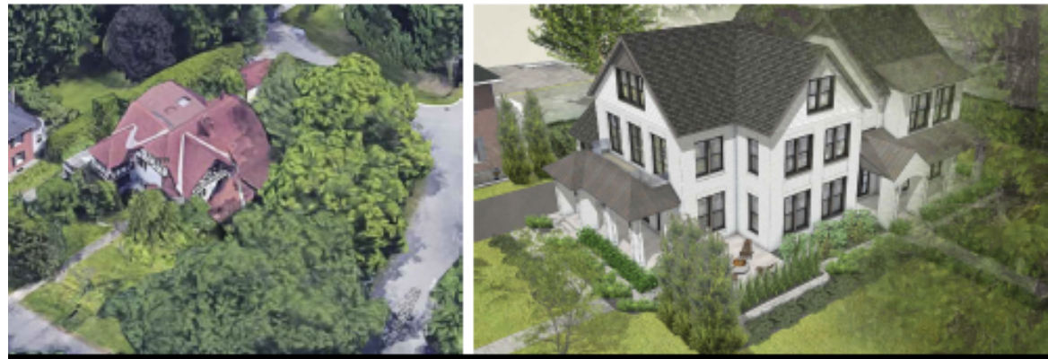
The two views (before and after) illustrate that the new house construction is compatible with, sympathetic to and has regard for the height, massing, and setbacks of the established heritage character of the streetscape in order to conserve the character and patten of the associated streetscape, while creating a distinction between new and old.