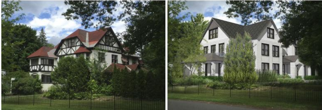
The two views (before and after) captures the spirit and character of the original building and maintains the parklike attributes, qualities, and atmosphere of the HCD with generous front yards and the retention of the existing trees, shrubs, hedges, and landscape features on public and private property.

The design of the replacement semi-detached embraces stated objects of the Rockcliffe Park Heritage District Plan including parklike attributes, generous amounts of soft landscape, sympathetic design in terms of height massing and materials.