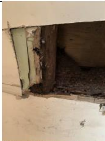
Photo 6: Third story north sloped roof; damage noted within roof and on roof joists [JCAL 2021]