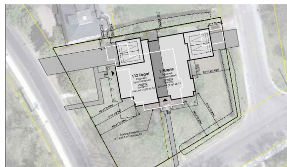
The two plans (existing and proposes) document that the existing lot patterns with separate entrances off of Lisgar and Maple Lane will be maintained. The locations of driveways are maintained at the rear of the property and are kept to a minimal to reduce the amount of hard landscape. GeoOttawa/Hobin Architecture.