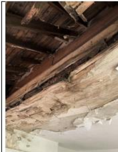
Photo 3: Closer view of damage and decay to edge of third floor framing [JCAL 2021]