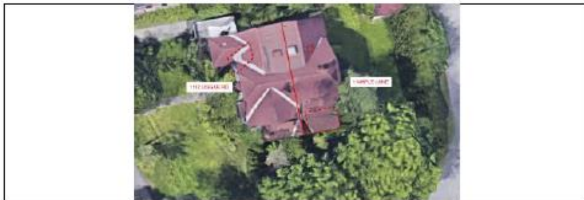
Figure 1: Roof plan with areas of deterioration outlined [JCAL 2021]