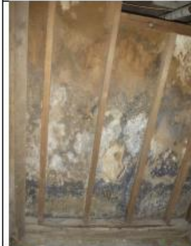
Photo 9: Interior basement wall typical condition with extensive mold. [JCAL 2021]