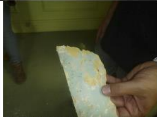
Photo 20: Mold noted on underside of ground floor ceiling wallpaper [JCAL 2021]