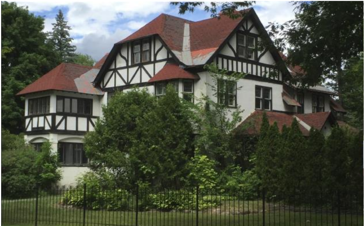
A view of the existing semi-detached from Lisgar with the two-storey sunroom/porch. Based on a comparison of the 1928 and 1965 aerial views it would appear to be an original feature. Below are views from the street documenting the bucolic landscape offering minimal visual access in keeping with picturesque principles.

A mature picturesque landscape with generous lawns, and a variety of deciduous and coniferous trees, with the semi-detached set well back from the street frontages with cedar hedges screening views and defining the properties.