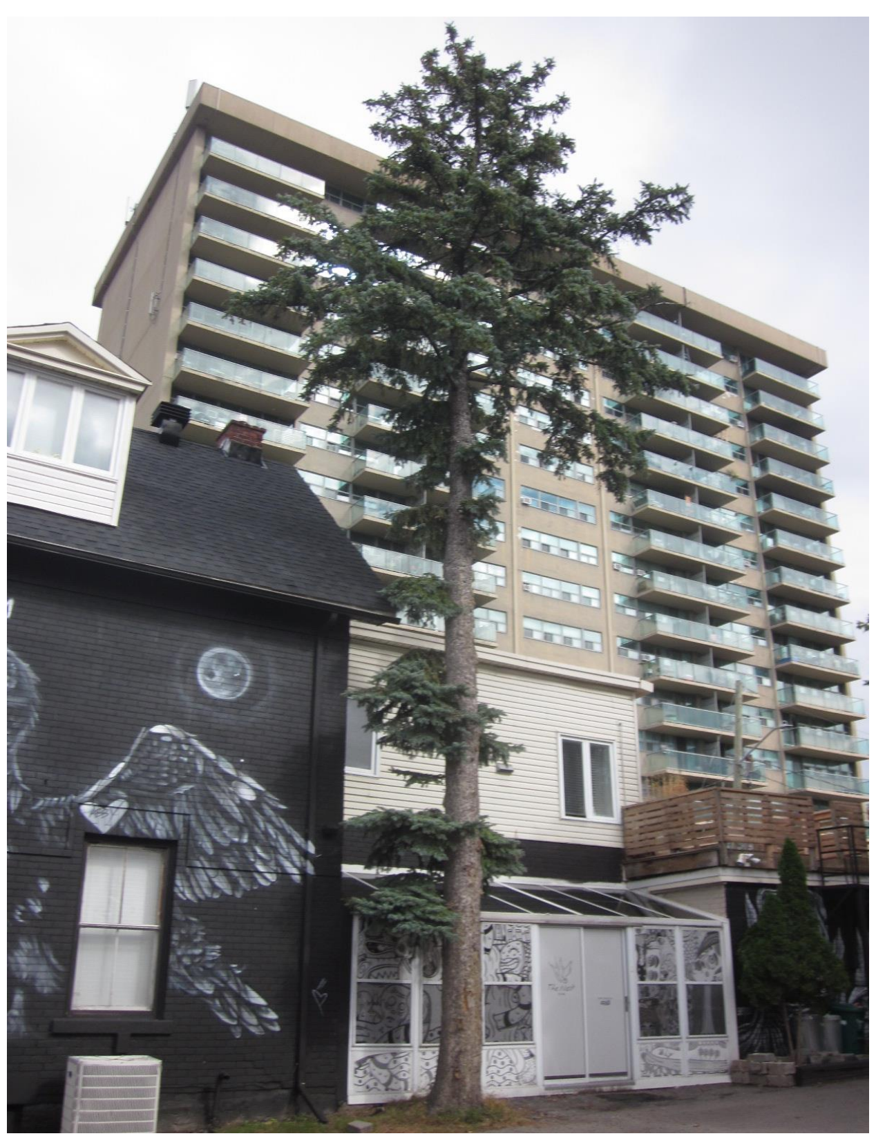
Picture 3. Tree #4, private Colorado blue spruce at 1088 Somerset Street