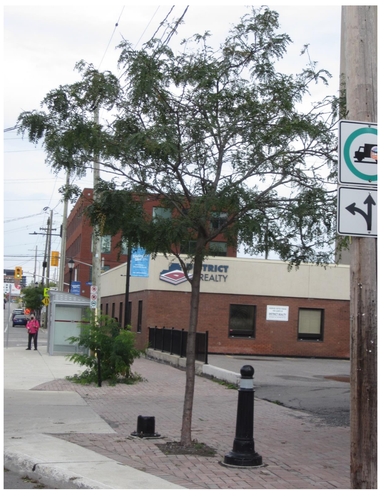
Picture 2. Trees #2 and 3 (background), honey-locusts on City property adjacent to 50 Baywater Avenue/1088 Somerset Street