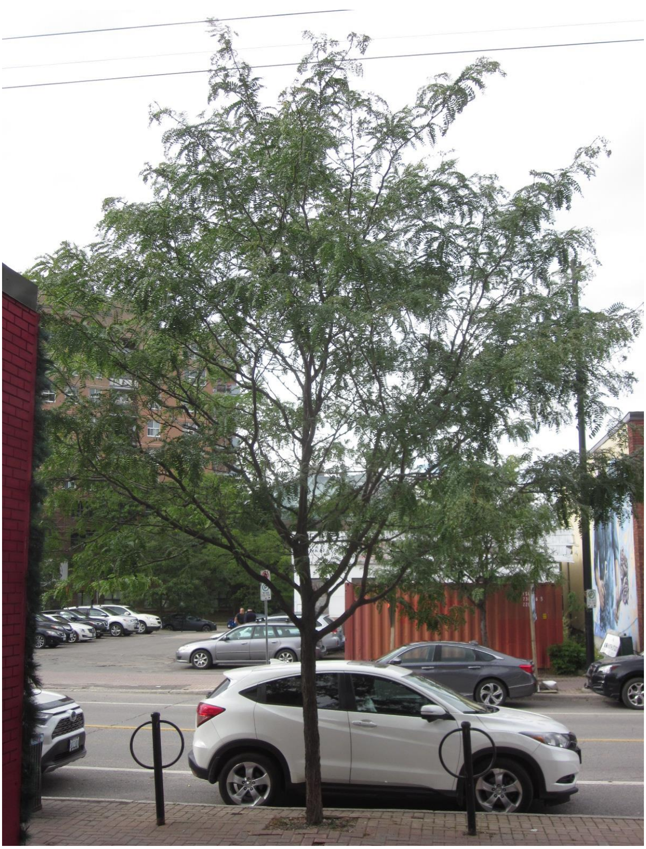
Picture 1. Tree #1, honey-locust on City property adjacent to 1088 Somerset Street