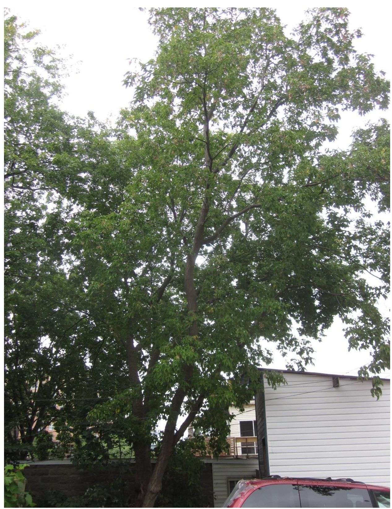
Picture 5. Tree #6, neighbouring Manitoba maple at 1088 Somerset Street