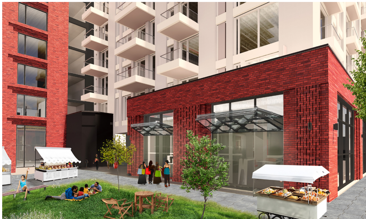
Vignette showing the Market Concept

Another unique element that has been planned, is a designated space for art. The art space has exterior access from the east lane and on the west side next to the park with a feature wall along the exterior pedestrian passage. This feature wall within the exterior passage is envisioned as a sawtooth wall with solid fins and glazed windows to allow for a seamless transition between the interior space and the exterior passage that can house art exhibitions, murals, and feature lighting.