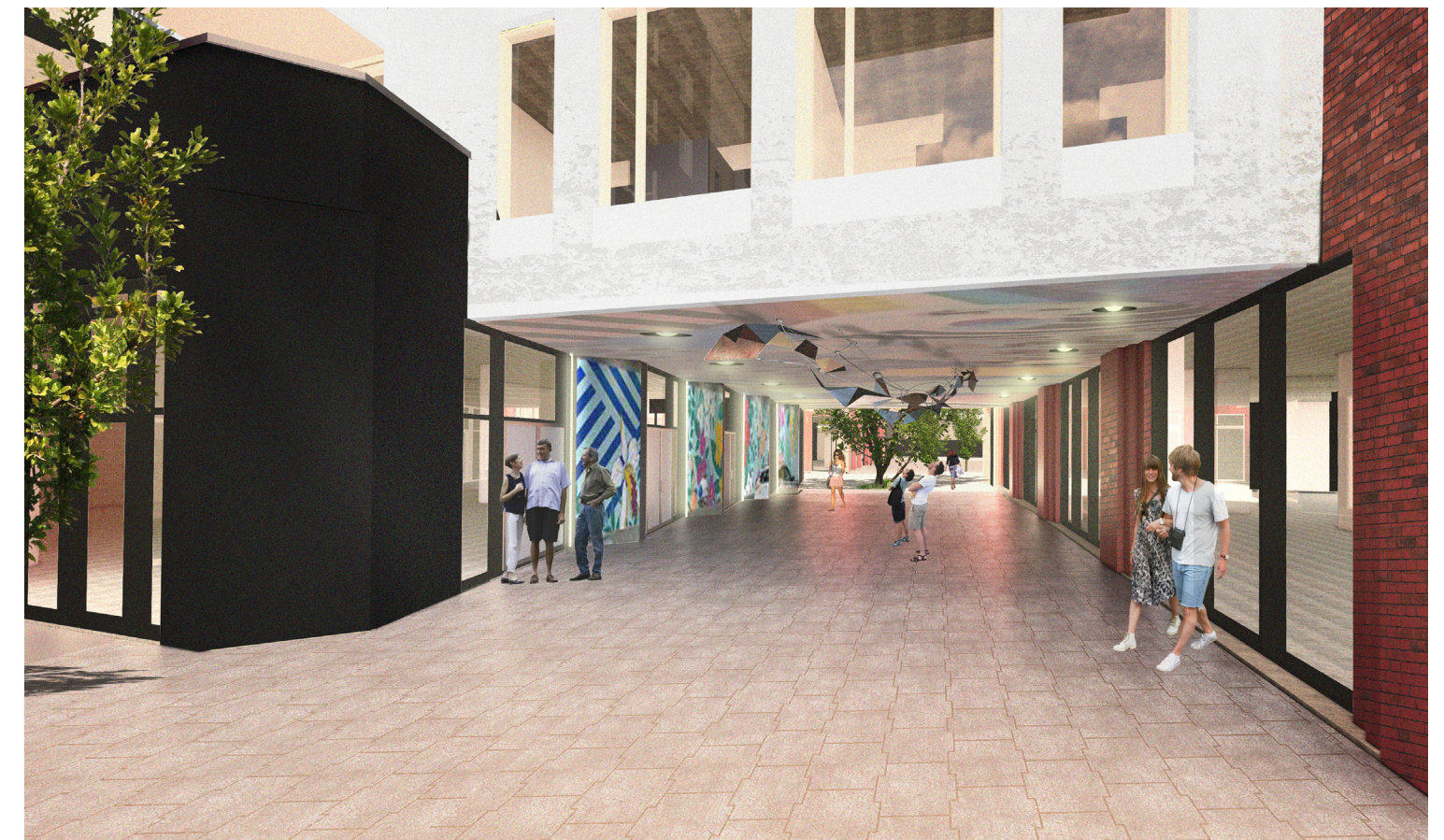
Vignette showing the Art Space and Pedestrian Underpass