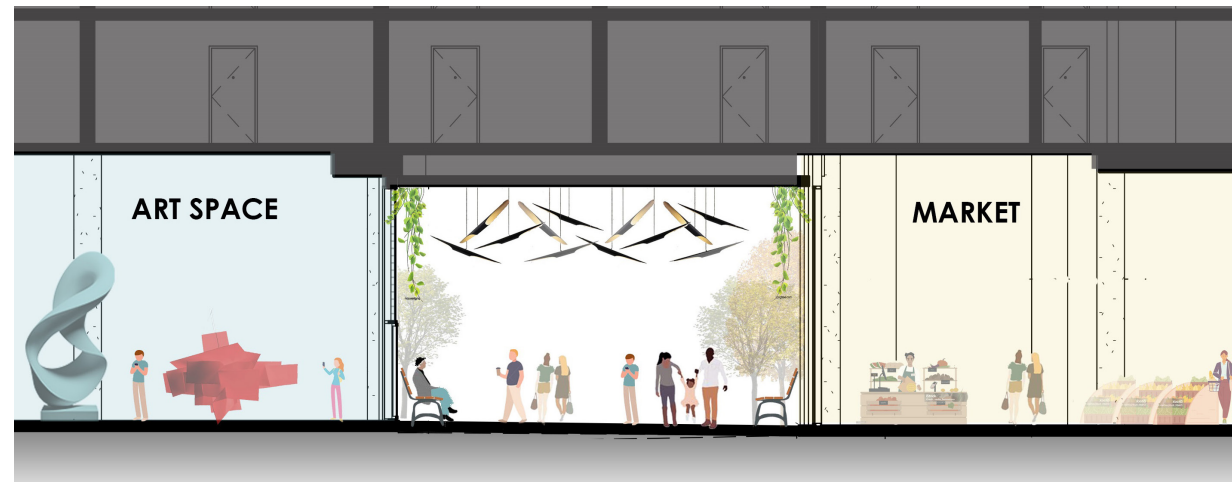
Section Showing the Art Space and Exterior Passage