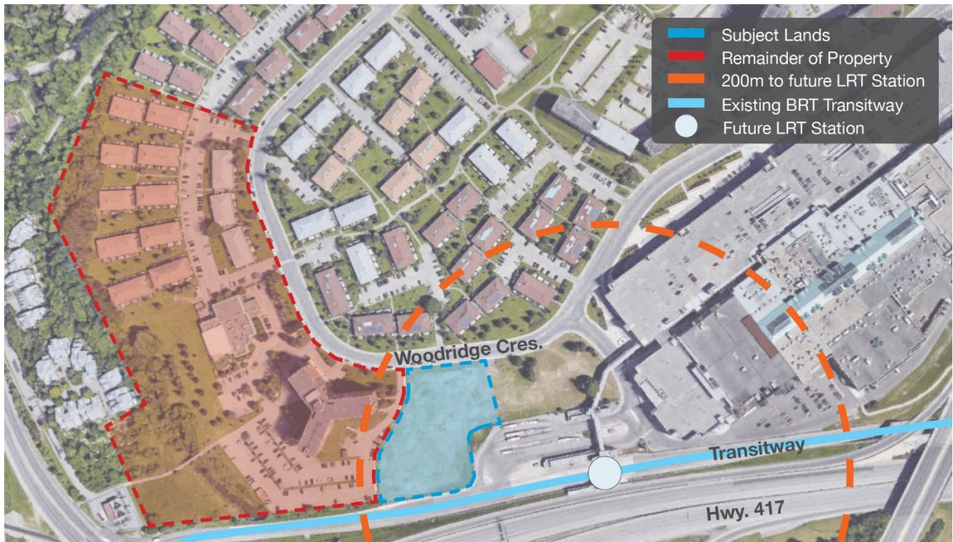
Figure 1: Aerial Image of Subject Property and Surrounding Context.

The subject lands, known municipally as 70 and 80 Woodridge Crescent, are located in the Bay Ward (Ward 18) in the City of Ottawa. The entirety of the property is located on the south-west side of Woodridge Crescent and has approximately 397.74 metres frontage and a total area of 83.3 hectares. The vacant portion of the property (where the proposed development is located) comprises approximately 0.39 hectares and a frontage of 63 metres. The subject property is currently vacant of development and void of significant vegetation. The property abuts the existing Bayshore Bus Rapid Transit (BRT) station, which is currently being redeveloped into a Light Rail Transit (LRT) station will be a critical gateway from public transit into Accora Village.