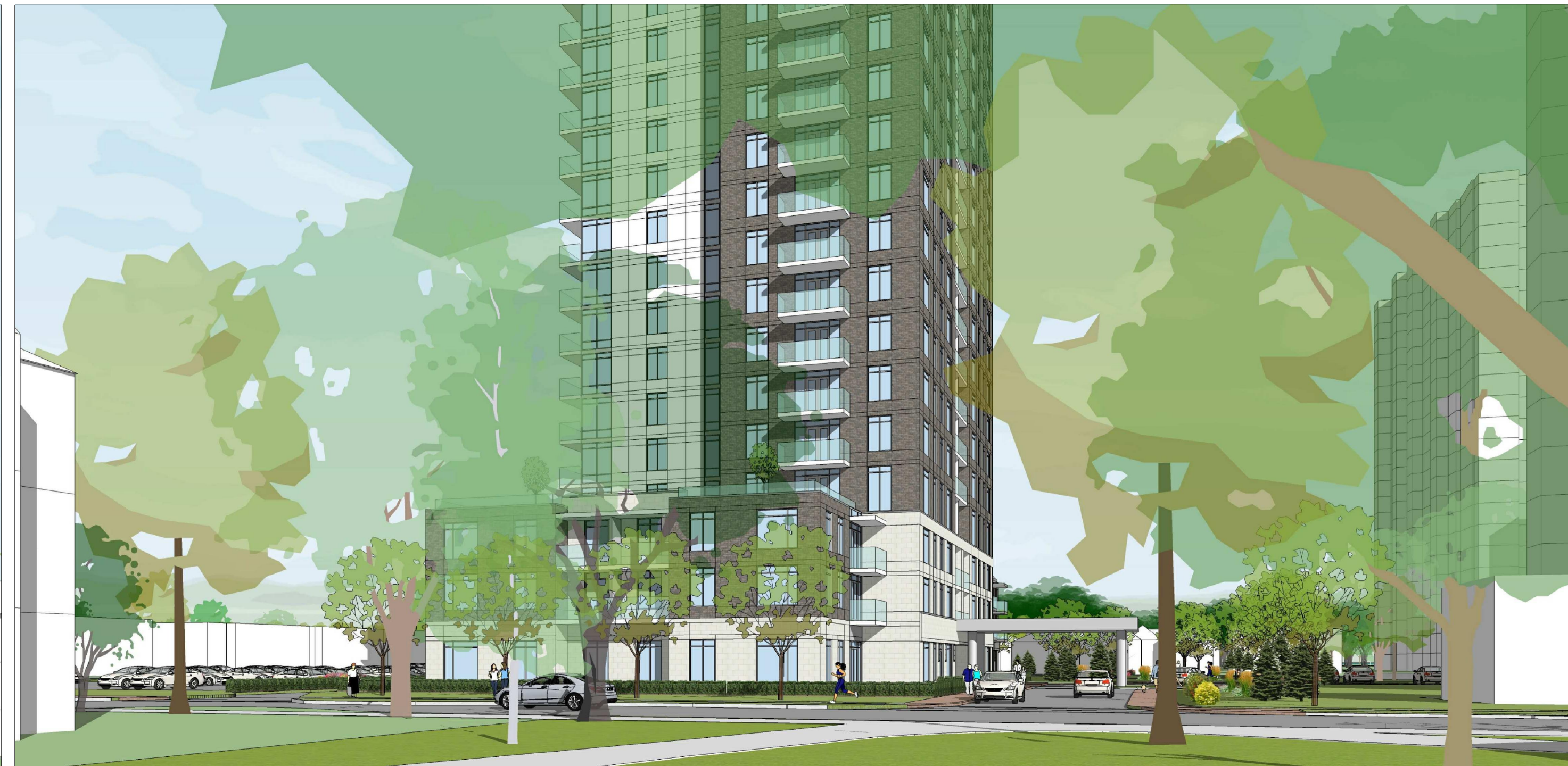
LOOKING NORTHEAST TOWARD THE BUILDING ENTRANCE