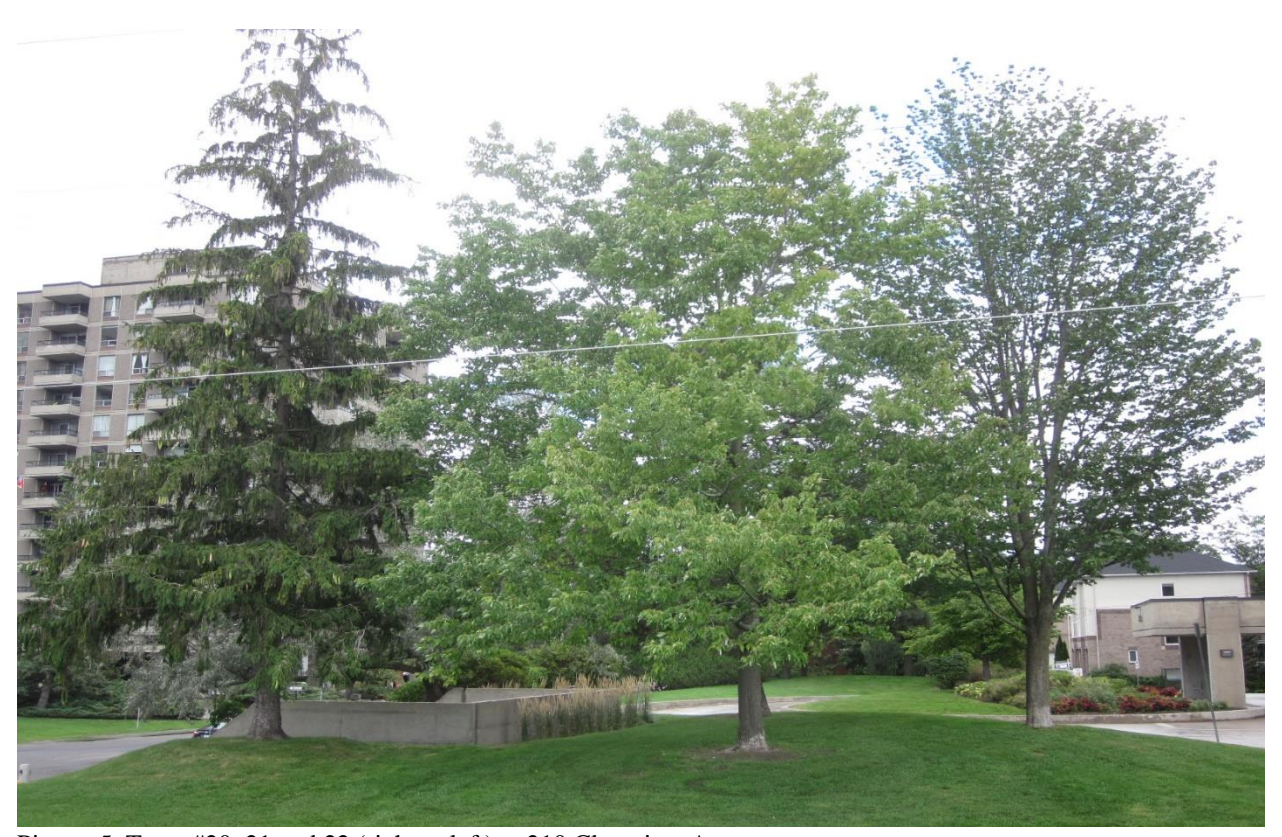
Picture 5. Trees #20, 21 and 22 (right to left) at 210 Clearview Avenue