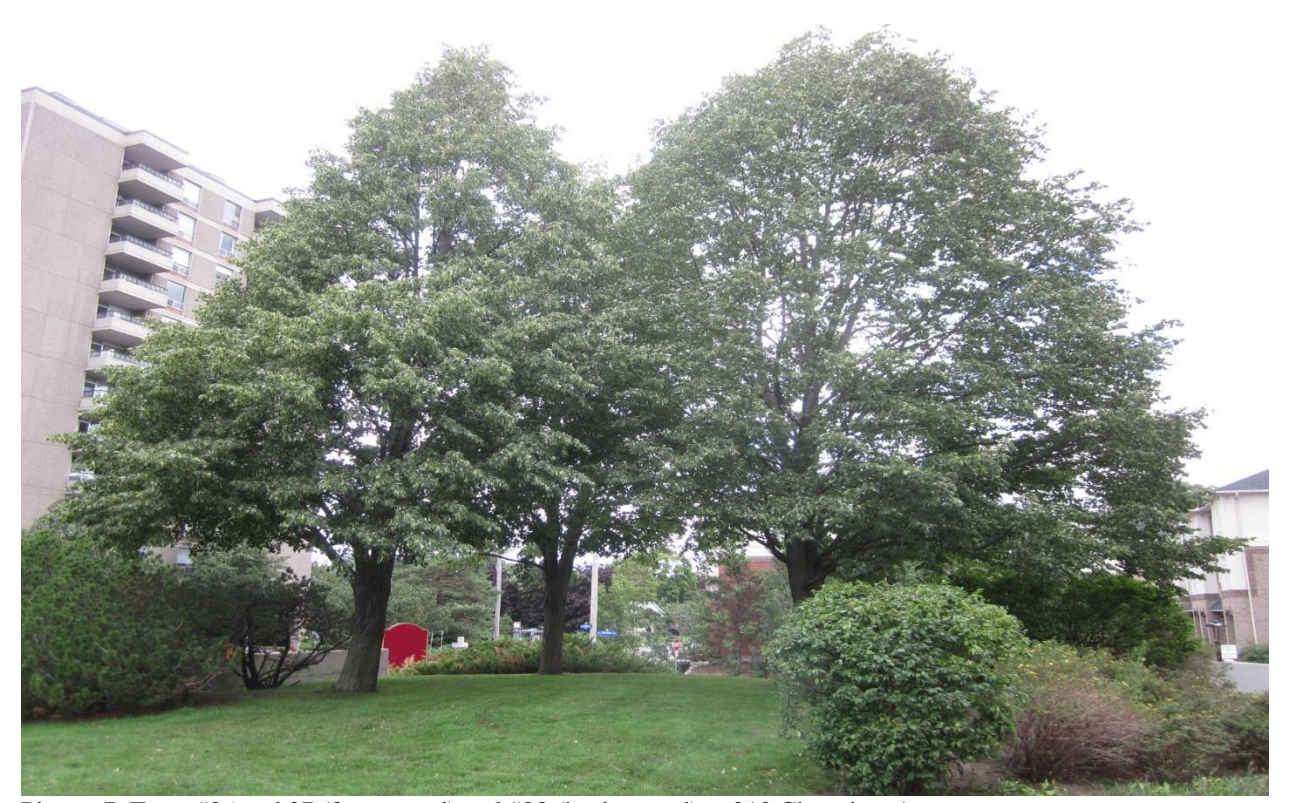
Picture 7. Trees #26 and 27 (foreground) and #28 (background) at 210 Clearview Avenue