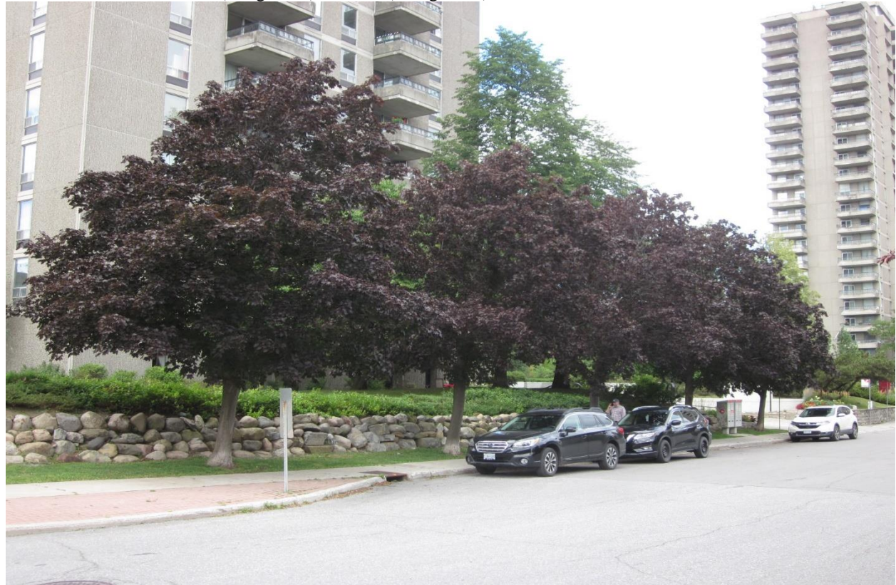
Picture 8. Trees #30, 32 and 35-37 (right to left) at 210 Clearview Avenue