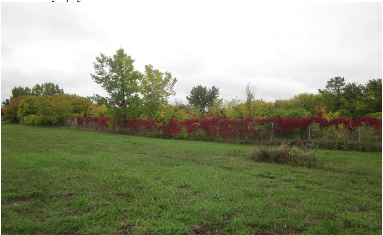
Picture 6. Tree grouping D at 1987 Robertson Road