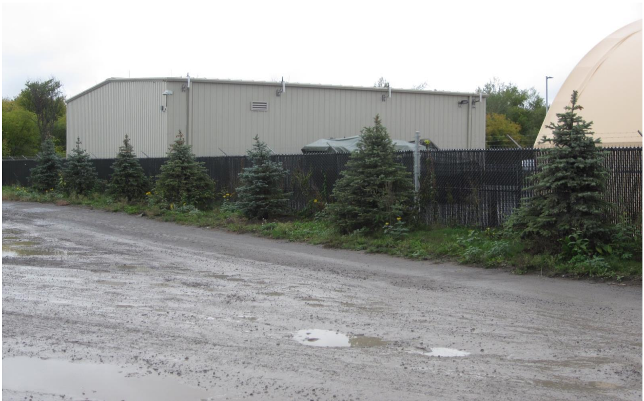
Picture 1. Tree grouping A at 1987 Robertson Road