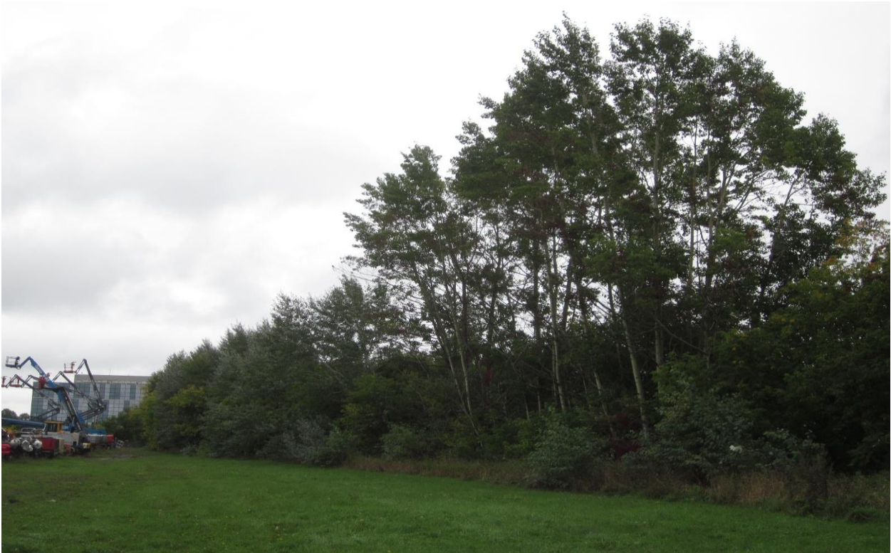
Picture 8. Tree grouping E at 1987 Robertson Road