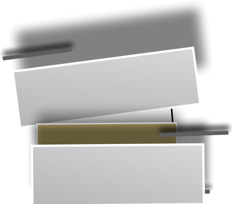
Typical Floor Plate