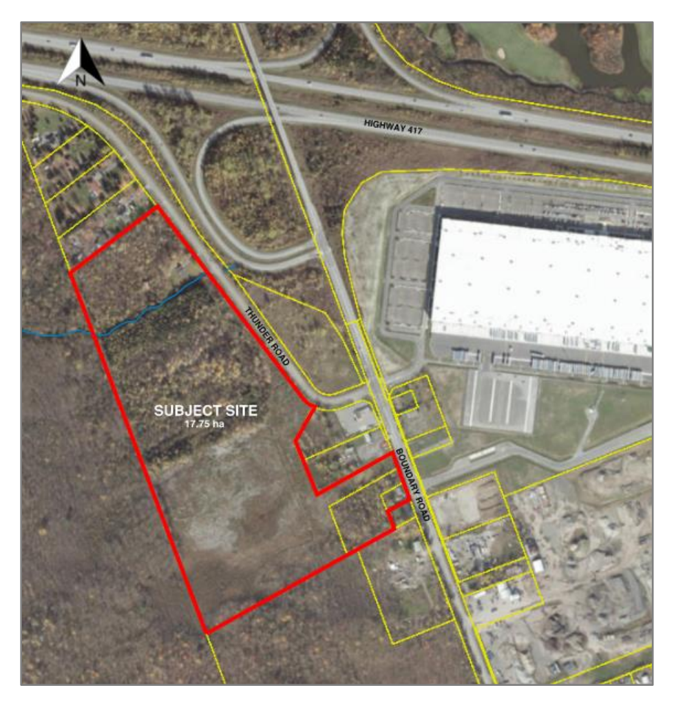
Figure 1: Arial View of Subject Lands

LRL Associates Ltd. was retained by Avenue 31 to prepare a functional serviceability report to support the Official Plan Amendment and Zoning By-lay amendment application for the property located at the south west corner of the intersection of Boundary Road and Thunder Road in Ottawa ON. The subject land encompasses three (3) separate properties as shown in Figure 1 below. The civic address' for the parcels are 6150 Thunder Road, 5368A Boundary Road and 5368B Boundary Road.