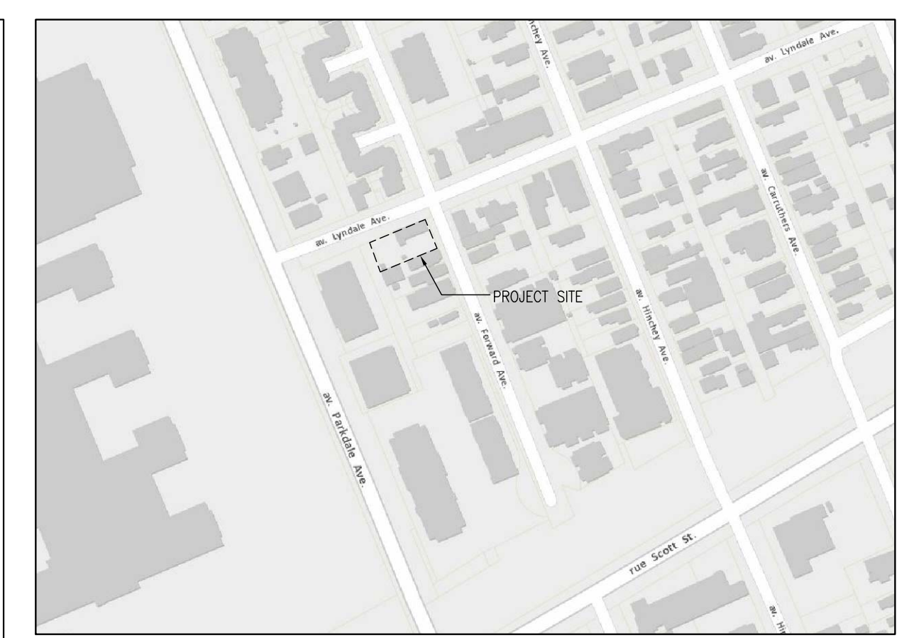
1 LOCATION PLAN SP-01 SCALE: NTS

TOPOGRAPHIC PLAN OF SURVEY OF LOT 12 REGISTERED PLAN 35 CITY OF OTTAWA FAIRHALL, MOFFAT & WOODLAND LIMITED 2016 JOHN H. GUTRI, O.L.S.