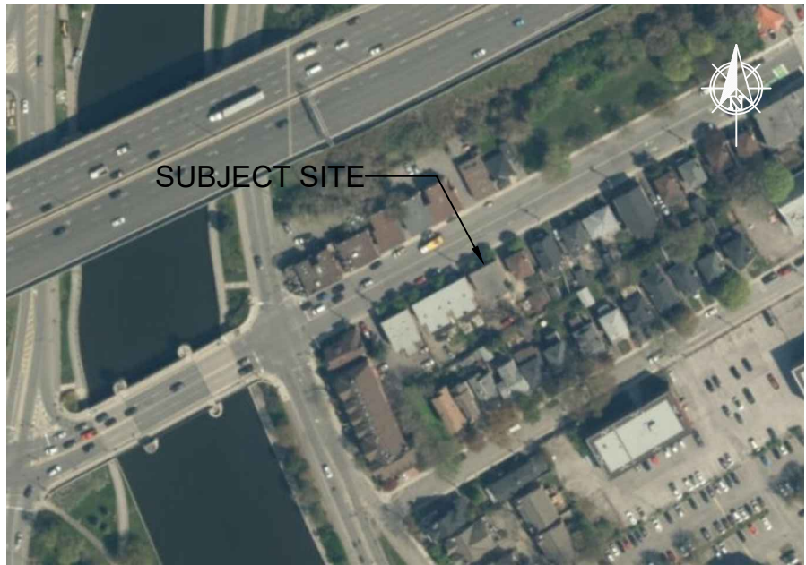
LOCATION PLAN (SCALE N.T.S)