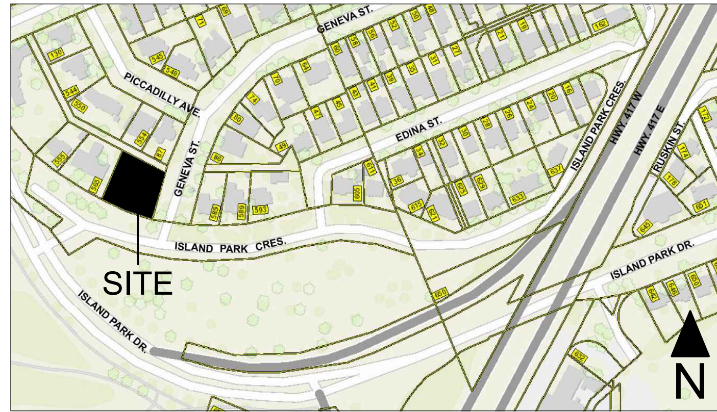
1 LOCATION MAP SCALE: N.T.S.