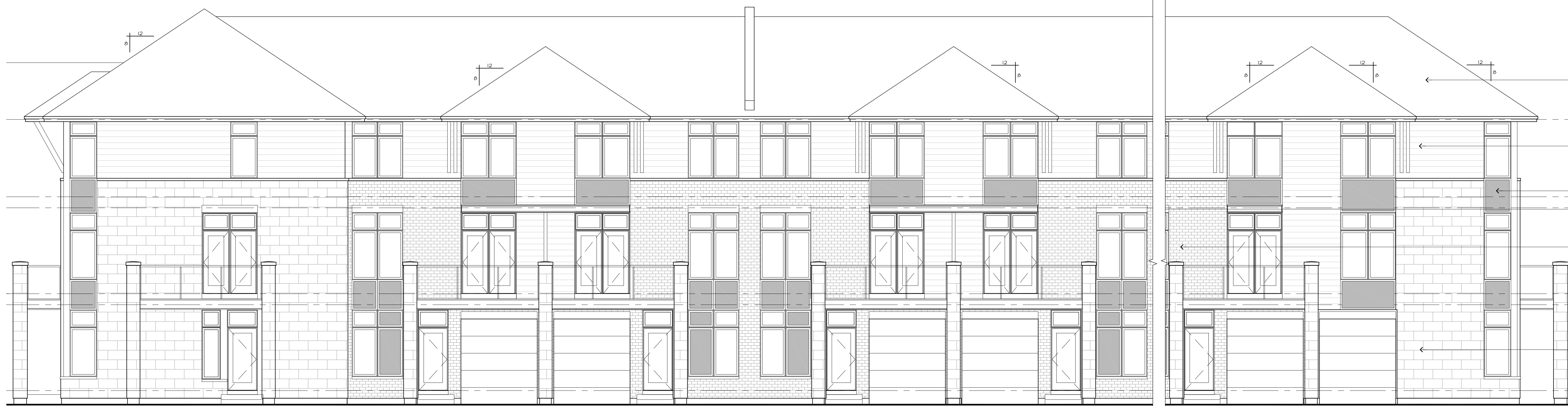
BLOCK 'A', 'D', 'C', 'F' NORTH & SOUTH ELEVATIONS